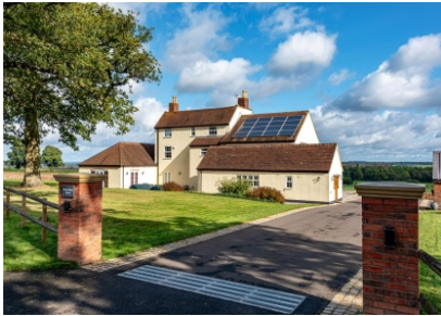
Home Farm, Gatacre, Claverley, Wolverhampton