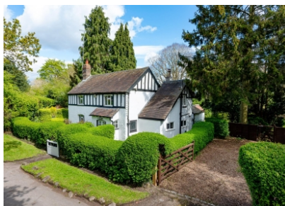
The Croft, 120 Post Office Road, Seisdon, Wolverhampton