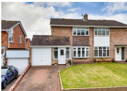
34 Sandy Lane, Codsall, WV8 1EJ