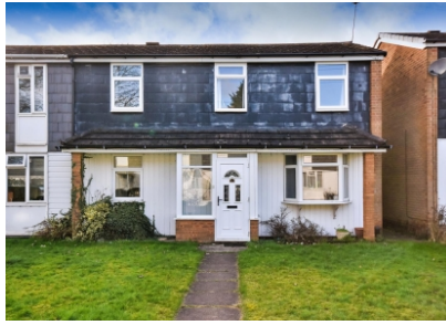
11 Woodside, Ashmore Park, Wolverhampton