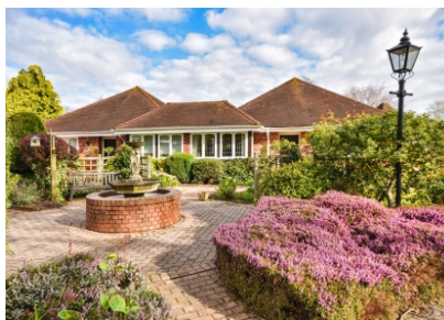
45 The Beeches, Hanover Court, Tettenhall, WV6 8QL