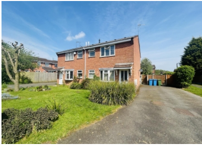
5 Coulter Grove, Perton