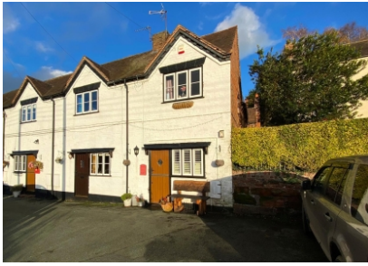
26c Bernards Hill, Bridgnorth