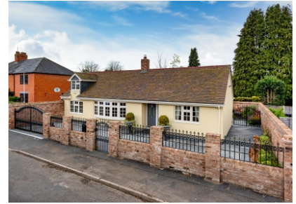
4 Mayfield Road, Albrighton, WV7 3JY