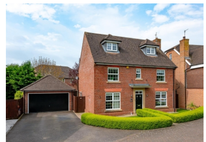
49 Old Farm Drive, Codsall, Wolverhampton. WV8 1GF