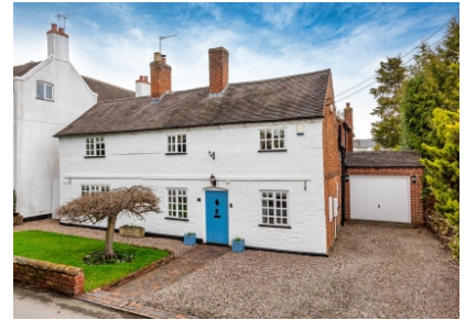
Garden Cottage, 4 Shop Lane, Brewood