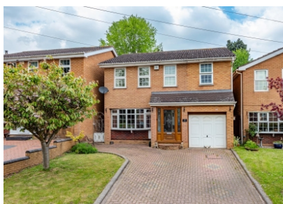
The Holloway, Swindon, Dudley