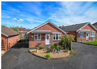
105 Hook Farm Road, Bridgnorth