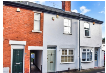
15 Nursery Walk, Tettenhall, Wolverhampton