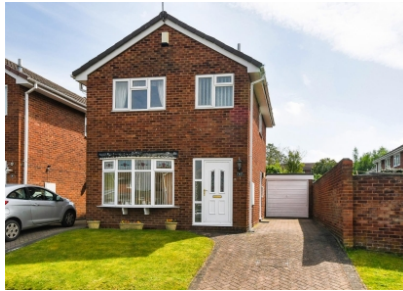
Millfields Way, Wombourne, Wolverhampton