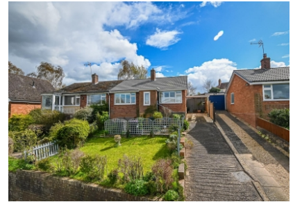
24 Greenfields Road, Bridgnorth