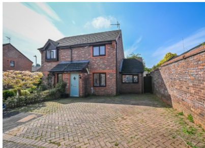
24 Wardle Close, Bridgnorth