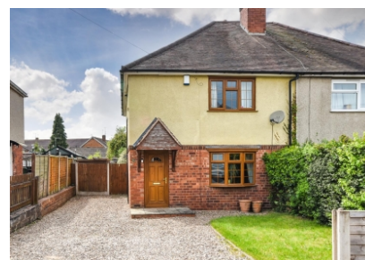
Redhill Avenue, Wombourne, Wolverhampton