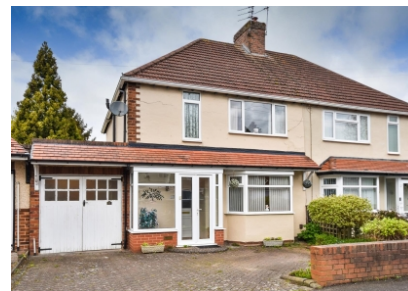
Linton Road, Wolverhampton