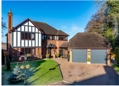
47 Fairfield Drive, Codsall, Wolverhampton