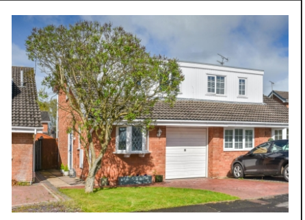
39 Mercia Drive, Perton, Wolverhampton