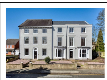
Flat 3, 228 Penn Road, Wolverhampton