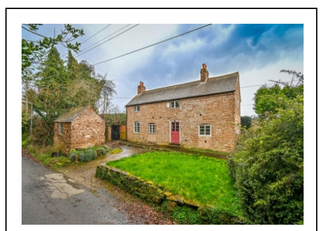
148 Broad Oak, Six Ashes