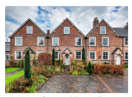
2 Labernum Cottages, Vicarage Road, Penn, Wolverhampton