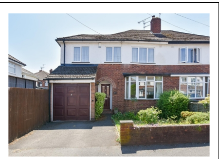
57 York Road, Wolverhampton