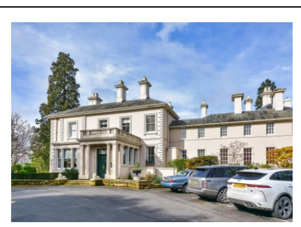
5 Old Hall, Wergs Hall, Wolverhampton