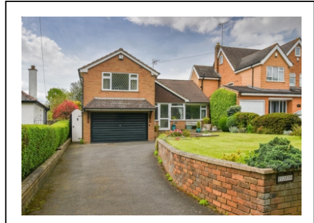
Stourbridge Road, Wombourne, Wolverhampton