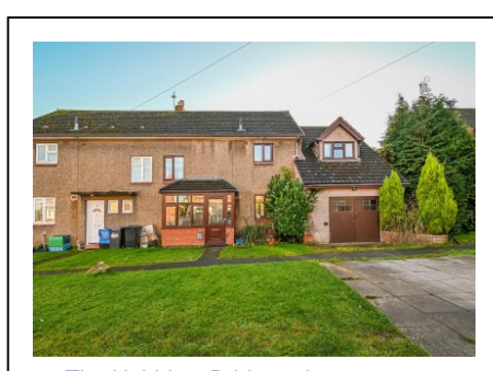
74 The Hobbins, Bridgnorth