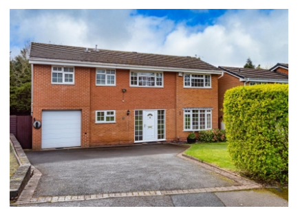
11 Swallowdale, Wightwick, Wolverhampton