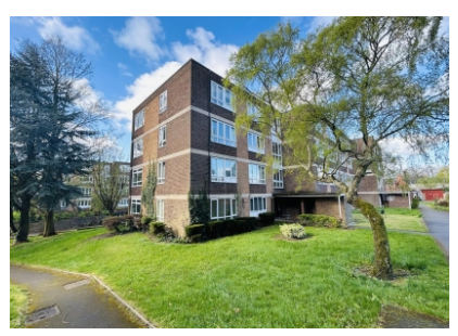
41 Upper Street, Tettenhall