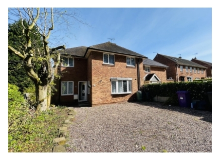
226 Castlecroft Road, Castlecroft