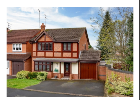
19 Penleigh Gardens, Wombourne, Wolverhampton