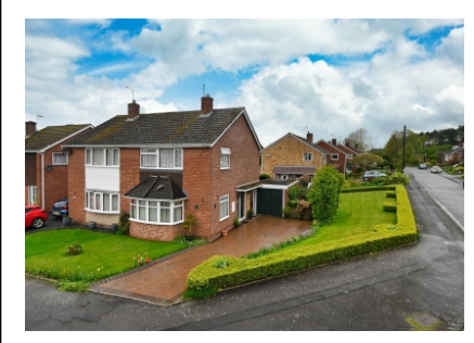
3 Hillside Avenue, Bridgnorth