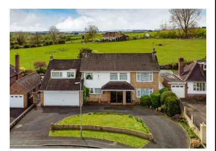
7 Wightwick Hall Road, Wightwick