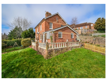
2 Rose Lane, Bridgnorth