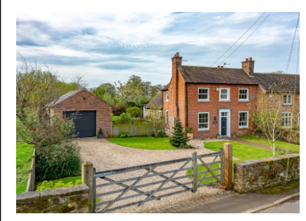
The Little House, 7 Tong Norton, Shifnal