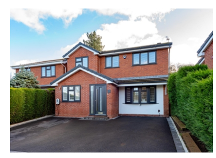
41 Ascot Drive, Dudley