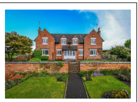
Lower Snowdon Cottage, Snowdon Road, Burnhill Green, Wolverhampton