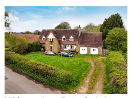
Mill Cottage, Lower Rudge, Pattingham, Wolverhampton