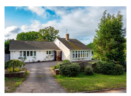
12 Keepers Lane, Codsall, Wolverhampton