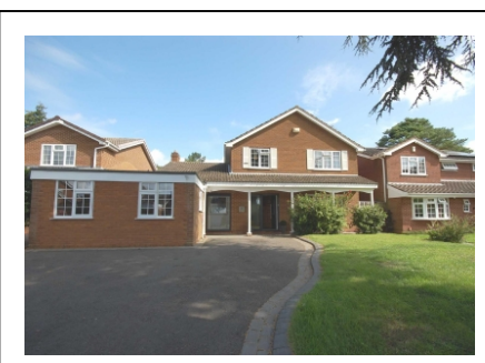
18 Saxon Court, Tettenhall