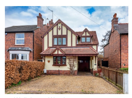
25 Walk Lane, Wombourne, Wolverhampton