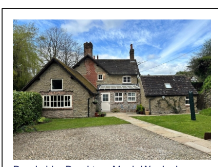
Brookside, Brockton, Much Wenlock