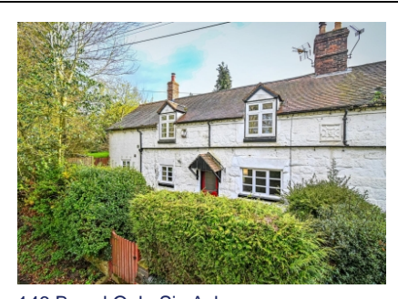
146 Broad Oak, Six Ashes