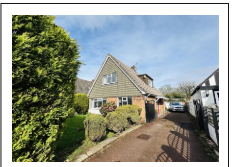
62 Mount Road, Tettenhall