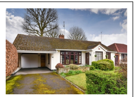
30 Sabrina Road, Wightwick, Wolverhampton