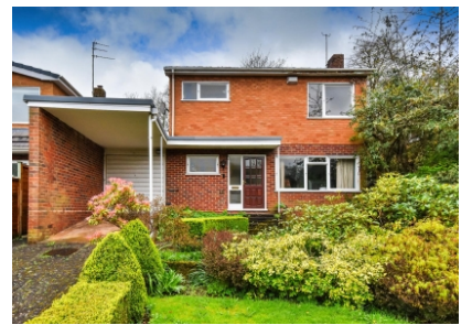
10 Ashfield Road, Compton, Wolverhampton