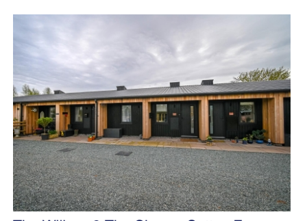
The Willow, 3 The Closes, Sutton Farm, Claverley, Wolverhampton