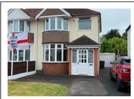
25 Elm Avenue, Wolverhampton, WV11