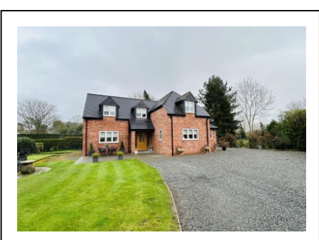
Ketley View, School Road, Trysull