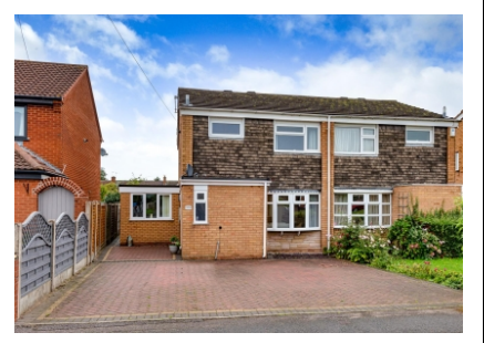
148a Birches Road, Codsall, Wolverhampton