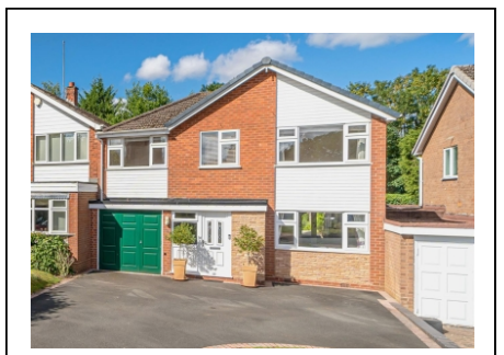
2 Whiteladies Court, Albrighton, Wolverhampton