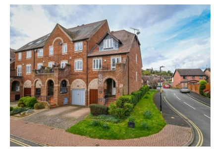
36 Southwell Riverside, Bridgnorth