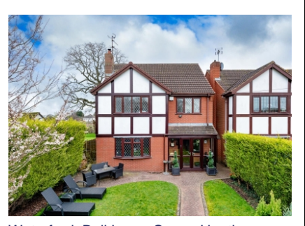
Waterford, Ball Lane, Coven Heath, Wolverhampton