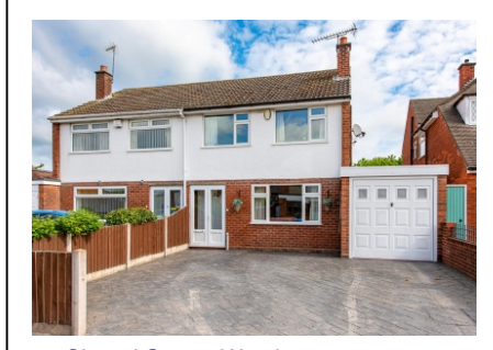
19 Chapel Street, Wombourne