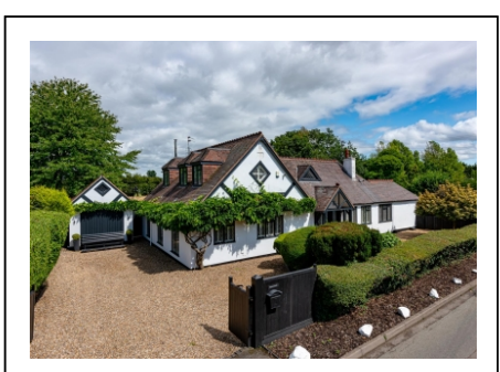
Pennygate, Paradise Lane, Slade Heath, Wolverhampton