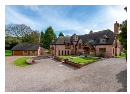
Meadowcroft, Pitchcroft Lane, Chetwynd Aston, Newport