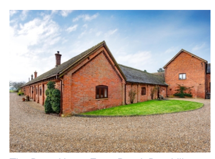
The Byre, Home Farm Road, Burnhill Green, Wolverhampton