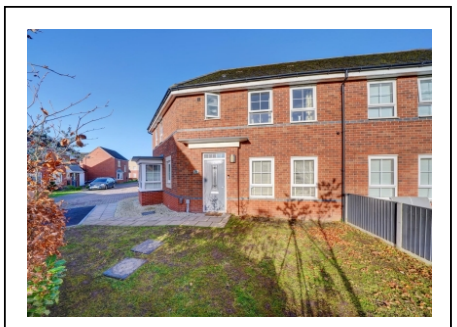
26 Rainsford Crescent, Kidderminster