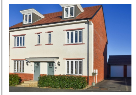
11 Marshall Way, Codsall, Wolverhampton