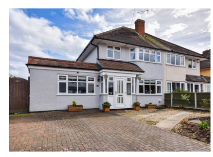
34 Delaware Avenue, Albrighton