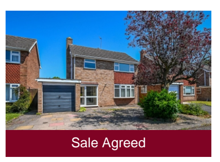
14 The Orchard, Albrighton, Wolverhampton