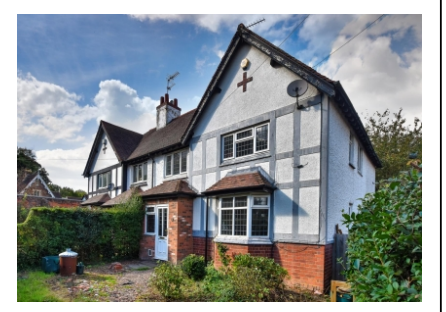
2 Danescourt Cottages, Danescourt Road, Tettenhall