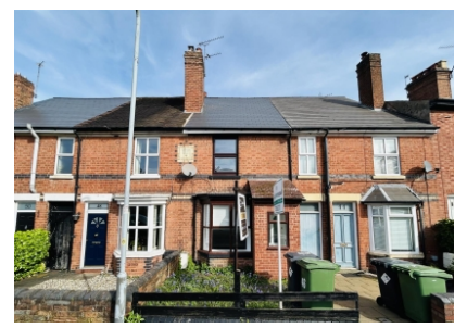
46 Regis Road, Tettenhall