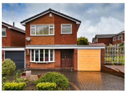
7 Marlborough Gardens, Newbridge, Wolverhampton