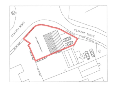
Land to the North of 15 Redford Drive, Albrighton