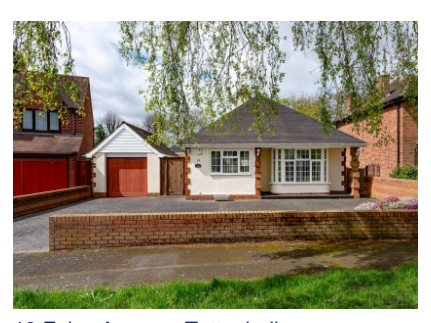
19 Foley Avenue, Tettenhall, Wolverhampton