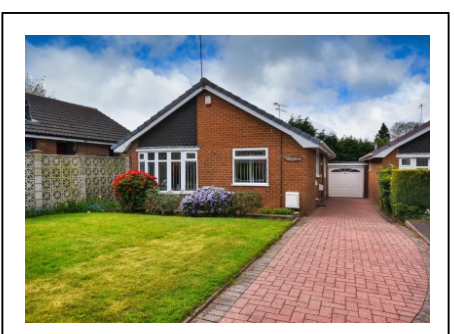
19 Finchdene Grove, Finchfield, Wolverhampton