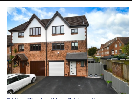
2 King Charles Way, Bridgnorth