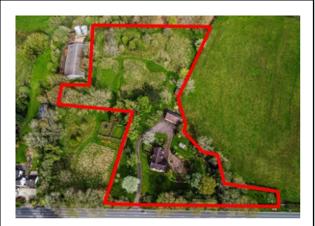
Dodds Green Cottage, 79 Dodds Green, Alveley, Bridgnorth