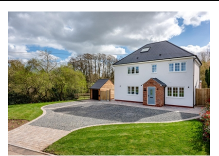
Holly Cottage, Wolverhampton Road, Pattingham