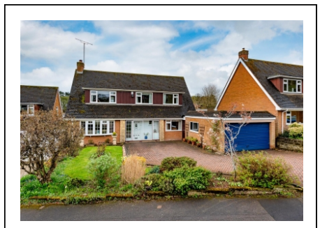
18 Quail Green, Wightwick, Wolverhampton