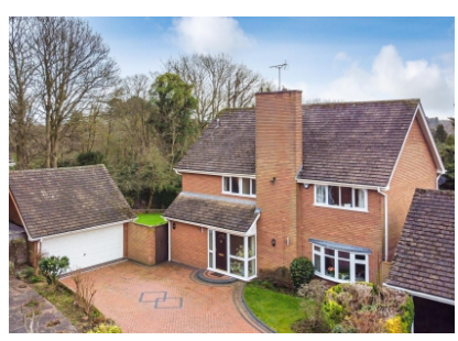
5 Mayswood Drive, Wightwick