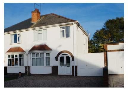
20 Regent Road, Penn