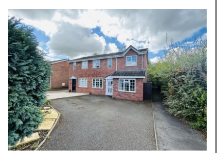
23 Cheriton Grove, Perton