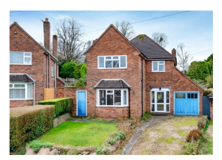
14 Peterdale Drive, Wolverhampton