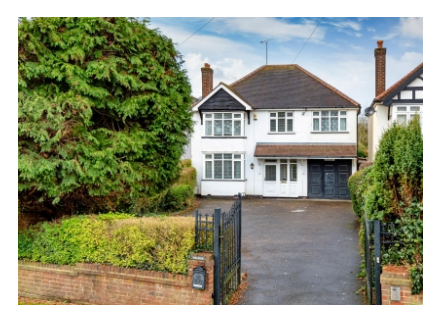
Maleesh, Stourbridge Road, Wombourne