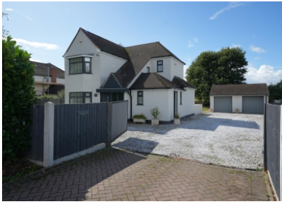
School House, Gospel Ash Road, Bobbington, Stourbridge