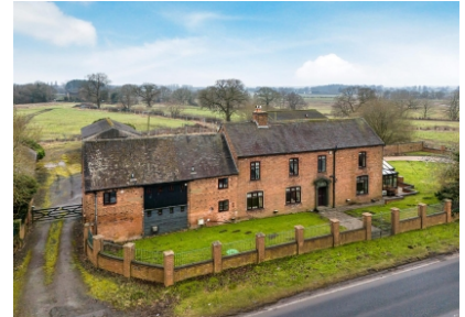
Hammerton House, Watling Street, Gailey, ST19 5PR