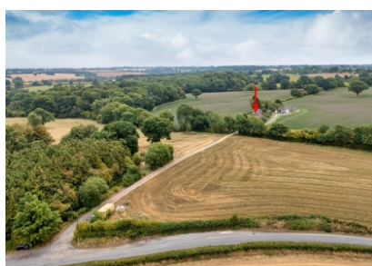
1 Netchwood Manor Cottage, Monkhopton, Bridgnorth