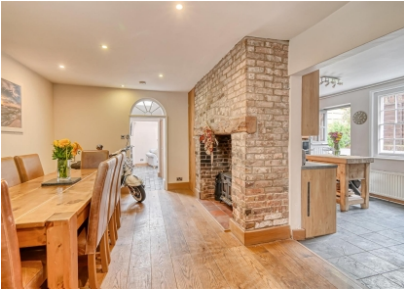
45 Hospital Street, Bridgnorth