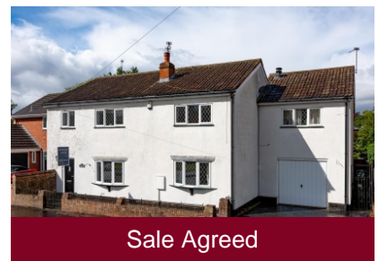
109 Rookery Road, Wombourne, Wolverhampton