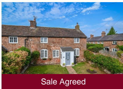
59 Alveley, Bridgnorth