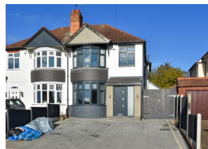
19 Blackburn Avenue, Claregate, Wolverhampton