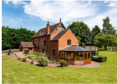
Lizard Mill, Lizard Lane, Tong, Shifnal, TF11 8QE