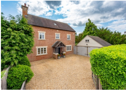
Orchard House, 6 Engleton Lane, Brewood, ST19 9DZ