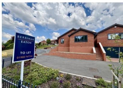
29 Auckland Road, Kingswinford