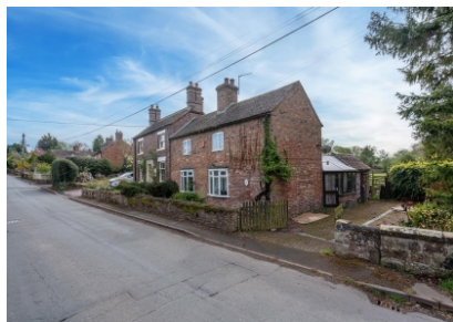
Brookside Cottage, 5 Tong Norton, Shifnal, TF11 8PZ