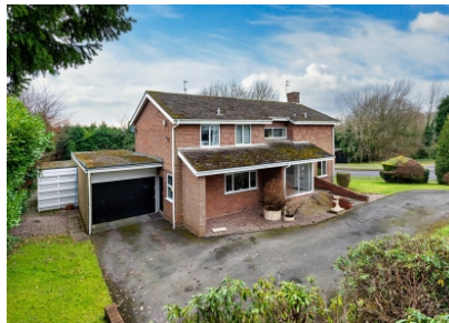
Coppins, Greenleighs, Dudley