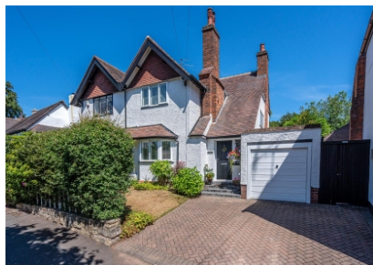
1 Woodlands Cottages, Penn Road, Wolverhampton