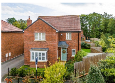
30 Anvil Close, Albrighton, Wolverhampton, WV7 3JP