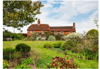
Upper Lea, Wall Hill, Claverley, Bridgnorth, WV15 5PW