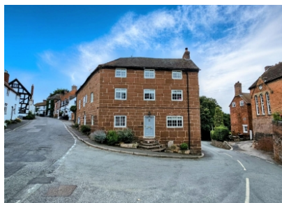
Church House, High Street, Claverley, Wolverhampton