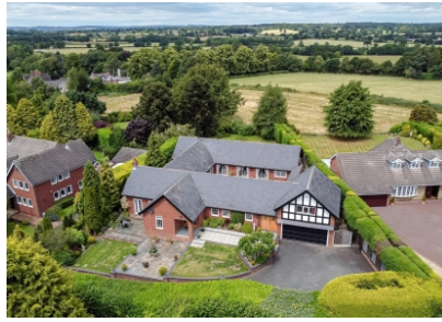
Courtenys, Oaken Drive, Oaken, Codsall