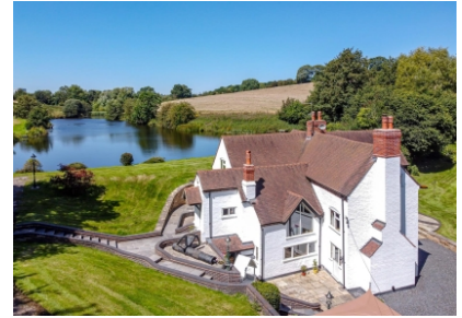
Hem Mill, The Hem, Shifnal