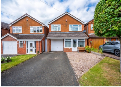
5 Banbery Drive, Wombourne, Wolverhampton