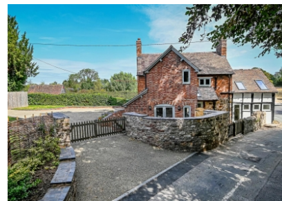
1 Shrewsbury Road, Cressage, Shrewsbury