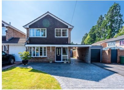
2 Aldwyck Drive, Castlecroft, Wolverhampton, WV3 8NE