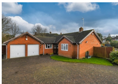
17a Chapel Lane, Codsall, Wolverhampton, WV8 2EJ