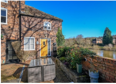
Sandward Cottage, 47a Cartway, Bridgnorth