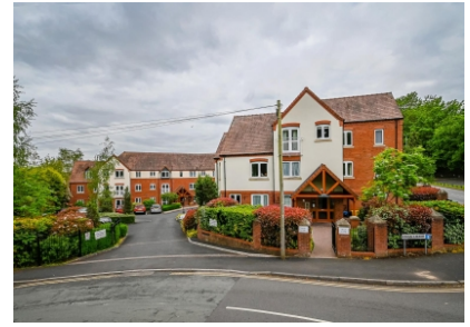
24 Farthings Court, Kings Loade, Bridgnorth