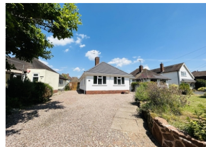
41 Elm Road, Albrighton