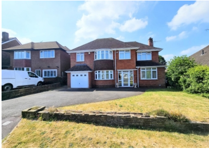
35 Sabrina Road, Wightwick