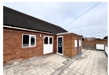
6a Bradford Street, Shifnal