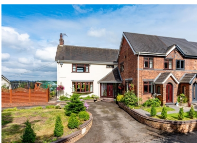
Woodbank Cottage, Hilton Lane, Shareshill, Wolverhampton, , WV10 7HU