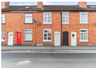
47 Severn Street, Bridgnorth