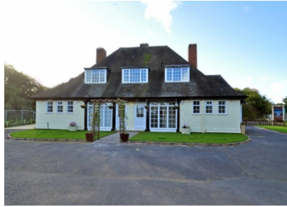
1 Seven Stars, Seisdon, Wolverhampton