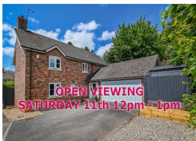
Beeches Hollow, 7a Stratford Lane, Hilton, Bridgnorth