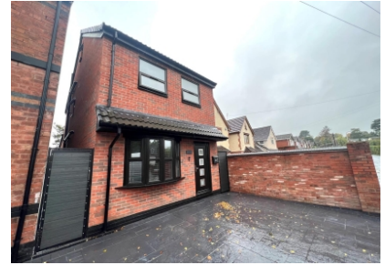
Sandy Lane, Tettenhall, Wolverhampton