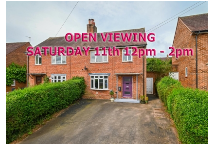
23 Beech Road, Bridgnorth