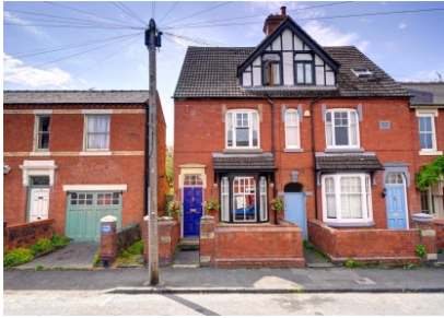
Western Road, Stourbridge