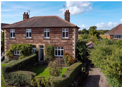
33 Horsebrook Lane, Brewwood, Stafford