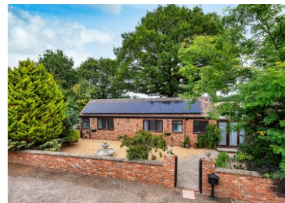
Meadow Cottage, Marsh Lane, Sheriffhales, Shifnal