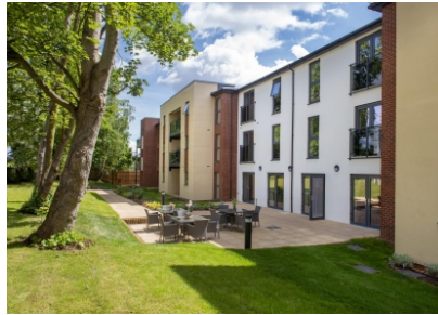
51 Thornycroft, Wood Road, Wolverhampton