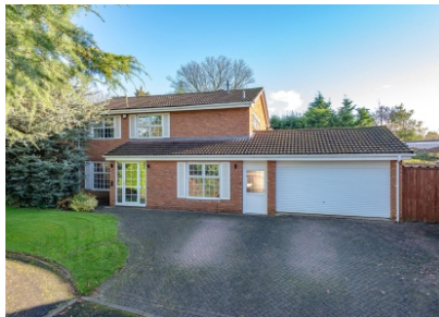
6 Redmoor Gardens, Wolverhampton