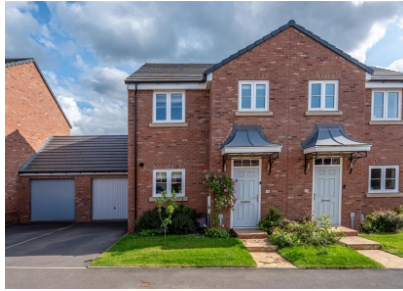
6 Crossfield Crescent, Albrighton, Wolverhampton, WV7 3NX