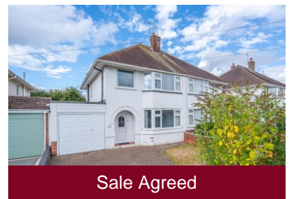
89 Station Road, Albrighton, Wolverhampton, WV7 3DP