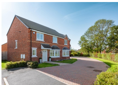
25 Cornflower Meadow, Coven, Wolverhampton, WV9 5FB