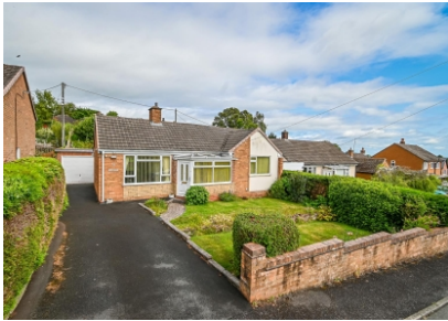
Fermain, 40 Ludlow Road, Bridgnorth