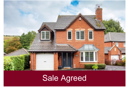
1 Brook Hollow, Bridgnorth