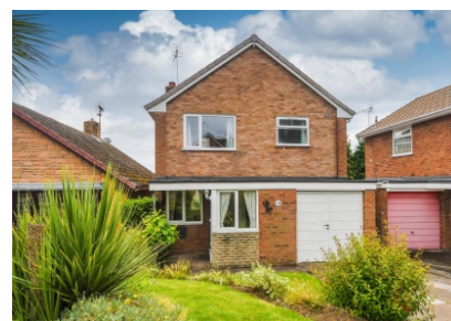
16 Woodlands Road, Wombourne, Wolverhampton