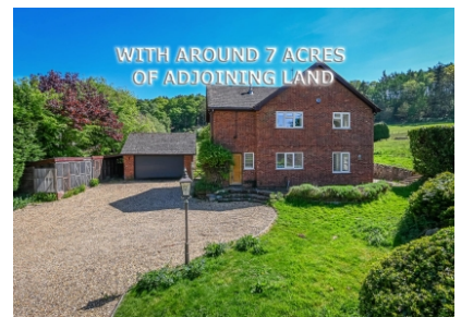
Quatford Grange, Sandyburn Lane, Quatford, Bridgnorth