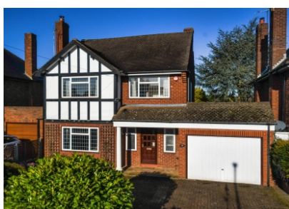
10 Farm Road, Finchfield, Wolverhampton, WV3 8EW