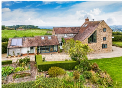
Wyres Barn, Kenley, Shrewsbury