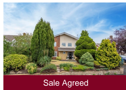
Alpine Lodge, 15 Old Weston Road, Bishops Wood, Stafford, ST19 9AG