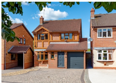
49 Penleigh Gardens, Wombourne, Wolverhampton