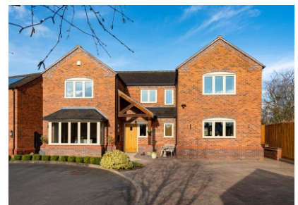
32 Post Office Road, Seisdon, Wolverhampton