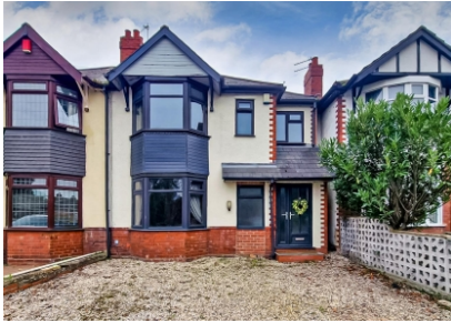
7 Duck Lane, Codsall, Wolverhampton, WV8 1HZ