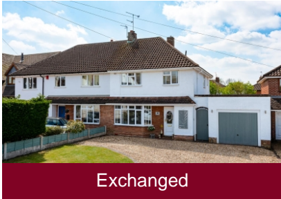
24 Queens Gardens, Codsall, Wolverhampton, WV8 2EP