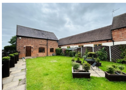
The Annexe, Hollies Lane, Pattingham