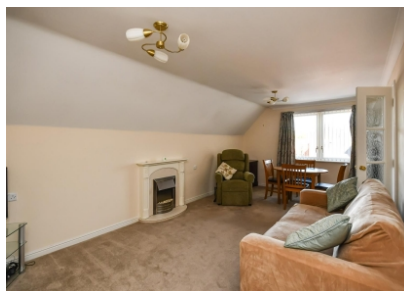
42 Wombrook Court, Wombourne, Wolverhampton