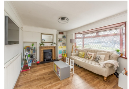
63 Meadow Lane, Wombourne, Wolverhampton