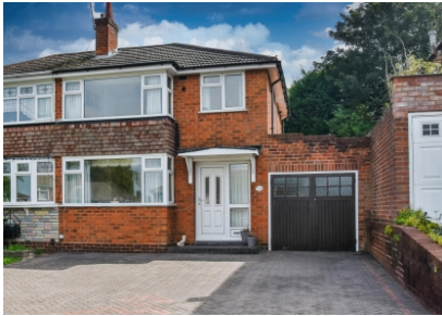
10 Waverley Crescent, Lanesfield, Wolverhampton