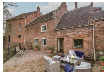
The Malthouse, Four Ashes Hall, Bridgnorth Road