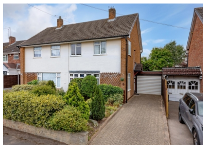
21 Langley Gardens, Wolverhampton