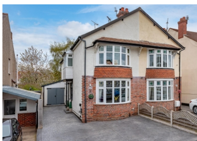
36 Pennhouse Avenue, Wolverhampton