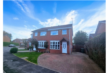
43 Stephenson Drive, Perton