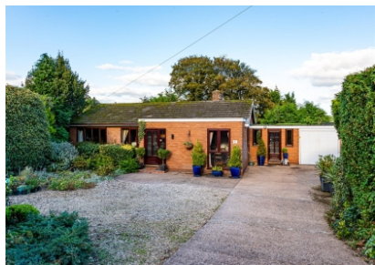
1 Golden Acres, Alveley, Bridgnorth