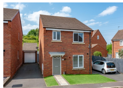
7 Taper Close, Kingswinford