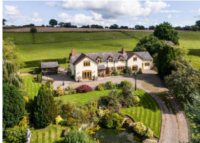
The Dairy Farm, Neenton, Bridgnorth