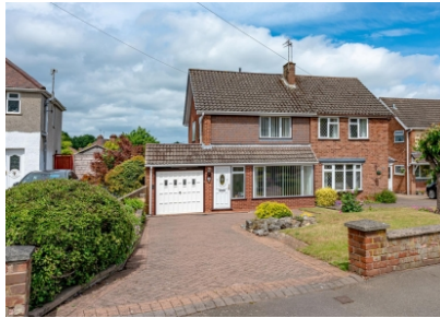
49 Common Road, Wombourne, Wolverhampton