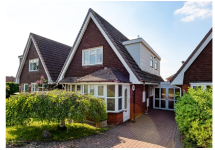
Chestnut Drive, Wombourne, Wolverhampton