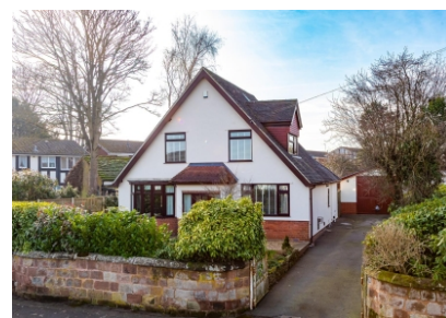
75 Birches Road, Codsall, Wolverhampton, WV8 2JJ