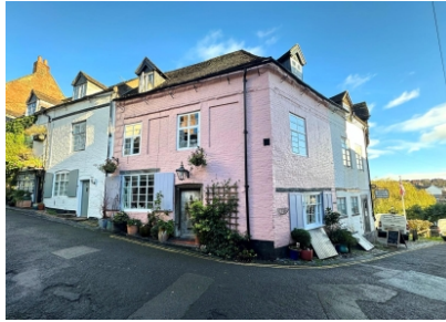
54 Cartway, Bridgnorth