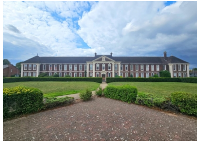
Lowbridge Walk, Bilston