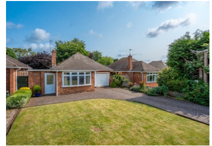
42 Tynninghame Avenue, Tettenhall, Wolverhampton, WV6 9PP