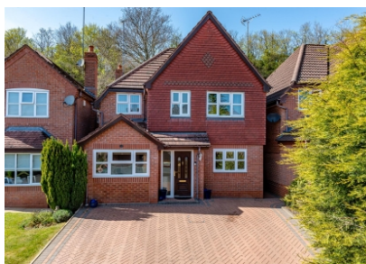
35 Hellier Drive, Wombourne, Wolverhampton