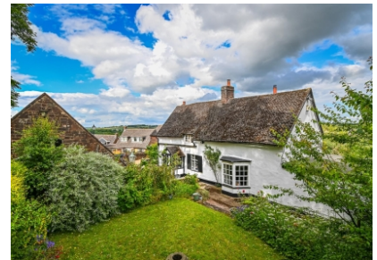
The Old Bell House, Alveley, Bridgnorth