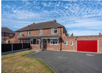
8 Kinfare Drive, Tettenhall Wood, Wolverhampton, WV6 8JW