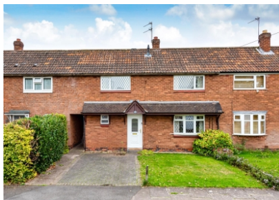
18 Cornwall Road, Tettenhall Wood, Wolverhampton, WV6 8XB