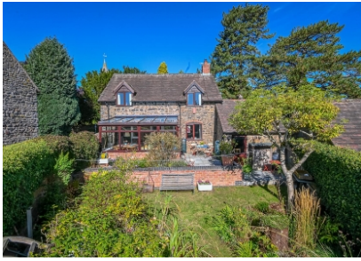
6 St. Johns Court, Ditton Priors, Bridgnorth