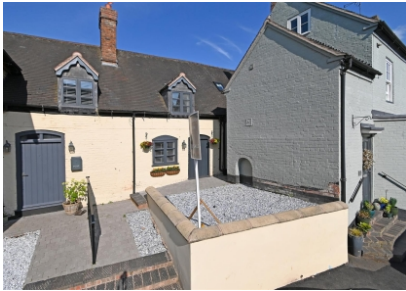
6 Bull Ring, Claverley, Wolverhampton