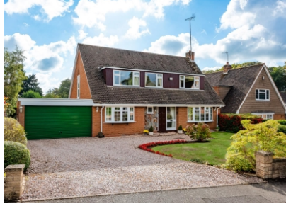
27 Quail Green, Wightwick, Wolverhampton, WV6 8DF