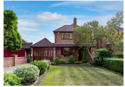
32 Billy Buns Lane, Wombourne, Wolverhampton