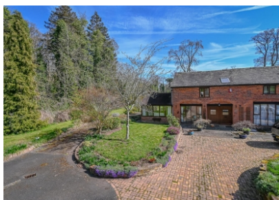
The Mill, Gatacre, Claverley