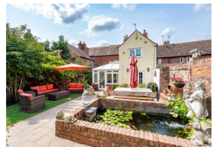
Cross Keys House, 62 Broadway, Shifnal, TF11 8AZ