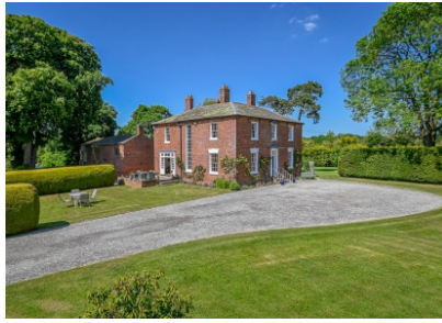
Manor House, Hughley, Shrewsbury