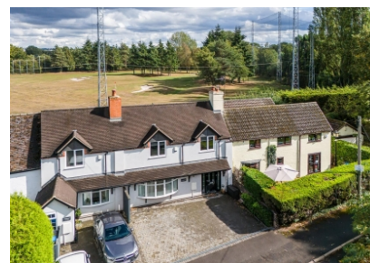
Three Hammers Farmhouse, Old Stafford Road, Cross Green Coven, Wolverhampton, WV10 7PP