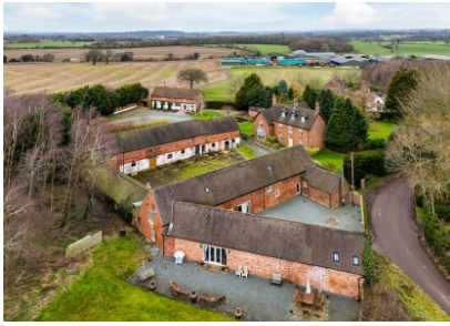
The Stockton House Estate, Newport, TF10 9BA