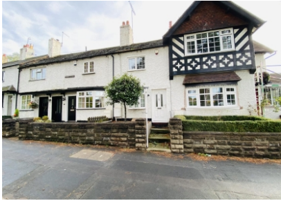
6 Codsall Road, Tettenhall