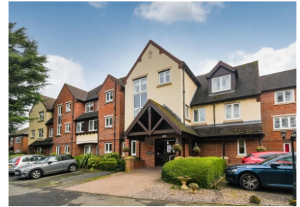
Flat 8, Pendene Court, Penn Road, Wolverhampton