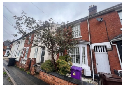
31 Nursery Walk, Tettenhall