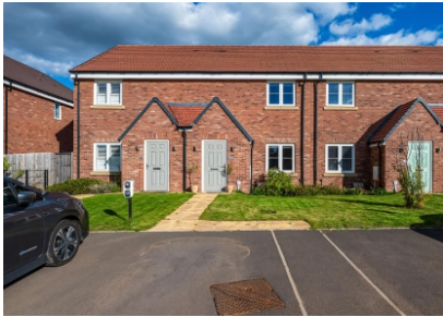
20 Millfield Road, Albrighton, Wolverhampton, WV7 3JN