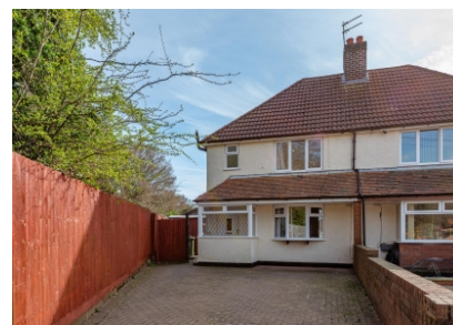
36 Park Avenue, Wombourne, Wolverhampton