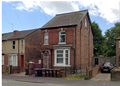
248 Wellington Road, Bilston, WV14 6RL