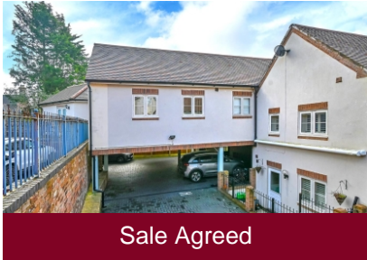
51 Whitburn Street, Bridgnorth