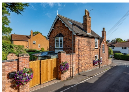
Cedar Cottage, 31 The Avenue, Penn, Wolverhampton