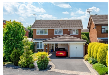
6 Millfields Way, Wombourne, Wolverhampton