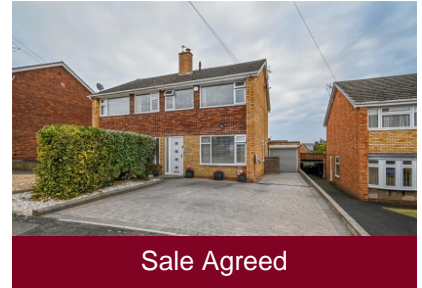
42 Duchess Drive, Bridgnorth