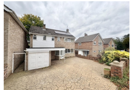
10 Marlbrook Drive, Wolverhampton