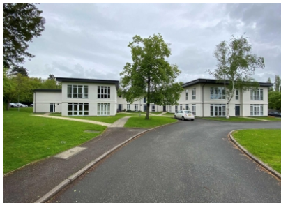
14 Danescourt Manor, Tettenhall