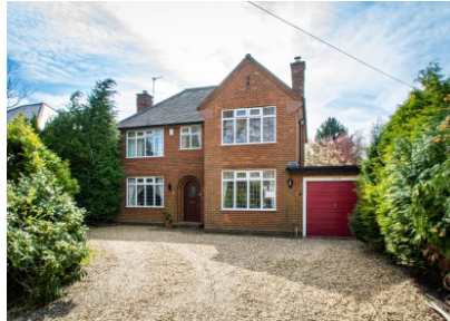
115 Wrottesley Road West, Tettenhall, Wolverhampton, WV6 8UP