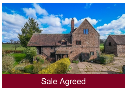
Moor House Farm, Alveley