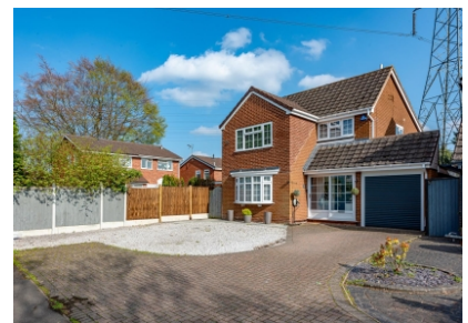
18 Brindley Close, Wombourne, Wolverhampton