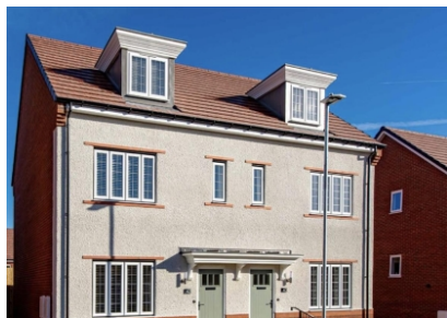
40 Foxglove Way, Himley, Dudley, West Midlands