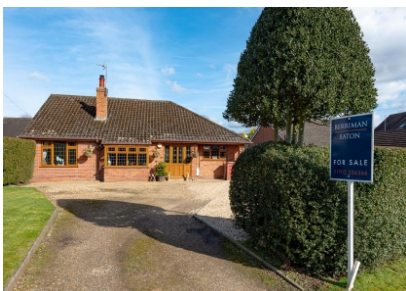
6 Bridgnorth Road, Himley, Dudley