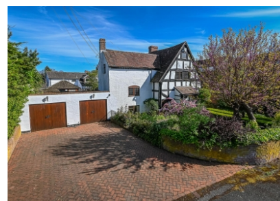
The Old Malthouse, Hilton, Bridgnorth