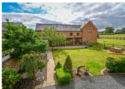
The Driftway, Ashfield Farm, Ditton Priors, Bridgnorth