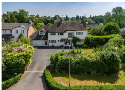
Perton Springs, 25 Perton Road, Wightwick, Wolverhampton, WV6 8DN