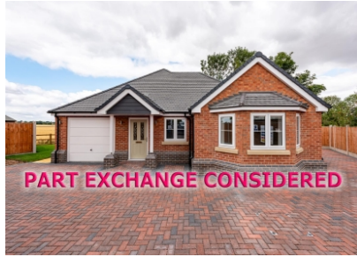
Bluebells, 6a School Close, Trysull, Wolverhampton