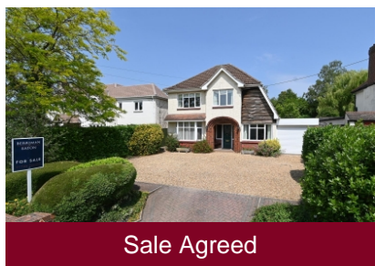
The Rest, Wenlock Road, Bridgnorth