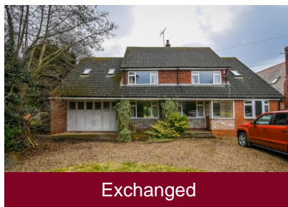
Chy An Venton, Claverley, Wolverhampton