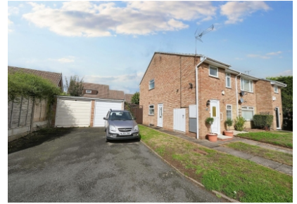
33 Grant Close, Charterfields, Kingswinford