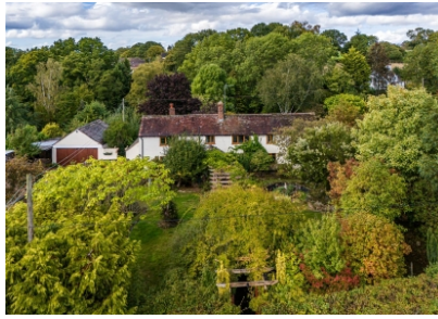
The Paddocks, The Common, Chelmarsh, Bridgnorth