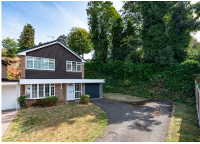
39 Alpine Way, Compton, Wolverhampton