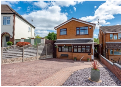
51 Sedgley Road, Wolverhampton