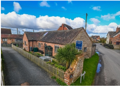
The Barn, Manor Farm, Stottesdon, Kidderminster