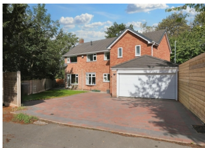
143 Goldthorn Hill, Wolverhampton