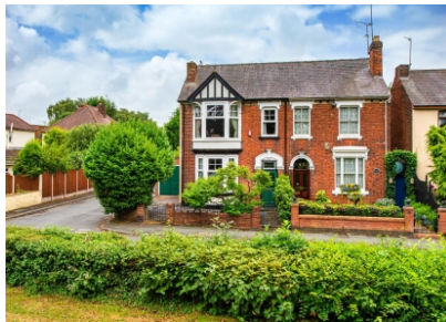
41 Broad Lane, Finchfield, Wolverhampton, WV3 9BW