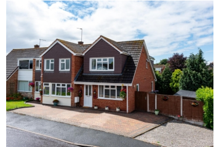
8 Barrington Close, Albrighton, Wolverhampton, WV7 3PJ