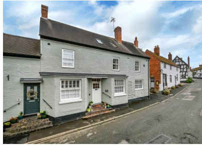
Bull Ring, Claverley, Wolverhampton