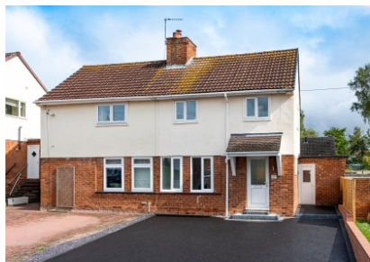
17 Oak Road, Brewood, Stafford, ST19 9HH