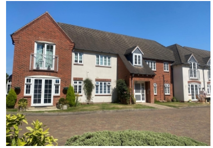
6 Montgomery House, Old Stafford Road, Cross Green, Wolverhampton