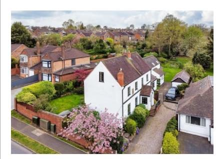
The Crofts and The Cottage, 32 Church Hill, Penn