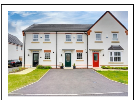
9 Narburgh Place, Alveley, Bridgnorth