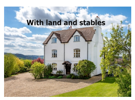
Ouseley Farm, Aston Eyre, Bridgnorth