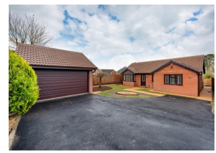
3 Montford Grove, Sedgley, Dudley