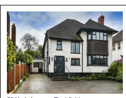
59 York Avenue, Finchfield