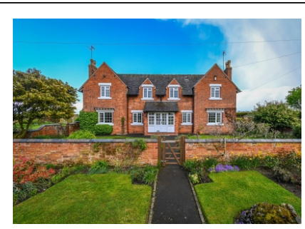
Lower Snowdon Cottage, Snowdon Road, Burnhill Green, Wolverhampton