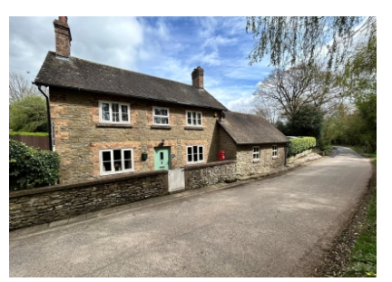
Brookside, Brockton, Much Wenlock