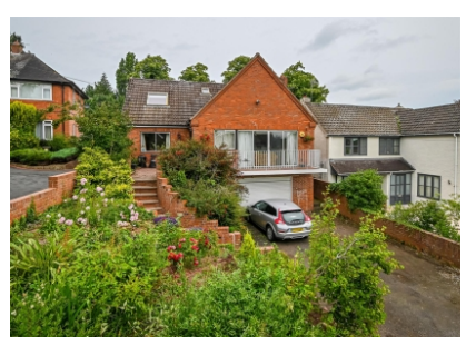
The Tyning, Westgate Drive, Bridgnorth