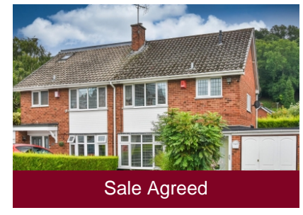
23 Chequers Avenue, Wombourne, Wolverhampton