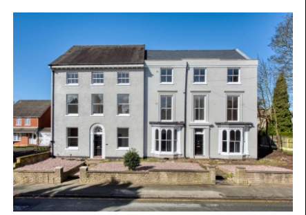
Flat 3, 228 Penn Road, Wolverhampton