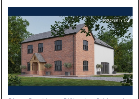
Plot 1, Bynd Lane, Billingsley, Bridgnorth