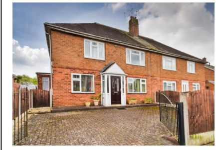
Dickinson Road, Wombourne, Wolverhampton