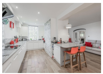
4 Stanmore Mews, Stourbridge Road, Stanmore, Bridgnorth