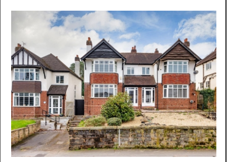
83 Lower Street, Wolverhampton