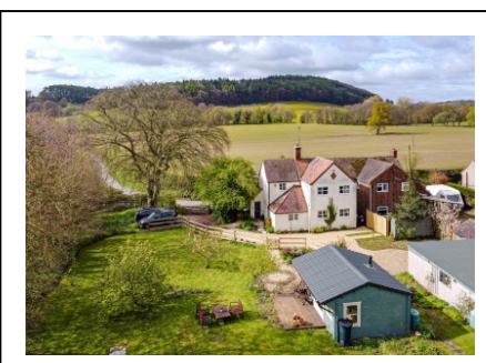
6 The Row, Easthope, Much Wenlock