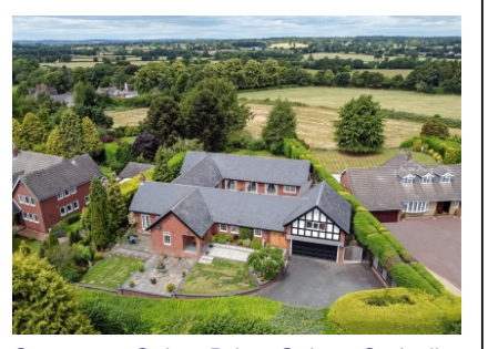
Courtneys, Oaken Drive, Oaken, Codsall