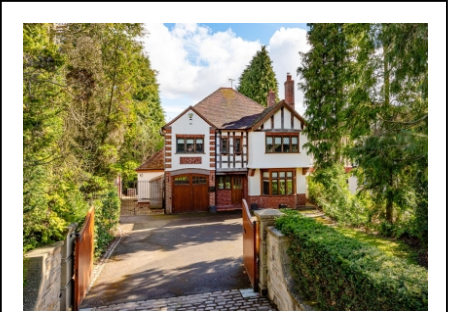
Dalkeith, 25 Tinacre Hill, Wightwick, WV6 8DB