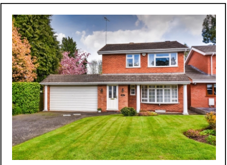
18 Fair Oak Drive, Wolverhampton