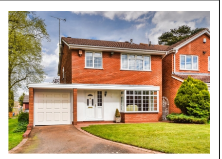
1 Foxlands Drive, Wolverhampton