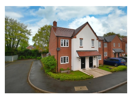
19 Staley Grove, Highley, Bridgnorth