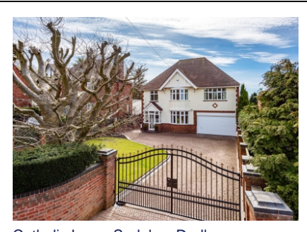
Catholic Lane, Sedgley, Dudley