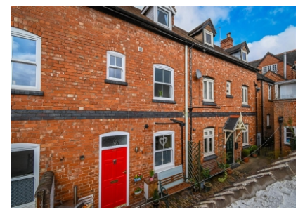
22a High Street, Bridgnorth