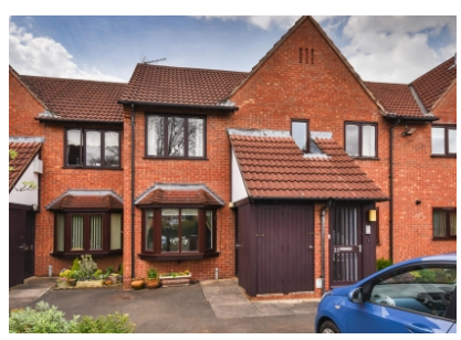
24 Hanover Court, Tettenhall, Wolverhampton