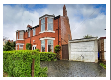
26 Marchant Road, Compton, WV3 9QG