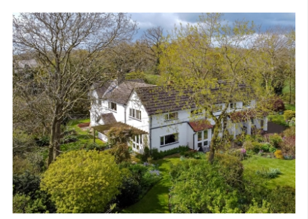
Leafields Farm, Shutt Green, Brewood, ST19 9I X