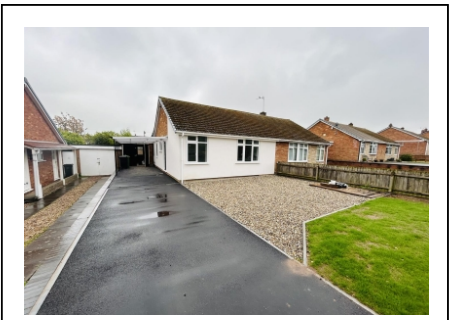
32 Four Ashes Road, Brewood