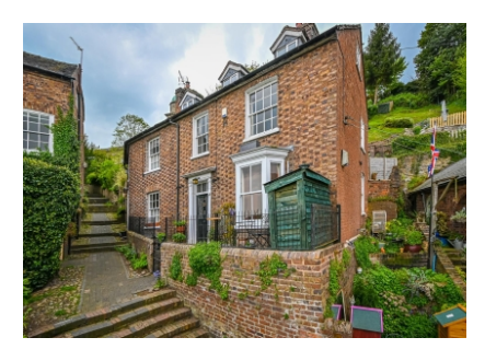
19 St. Marys Steps, Bridgnorth