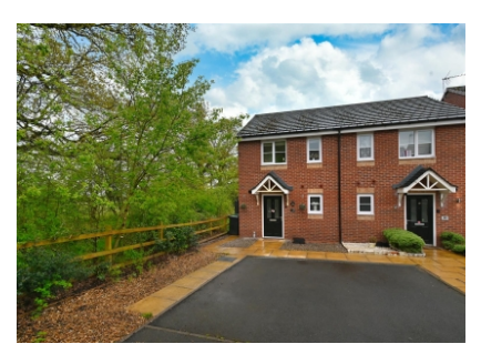
29 Hitchens Way, Highley, Bridgnorth