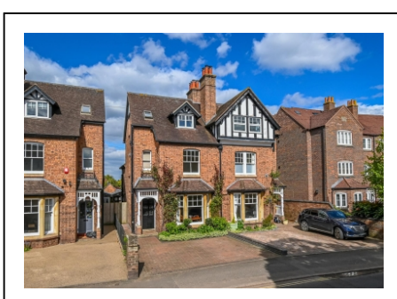
2 Westgate Villas, Salop Street, Bridgnorth