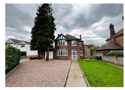
114 Amos Lane, Wolverhampton