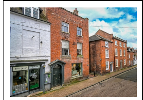
64 St. Marys Street, Bridgnorth