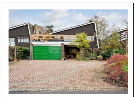
18 Perton Brook Vale, Wightwick