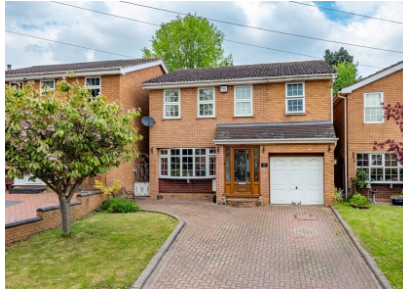
The Holloway, Swindon, Dudley