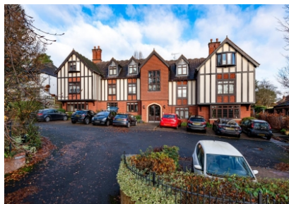
Apartment 3 Stockwell, Malthouse Lane, Tettenhall, Wolverhampton