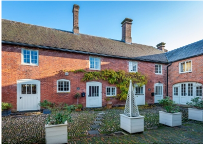
The Ostlers, 3 Patshull Hall Mews, Burnhill Green