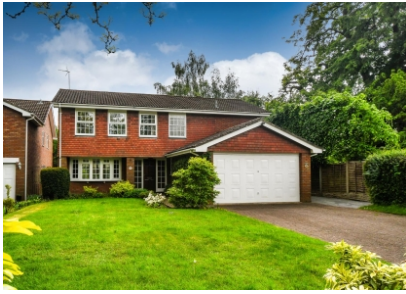
Ash Hill, Wolverhampton