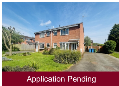
5 Coulter Grove, Perton