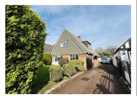
62 Mount Road, Tettenhall