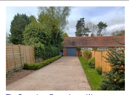
The Bungalow, Popes Lane, Wergs , Tettenhall