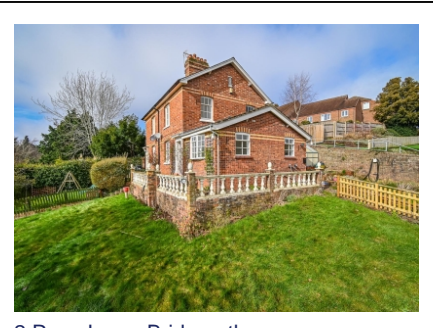
2 Rose Lane, Bridgnorth