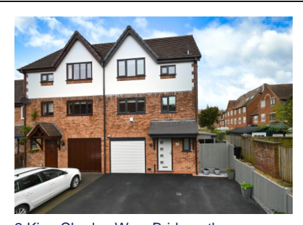
2 King Charles Way, Bridgnorth