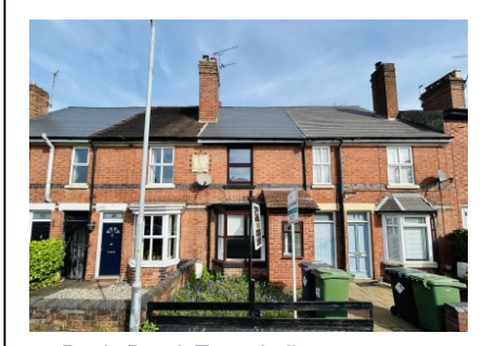
46 Regis Road, Tettenhall