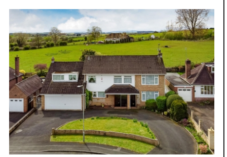
7 Wightwick Hall Road, Wightwick