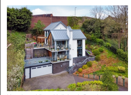
Hawthorn View, Hollybush Road, Bridgnorth