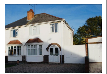
20 Regent Road, Penn