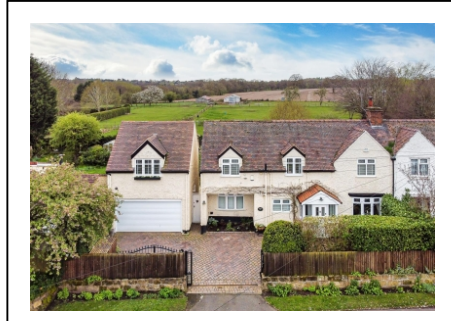
15 Birches Road, Codsall, Wolverhampton