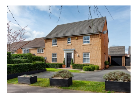
12 Larch Grove, Shifnal