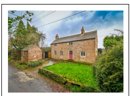
148 Broad Oak, Six Ashes