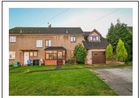
74 The Hobbins, Bridgnorth