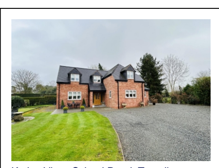
Ketley View, School Road, Trysull