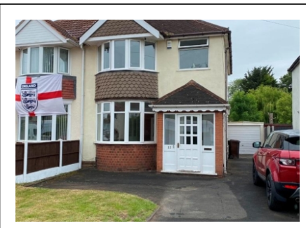
25 Elm Avenue, Wolverhampton, WV11