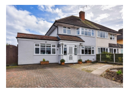
34 Delaware Avenue, Albrighton