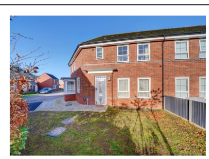
26 Rainsford Crescent, Kidderminster