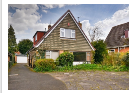
68 Mount Road, Tettenhall Wood, Wolverhampton