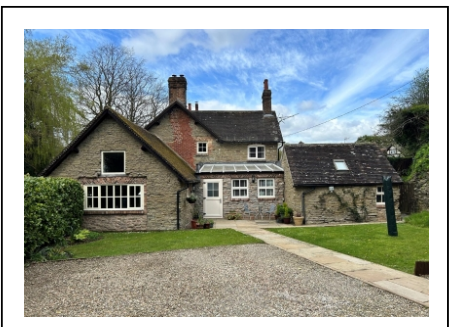
Brookside, Brockton, Much Wenlock