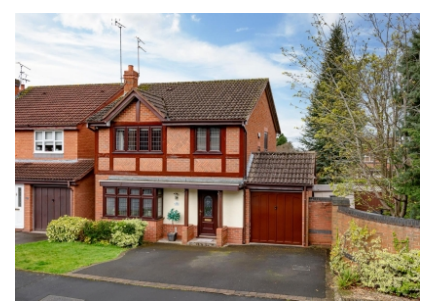
19 Penleigh Gardens, Wombourne, Wolverhampton