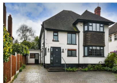
59 York Avenue, Finchfield