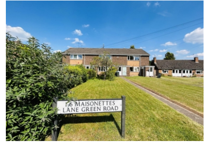
4 The Maisonnets, Lane Green Road, Codsall