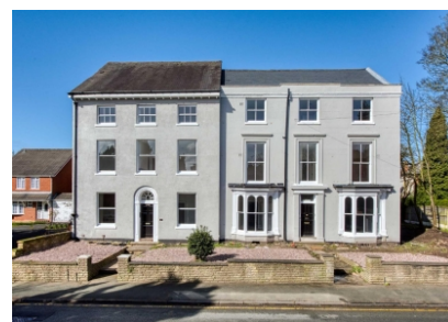
Flat 3, 228 Penn Road, Wolverhampton