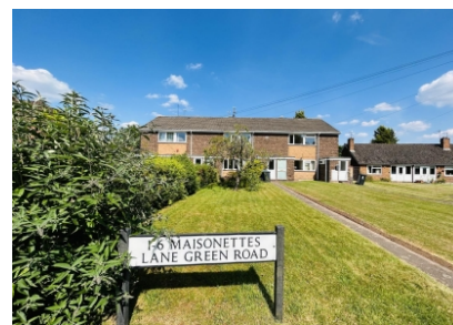
4 The Maisonnets, Lane Green Road, Codsall