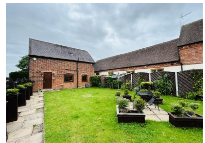
The Annexe, Hollies Lane, Pittingham