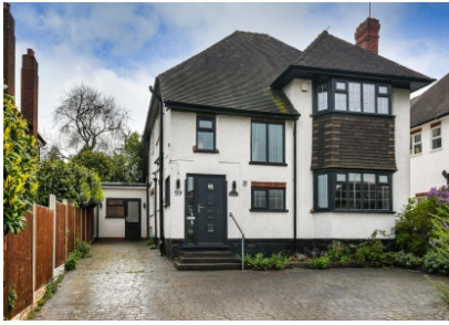
59 York Avenue, Finchfield