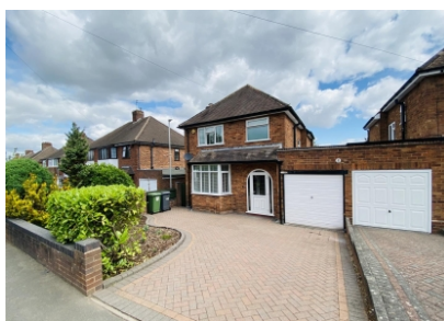
23 Brenton Road, Penn, Wolverhampton