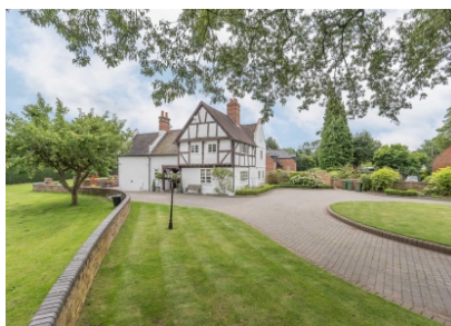
Ketley House, School Road, Trysull