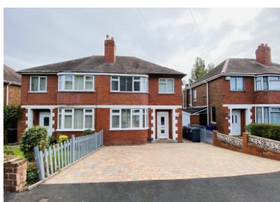
392 Wolverhampton Road East, Sedgley