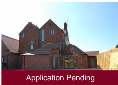
Halfpenny Green, Bobbington, Stourbridge