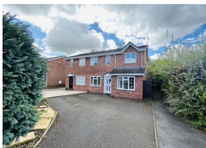
23 Cheriton Grove, Perton