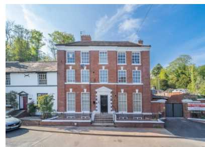
4, Rock House, Old Hill, Wolverhampton