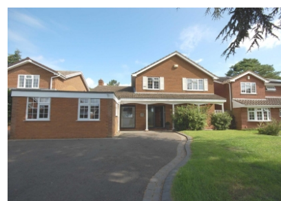
18 Saxon Court, Tettenhall