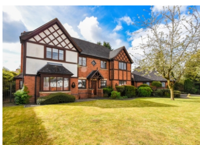
Keepers Lodge, Popes Lane, Tettenhall