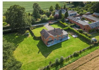
Oaklands Farm, Lower Rudge, Pittingham