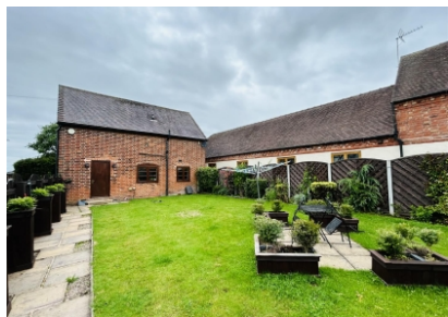
The Annexe, Hollies Lane, Pattingham