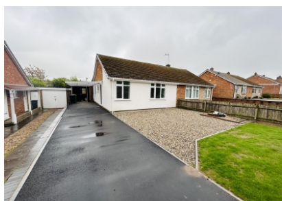
32 Four Ashes Road, Brewood