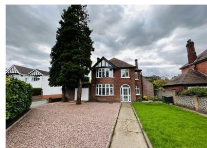
114 Amos Lane, Wolverhampton