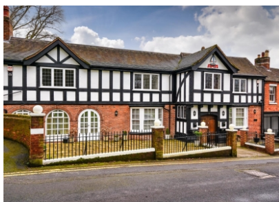
5c The Mitre, Lower Green, Tettenhall