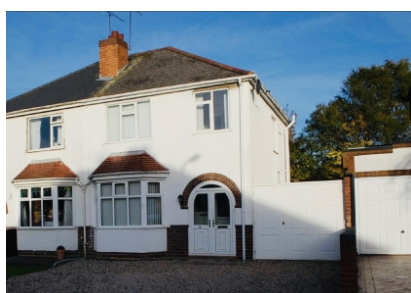
20 Regent Road, Penn