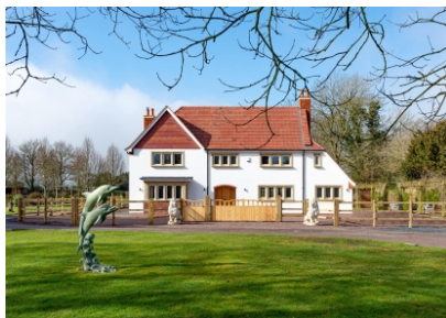
Kelmscott House, School Road, Trysull