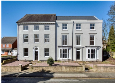
Flat 3, 228 Penn Road, Wolverhampton