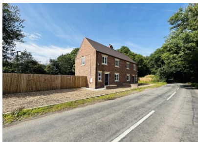
1 Lower Avenue Cottage, Coven