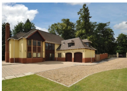
The New House, Tinacre Hill, Wightwick