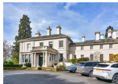
5 Old Hall, Wergs Hall, Wolverhampton