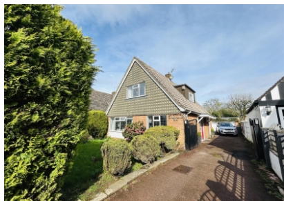
62 Mount Road, Tettenhall