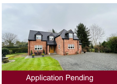
Ketley View, School Road, Trysull