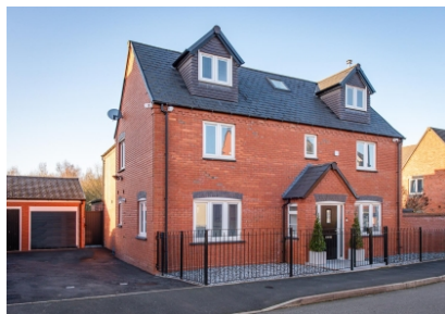
37 Deacons Field, Brewwood, Stafford