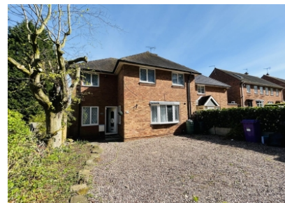
226 Castlecroft Road, Castlecroft