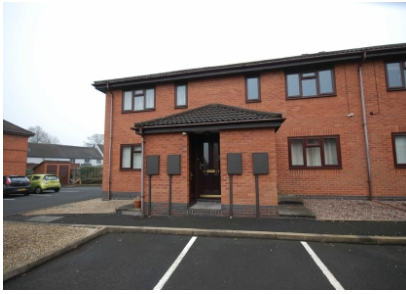
12 Bilbrook Court, Bilbrook Road, Codsall, WolverhamptonSouth Staffordshire