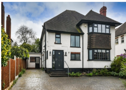
59 York Avenue, Finchfield