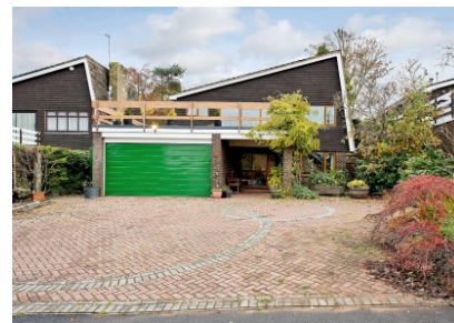
18 Perton Brook Vale, Wightwick