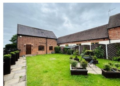
The Annexe, Hollies Lane, Pittingham