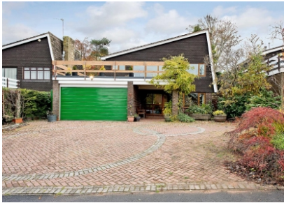
18 Perton Brook Vale, Wightwick