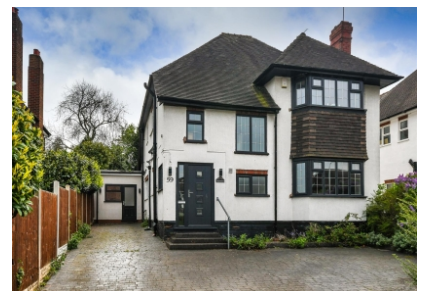
59 York Avenue, Finchfield