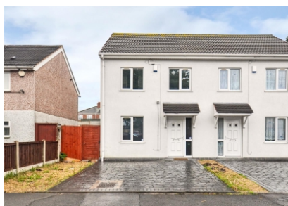
6 Wessex Road, Parkfields, Wolverhampton