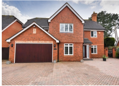
17 Saxonfields, Tettenhall