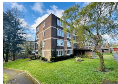
41 Upper Street, Tettenhall