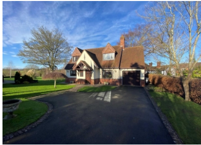
Orchard Cottage, High Street, Claverley