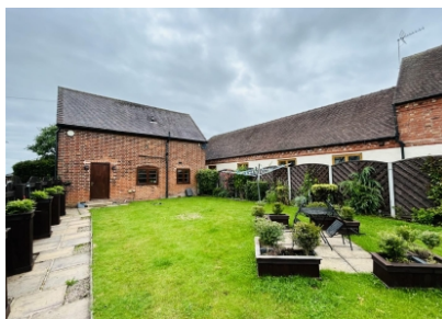
The Annexe, Hollies Lane, Pattingham