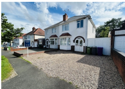
20 Regent Road, Penn