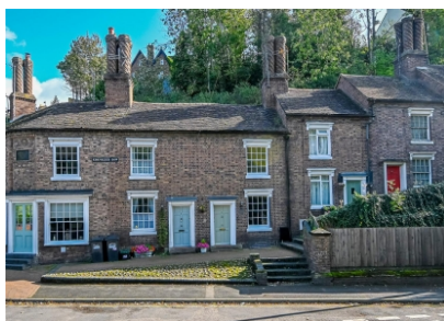
8 Ebenezer Row, Bridgnorth