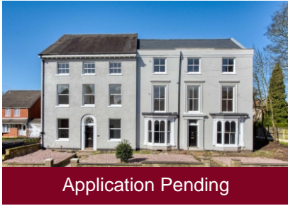
Flat 3, 228 Penn Road, Wolverhampton