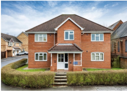
124a Common Road, Wombourne