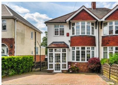
14 Links Road, Penn