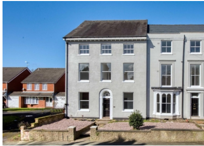
Havana House Flat 1, 228 Penn Road, Wolverhampton