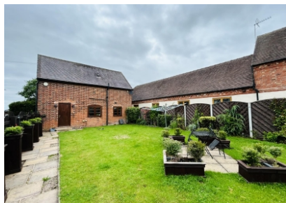
The Annexe, Hollies Lane, Pattingham