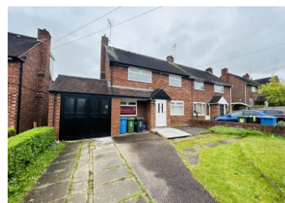
18 Bull Meadow Lane, Wombourne