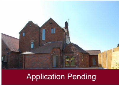
Halfpenny Green, Bobbington, Stourbridge