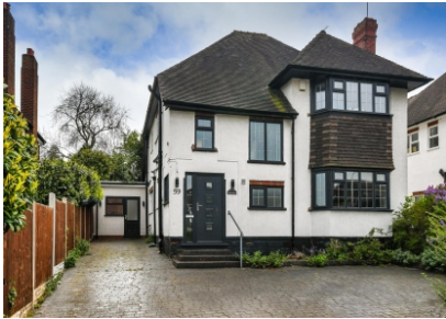
59 York Avenue, Finchfield