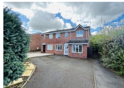
23 Cheriton Grove, Perton