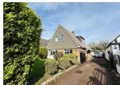
62 Mount Road, Tettenhall