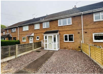
4 Dean Road, Wombourne