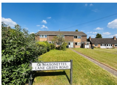
4 The Maisonnets, Lane Green Road, Codsall