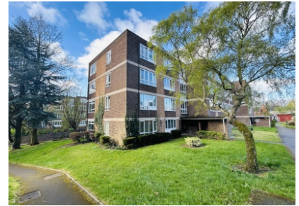
41 Upper Street, Tettenhall