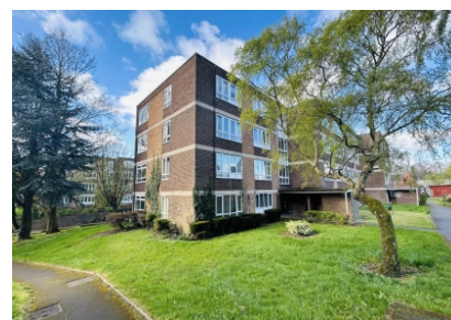
41 Upper Street, Tettenhall