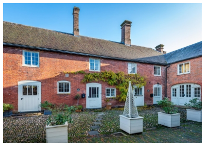
The Ostlers, 3 Patshull Hall Mews, Burnhill Green