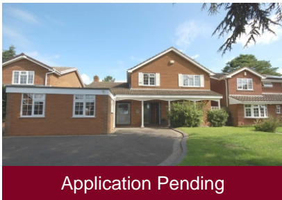
18 Saxon Court, Tettenhall