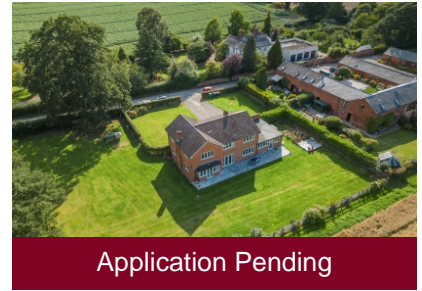
Oaklands Farm, Lower Rudge, Pittingham