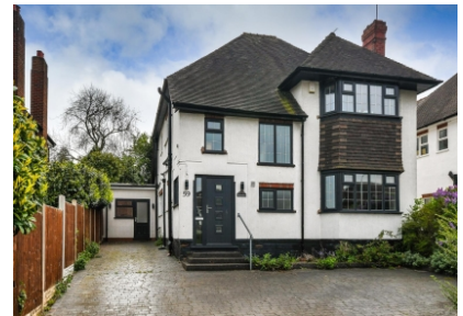
59 York Avenue, Finchfield