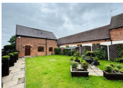
The Annexe, Hollies Lane, Pattingham