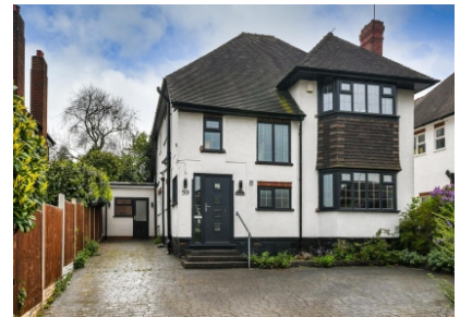
59 York Avenue, Finchfield