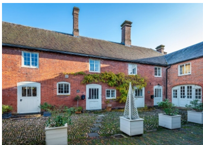
The Ostlers, 3 Patshull Hall Mews, Burnhill Green