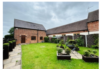
The Annexe, Hollies Lane, Pattingham