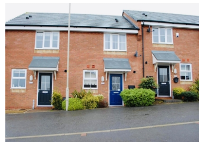
40 Haslingden Crescent, Dudley