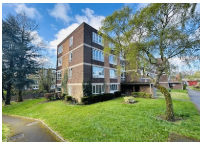
41 Upper Street, Tettenhall