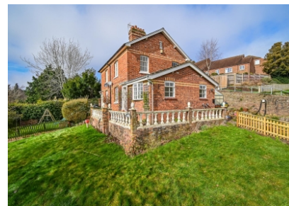
2 Rose Lane, Bridgnorth