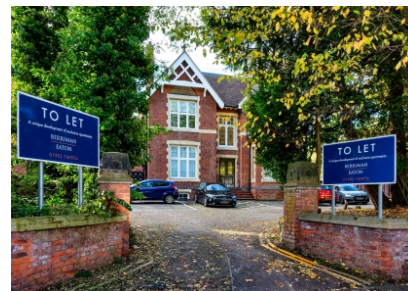
Apartment 3, Beacon House, 267 Tettenhall Road, Newbridge