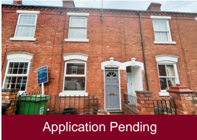
Wheeler Street, Stourbridge, Stourbridge