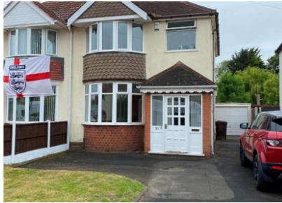
25 Elm Avenue, Wolverhampton, WV11 1DS