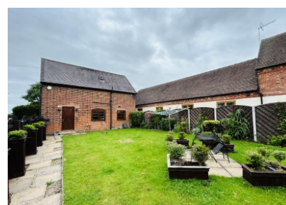
The Annexe, Hollies Lane, Pattingham