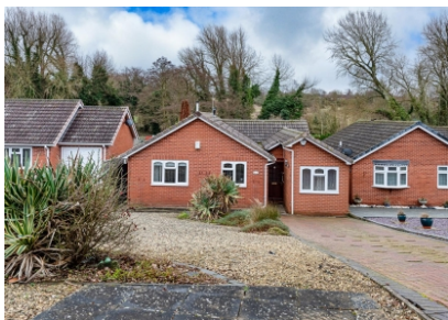
43 Bratch Lane, Wombourne