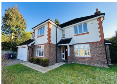
3 Hollycroft Gardens, Tettenhall