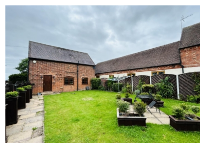
The Annexe, Hollies Lane, Pattingham