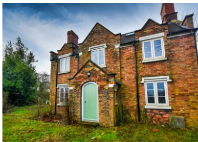
Reservoir Cottage, Shutt Green, Brewood, Stafford