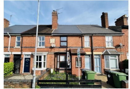
46 Regis Road, Tettenhall