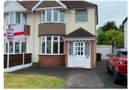
25 Elm Avenue, Wolverhampton, WV11 1DS