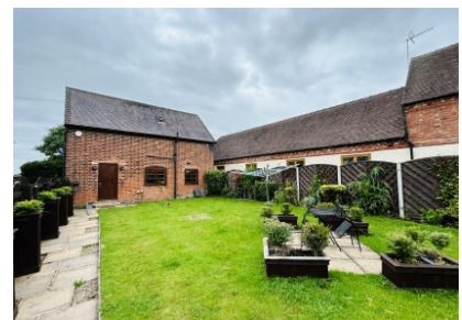
The Annexe, Hollies Lane, Pattingham