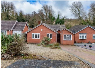
43 Bratch Lane, Wombourne