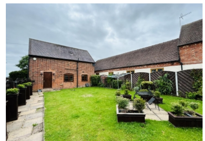
The Annexe, Hollies Lane, Pittingham