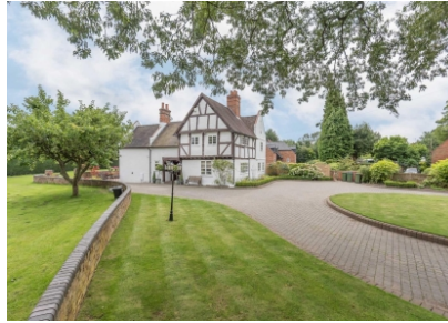
Ketley House, School Road, Trysull