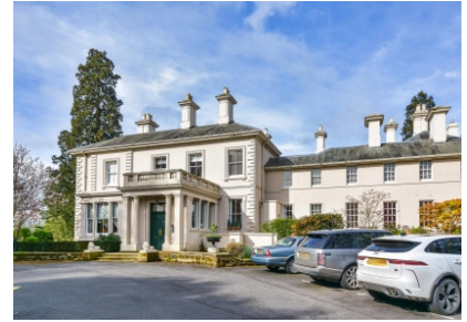
5 Old Hall, Wergs Hall, Wolverhampton