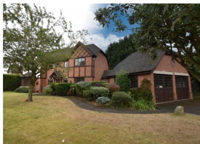
Keepers Lodge, Popes Lane, Tettenhall