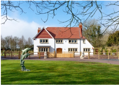
Kelmscott House, School Road, Trysull