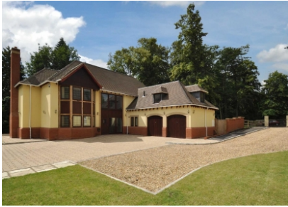
The New House, Tinacre Hill, Wightwick