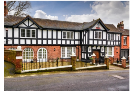
5c The Mitre, Lower Green, Tettenhall