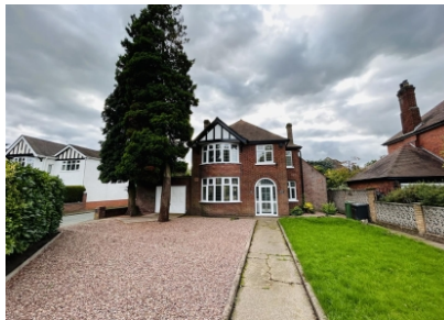
114 Amos Lane, Wolverhampton