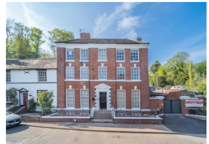
4, Rock House, Old Hill, Wolverhampton