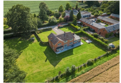
Oaklands Farm, Lower Rudge, Pittingham