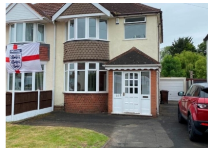
25 Elm Avenue, Wolverhampton, WV11 1DS