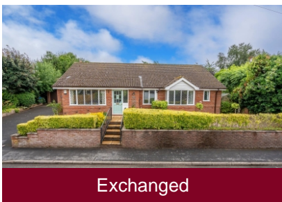
Rose Gate, Engleton Lane, Brewood, Stafford, ST19 9DZ