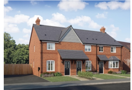
Plot 37 Derrington Meadows, Ditton Priors, Bridgnorth