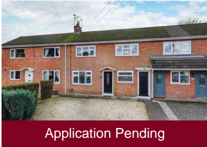
66 Dickinson Road, Wombourne