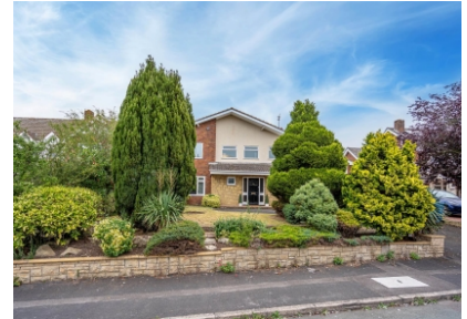
Alpine Lodge, 15 Old Weston Road, Bishops Wood, Stafford, ST19 9AG