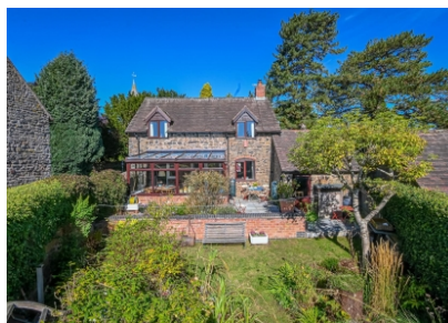
6 St. Johns Court, Ditton Priors, Bridgnorth