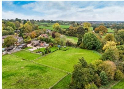
Reaside, Neenton, Bridgnorth