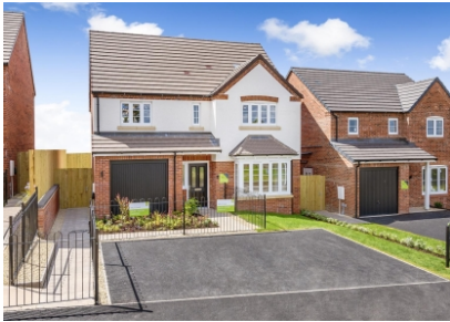
Plot 24 Derrington Meadows, Ditton Priors, Bridgnorth