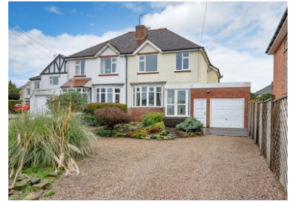
Station Road, Wombourne, Wolverhampton