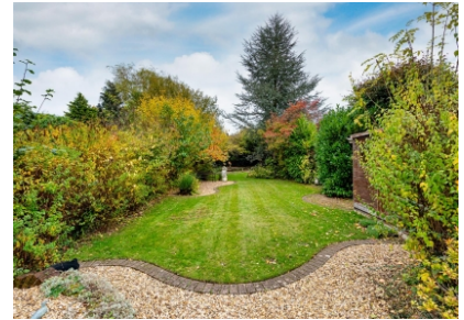
77 Woodland Road, Finchfield, Wolverhampton, WV3 8AP