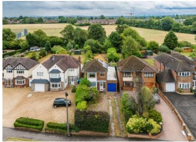
26 Elliotts Lane, Codsall, Wolverhampton, WV8 1PG