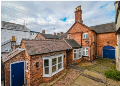
62a Whitburn Street, Bridgnorth