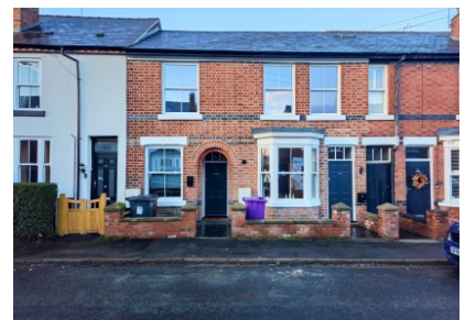
44a Limes Road, Tettenhall