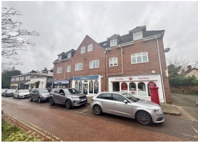
9 Kenmare House, Station Road, Codsall