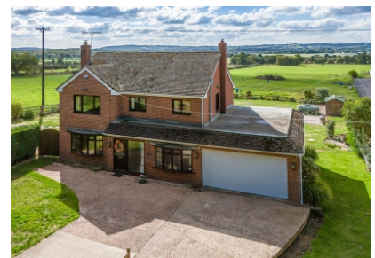
Forest Hills, New Road, Swindon, Dudley