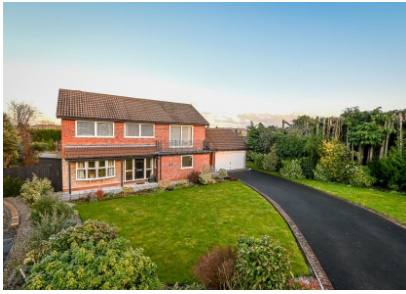
7 Huntsmans Close, Bridgnorth