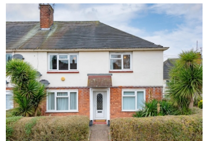
11 Lamb Crescent, Wombourne