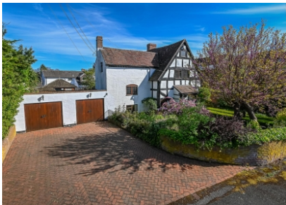
The Old Malthouse, Hilton, Bridgnorth