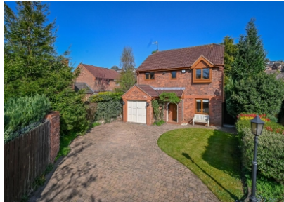
4 Washbrook Road, Bridgnorth,