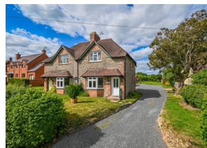
Birdwood, Easthope, Much Wenlock