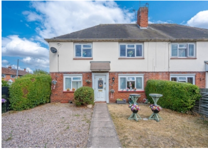
Giggetty Lane, Wombourne, Wolverhampton