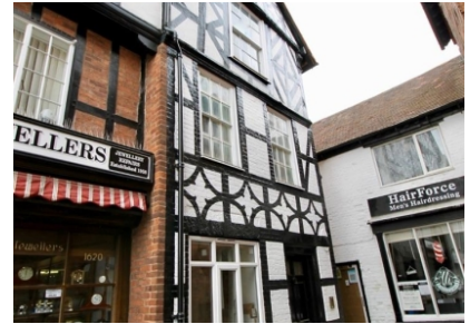
Flat 3, 3 High Street, Bridgnorth, WV16 4DB