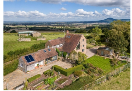
Wyres Barn, Kenley, Shrewsbury