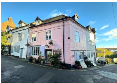
54 Cartway, Bridgnorth