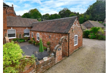
Corner House, 3 Stableford Hall, Stableford, Bridgnorth