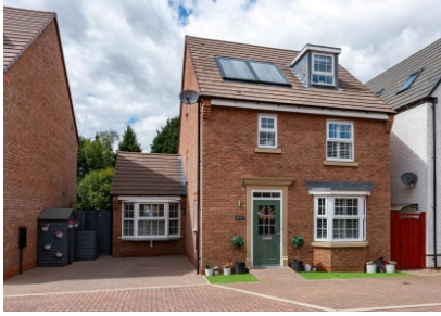
43 Henry Fowler Drive, Tettenhall, Wolverhampton, WV6 8TN