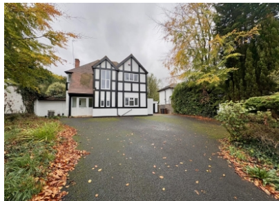
75 Compton Road, Wolverhampton