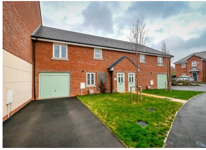
1 Crossfield Crescent, Albrighton