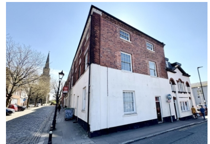
Studio 3, 17 Bond Street, Wolverhampton