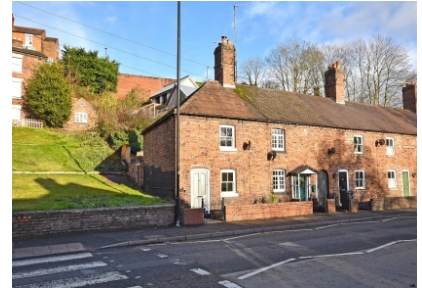
24 Hollybush Road, Low Town, Bridgnorth, Shropshire