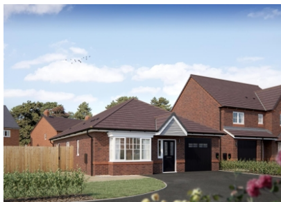
Plot 23 Derrington Meadows, Ditton Priors, Bridgnorth