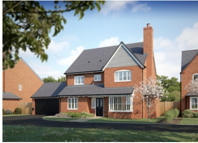
Plot 4 Derrington Meadows, Ditton Priors, Bridgnorth