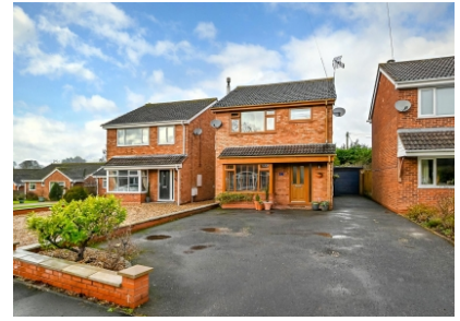
7 Mallards Close, Alveley, Bridgnorth