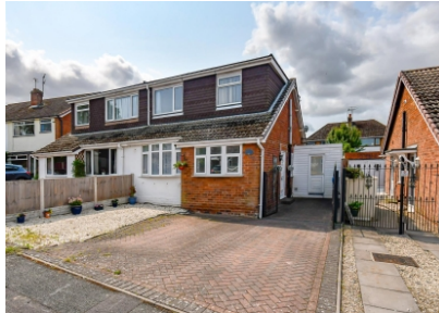
Chapel Close, Wombourne, Wolverhampton