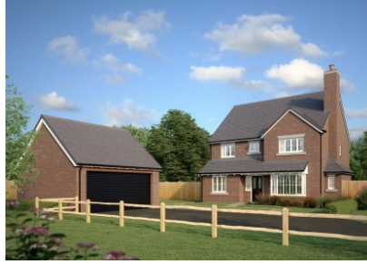
Plot 287 Farriers Gate, Nedge Hill, The Hem