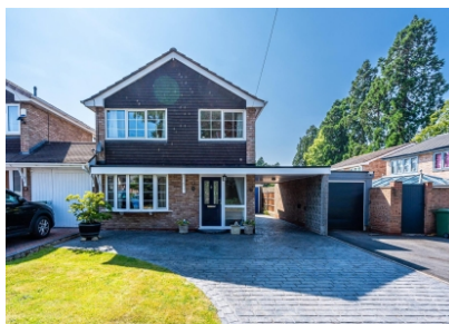
2 Aldwyck Drive, Castlecroft, Wolverhampton, WV3 8NE