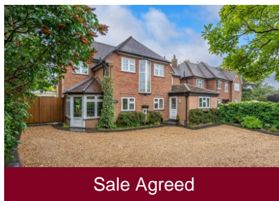
15 Wood Road, Tettenhall Wood, Wolverhampton, WV6 8NG