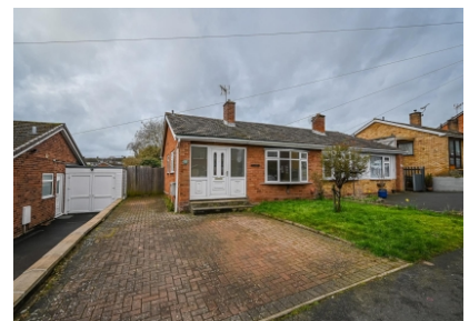
13 Queensway Drive, Bridgnorth