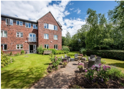
Wombrook Court, Wombourne, Wolverhampton