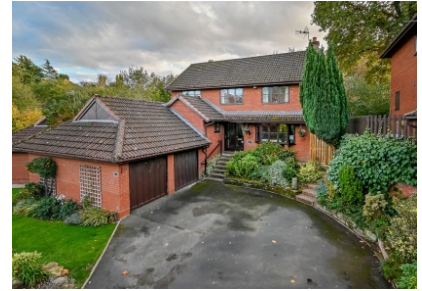
1 Wells Close, Bridgnorth