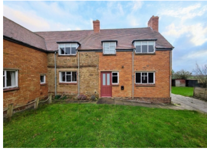
2 Stone Cottages, Six Ashes Road, Six Ashes, Bridgnorth