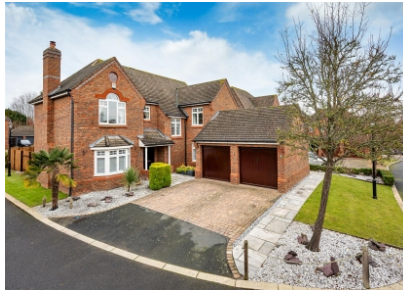
10 The Moat House, Eardington, Bridgnorth