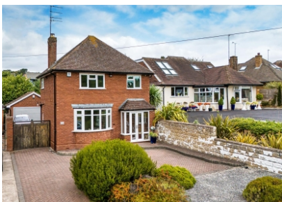
112 Bridgnorth Road, Wightwick, Wolverhampton, WV6 8AG