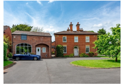
2D Woodthorne Grange, Tettenhall