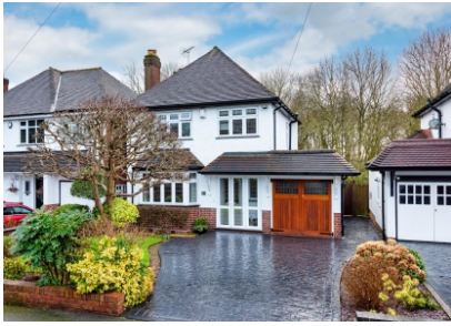
42 Wootton Road, Finchfield, Wolverhampton, WV3 8EG