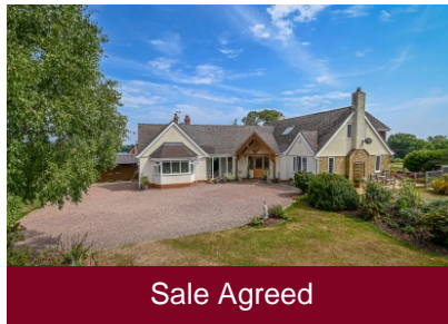
Ash Croft, Glazeley, Bridgnorth