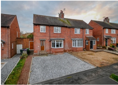
122 Victoria Road, Bridgnorth