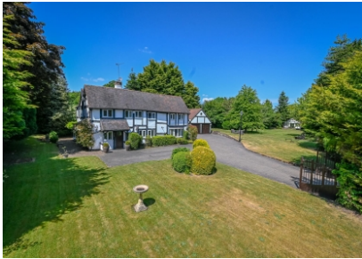
Hallonsford Cottage, Worfield, Shropshire