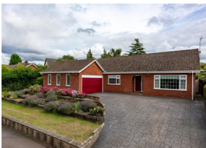
Heatherglades, The Firway, Bishops Wood, Stafford, ST19 9AU