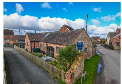
The Barn, Manor Farm, Stottesdon, Kidderminster