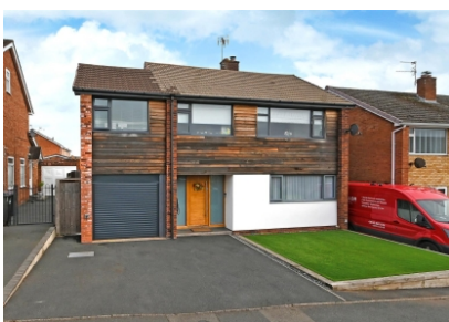
12 Queensway Drive, Bridgnorth