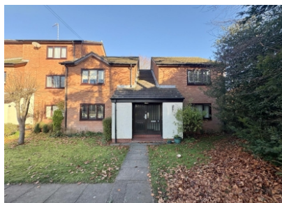
14 Cotswold Court, Penn