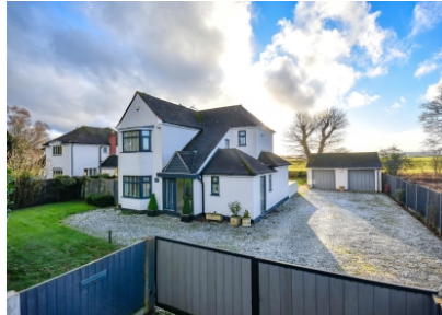
School House, Gospel Ash Road, Bobbington, Stourbridge