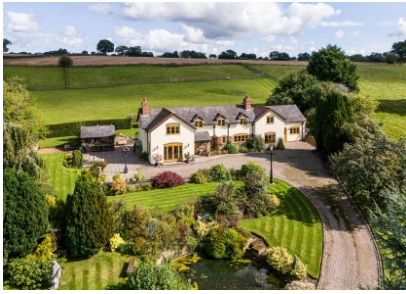
The Dairy Farm, Neenton, Bridgnorth