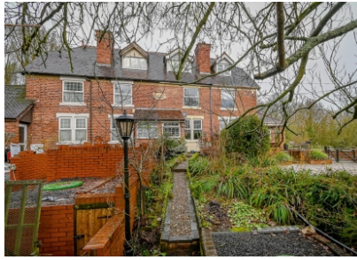
3 The Elms, Station Road, Highley, Bridgnorth