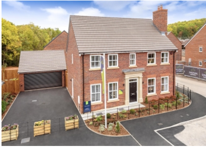
Plot 283 Farriers Gate, Nedge Hill, The Hem