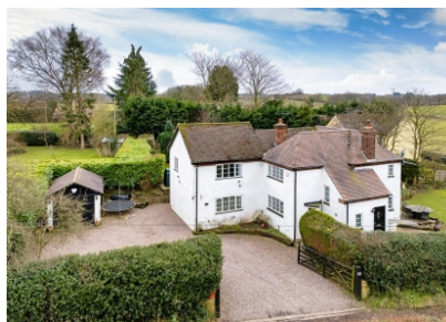
Coldham Cottage, Foxes Lane, Coldham, Brewood, ST19 9BJ