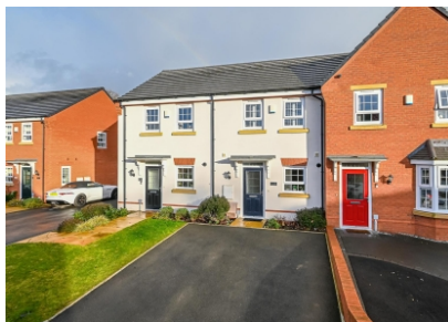
23 Narburgh Place, Alveley, Bridgnorth