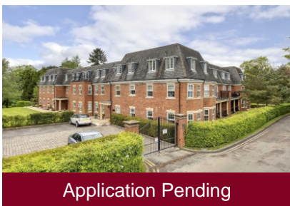
6 Castlecroft House, Castlecroft