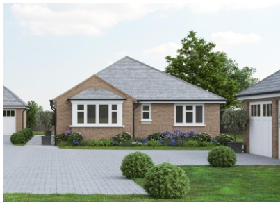
21 Swallowdale, Wightwick, Wolverhampton, WV6 8DT