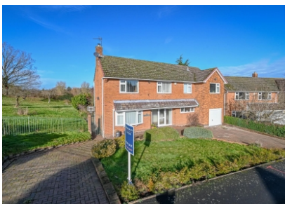
Tanglewood, 12 The Wold, Claverley, Wolverhampton