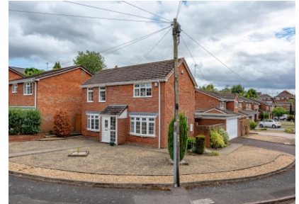
Churchward Grove, Wolverhampton