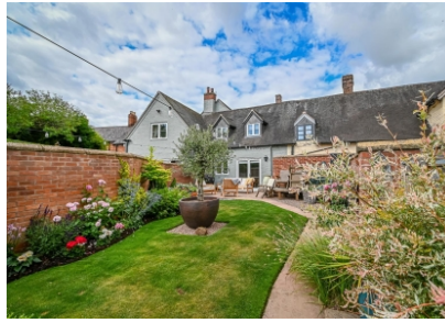
Iris Cottage, 5 Bull Ring, Claverley, Wolverhampton