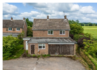
7 Shackerley Lane, Albrighton, Wolverhampton, WV7 3AB