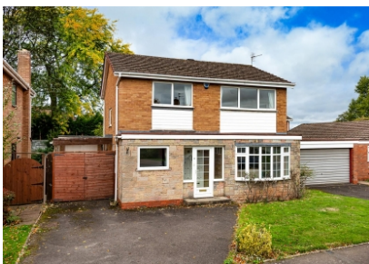
2 Leacote Drive, Tettenhall, Wolverhampton, WV6 8NB