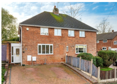
54 Bull Lane, Wombourne, Wolverhampton