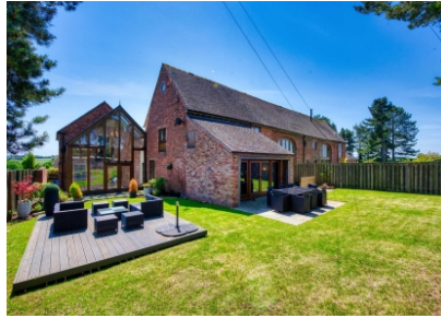
Morbrook Barn, Watery Bank, Bishops Wood