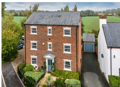
49 Deacons Field, Brewood, Stafford, ST19 9GA