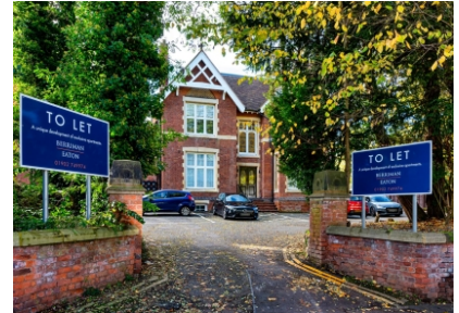
8 Beacon House, Tettenhall Road