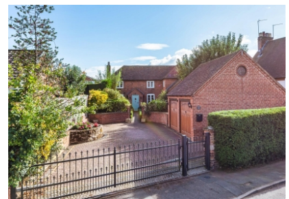
Apple Tree Cottage, 53 High Street, Pattingham, Wolverhampton, WV6 7BH