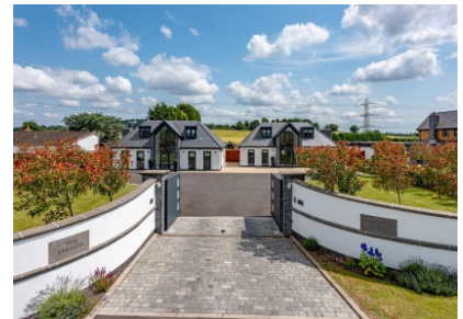
The Stables, Mile Flat, Greensforge, Kingswinford