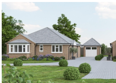
19 Swallowdale, Wightwick, Wolverhampton, WV6 8DT