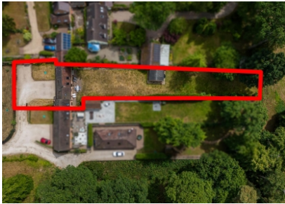
Wentworth Barn, 2 Patshull Gardens, Albrighton, Wolverhampton, WV7 3BG