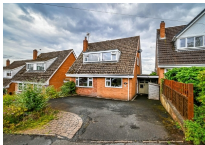
33 Ludlow Heights, Bridgnorth