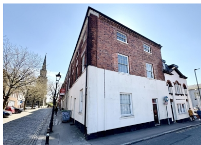
Studio 11, 17 Bond Street, Wolverhampton