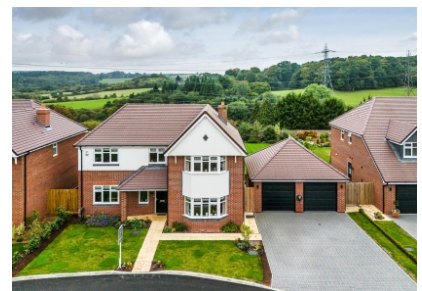
Beaumont, 1 Rowan Grange, Broseley