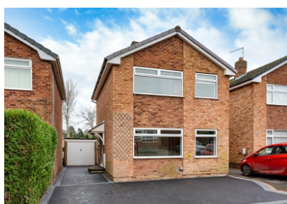
4 Easthall Close, Brewwood, Stafford, ST19 9EX