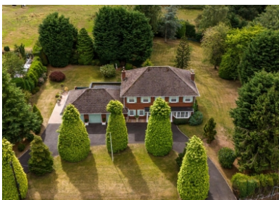
Windsor House, Off Oxy Road, Tong, Tong Norton, Shifnal, TF11 8PZ