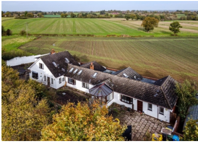
Jackanory Cottage, Sandy Lane, Bishops Wood, Stafford