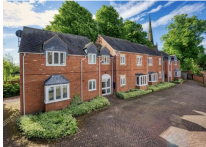
3 The Choristers, Brewood