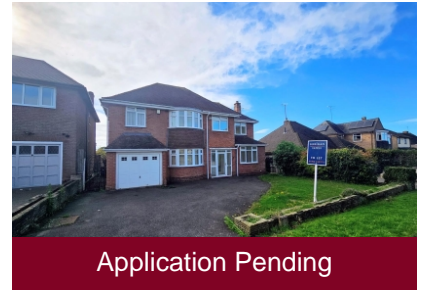
35 Sabrina Road, Wightwick