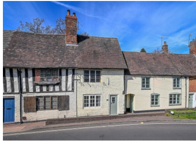
41 Mill Street, Bridgnorth