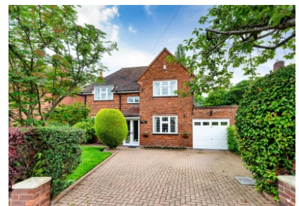
38 Cranford Road, Finchfield, Wolverhampton, WV3 8EP