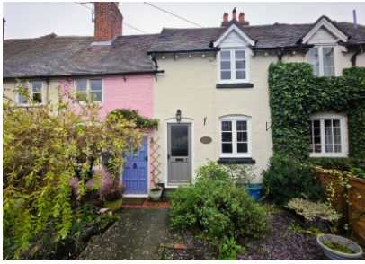
3 Northgate View, Bridgnorth, Shropshire