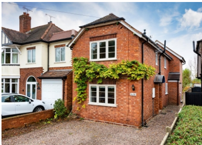
Hilltop, Coven Road, Brewood, Stafford, ST19 9DF