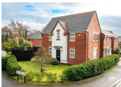
Gilt Stock Way, Dudley