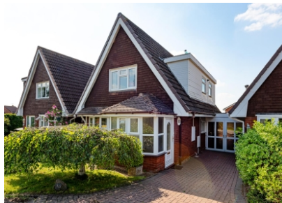
Chestnut Drive, Wombourne, Wolverhampton