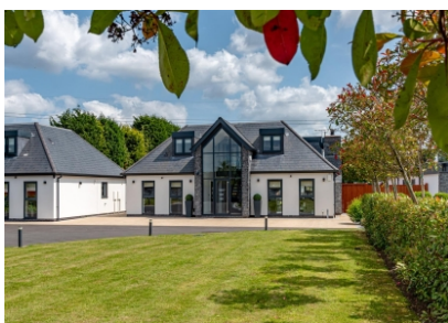
Meadow View, Mile Flats, Greensforge, Kingswinford