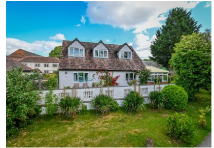
Foundry Cottage, Bandon Lane, Bridgnorth