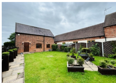
The Annexe, Hollies Lane, Pattingham