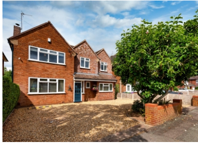
16 Farm Road, Finchfield, Wolverhampton, WV3 8EW