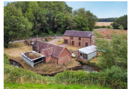
The Mill, Badger, Shropshire, WV6 7JU