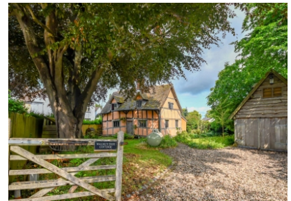
Walnut Tree Cottage, Springhill Lane, Lower Penn, Wolverhampton