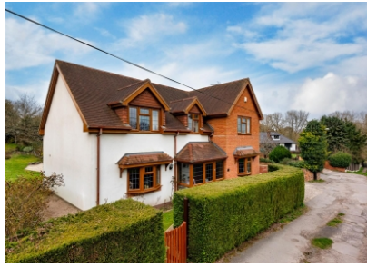
37 Chapel Lane, Smestow