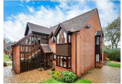
22 Highgrove, Tettenhall, Wolverhampton, WV6 8LQ