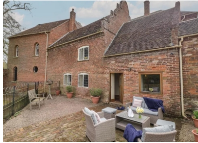
The Malthouse, Four Ashes Hall, Bridgnorth Road