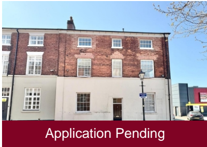
Studio 6, 17 Bond Street, Wolverhampton