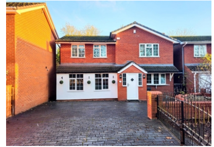
4 Brookside Drive, Hilton, Bridgnorth