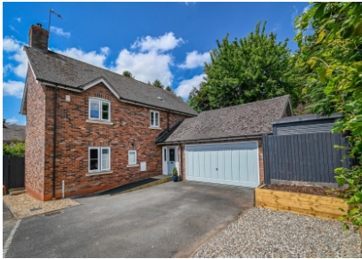
Beeches Hollow, 7a Stratford Lane, Hilton, Bridgnorth