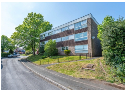
40 High Meadows, Compton, Wolverhampton, WV6 8PP