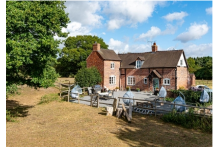
Leper House, Whitehouse Lane, Codsall, Wolverhampton, WV8 1QG