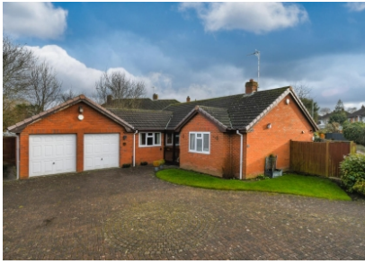
17a Chapel Lane, Codsall, Wolverhampton, WV8 2EJ