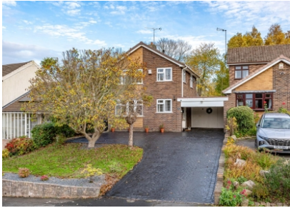
28 Penn Road, Gospel End