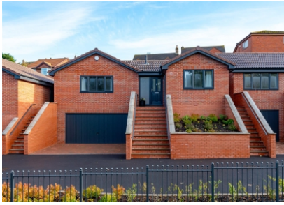
31 Auckland Road, Kingswinford