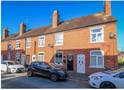
49 Severn Street, Bridgnorth