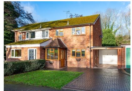
32 Woodland Close, Albrighton, Wolverhampton, WV7 3PR