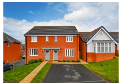
Foxglove Way, Himley, Dudley