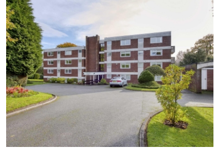
5 Eynsham Court, Clifton Road, Stockwell End, Tettenhall, WV6 9AR