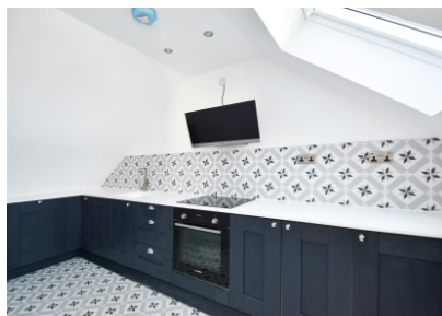
Apartment 13, Beacon House, 267 Tettenhall Road