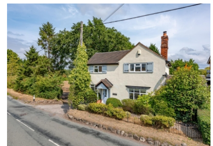
Smestow Gate Cottage, Smestow, Swindon, Dudley