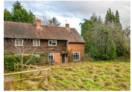
2 New Cottages, Six Ashes, Bridgnorth