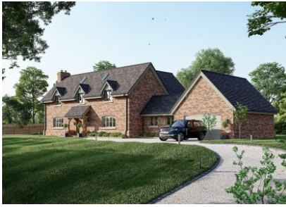
Building Plot, Middle House, Corfton, Craven Arms