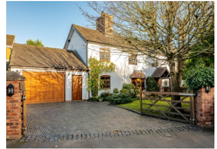
Daffodil Cottage, 94 Coven Road, Brewood, Stafford, ST19 9DF