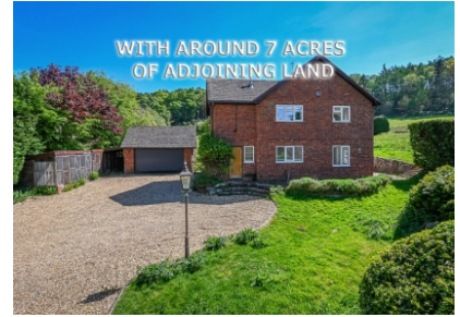
Quatford Grange, Sandyburn Lane, Quatford, Bridgnorth