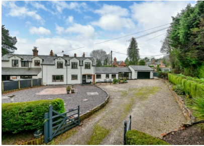
The Woodlands, Oldbury, Bridgnorth