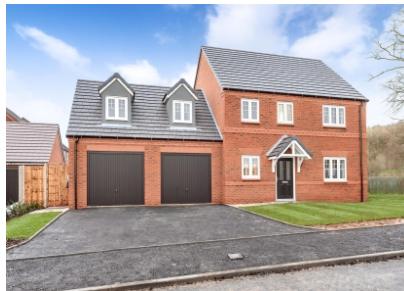
Plot 252 Farriers Gate, Nedge Hill, The Hem