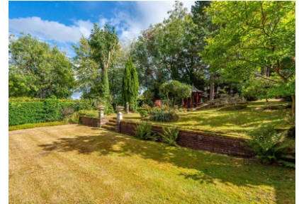
The Rafter's, Flat 5 Dippons House, Dippons Drive, Wolverhampton