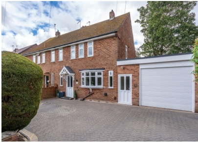
Corner House, 6 Palmers Way, Codsall, Wolverhampton, WV8 2JY