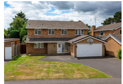
1 Saxon Court, Tettenhall, Wolverhampton, WV6 8SA