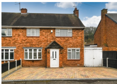
13 Meadow Lane, Wombourne, Wolverhampton