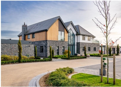
The Paddocks, Mile Flat, Kingswinford