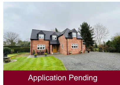
Ketley View, School Road, Trysull