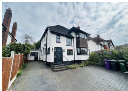
59 York Avenue, Finchfield