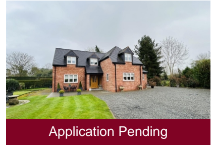
Ketley View, School Road, Trysull