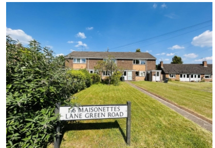
4 The Maisonnets, Lane Green Road, Codsall