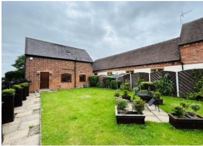
The Annexe, Hollies Lane, Pattingham