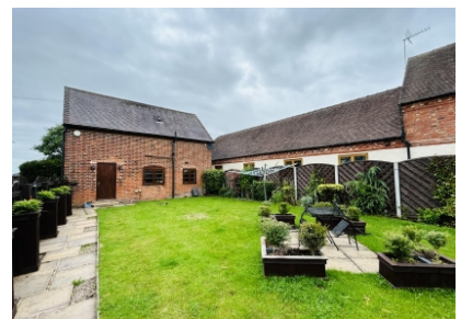
The Annexe, Hollies Lane, Pittingham