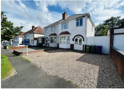
20 Regent Road, Penn