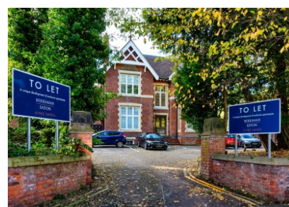
Apartment 6, Beacon House, 267 Tettenhall Road, Newbridge