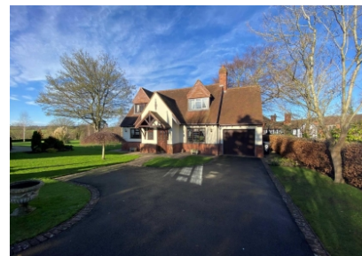
Orchard Cottage, High Street, Claverley