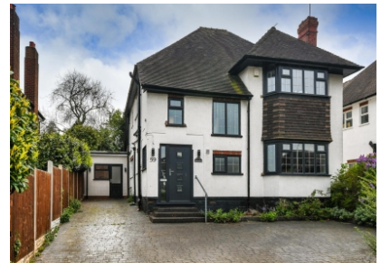
59 York Avenue, Finchfield