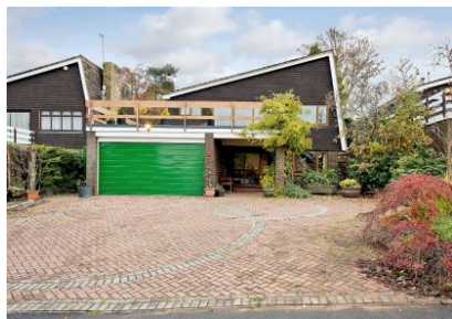
18 Perton Brook Vale, Wightwick