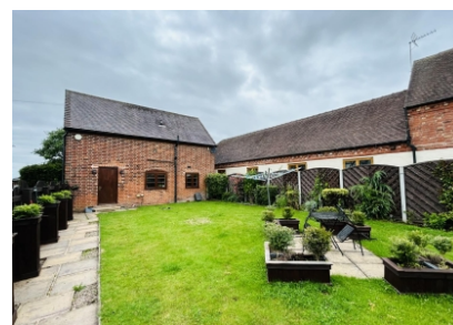
The Annexe, Hollies Lane, Pattingham