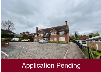
9 Windmill Fold, Wombourne