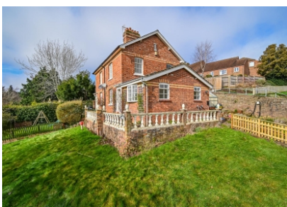
2 Rose Lane, Bridgnorth