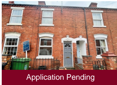
Wheeler Street, Stourbridge, Stourbridge