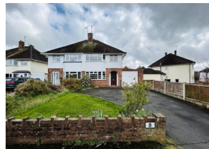
8 Brooklands Road, Albrighton