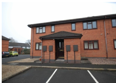
12 Bilbrook Court, Bilbrook Road, Codsall, WolverhamptonSouth Staffordshire