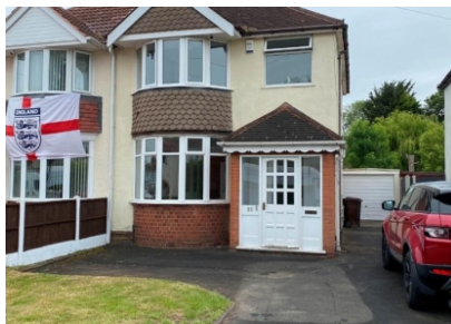
25 Elm Avenue, Wolverhampton, WV11 1DS