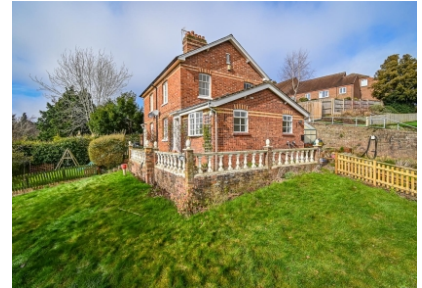
2 Rose Lane, Bridgnorth