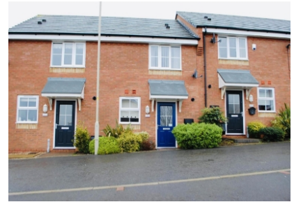
40 Haslingden Crescent, Dudley