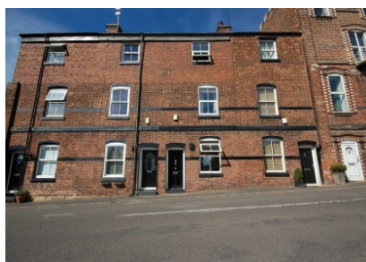
60 Sedgley Road, Wolverhampton, WV4 5JS