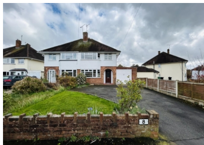
8 Brooklands Road, Albrighton