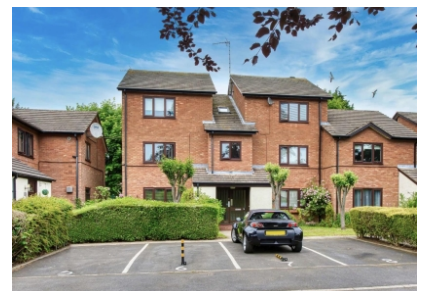
10 Cotswold Court, Penn