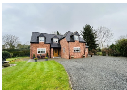
Ketley View, School Road, Trysull