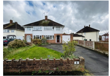
8 Brooklands Road, Albrighton