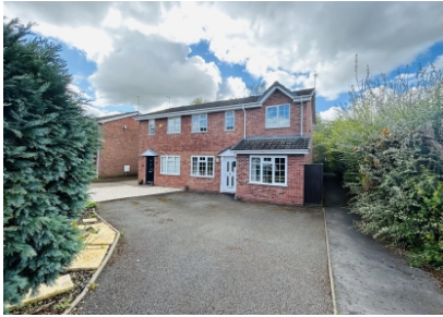
23 Cheriton Grove, Perton