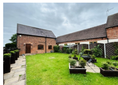
The Annexe, Hollies Lane, Pittingham