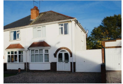
20 Regent Road, Penn