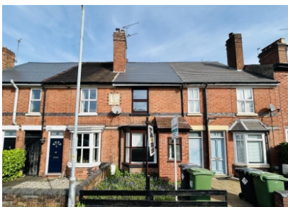
46 Regis Road, Tettenhall