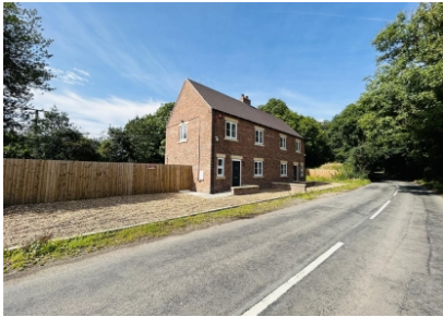
1 Lower Avenue Cottage, Coven