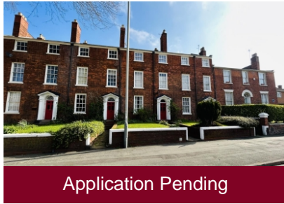
Flat 3, 28 Tettenhall Road, Wolverhampton