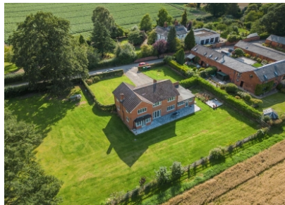
Oaklands Farm, Lower Rudge, Pattingham