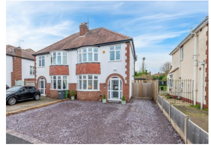
15 Wychbury Road, Finchfield, Wolverhampton, WV3 8DN