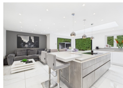
2 Gallows Hill, Kinver, Stourbridge