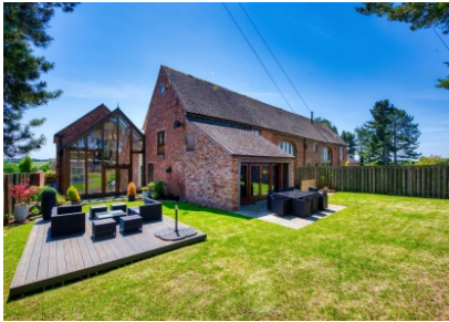
Morbrook Barn, Watery Bank, Bishops Wood

Page 13 of 71 21 September 2025 21:32:47