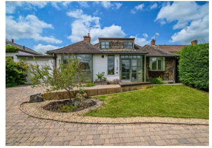
14 Love Lane, Bridgnorth