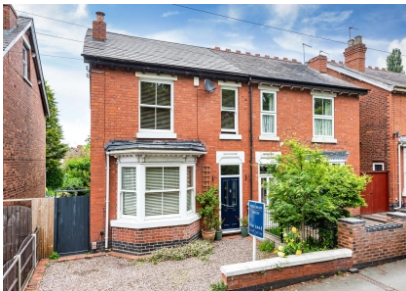
53 Finchfield Road, Finchfield, Wolverhampton, WV3 9LQ