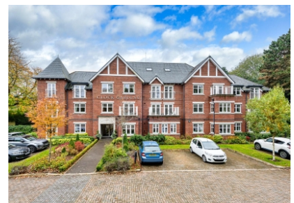
5 Clock Gardens, Stockwell Road, Tettenhall, Wolverhampton, WV6 9PS