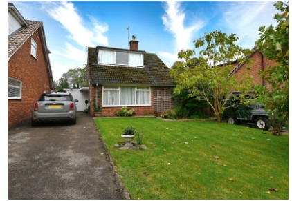
65 Six Ashes Road, Bobbington, Stourbridge