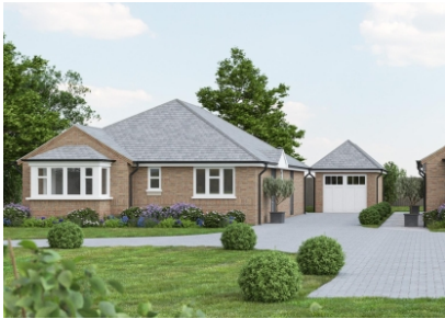
19 Swallowdale, Wightwick, Wolverhampton, WV6 8DT

Page 19 of 71 21 September 2025 21:32:47