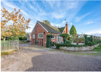
Cherrydene, Halfpenny Green, Bobbington