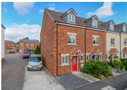
41 Wenlock Rise, Bridgnorth