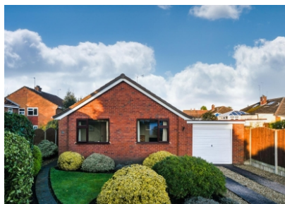
2 Green Acres, Wombourne, Wolverhampton