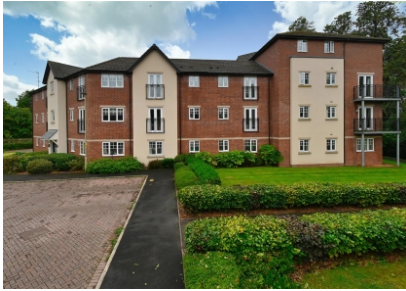
20 Greyfriars House, Kings Court, Stourbridge Road, Bridgnorth