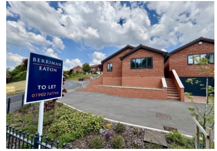
29 Auckland Road, Kingswinford