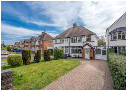
160 Henwood Road, Tettenhall, Wolverhampton, WV6 8PA