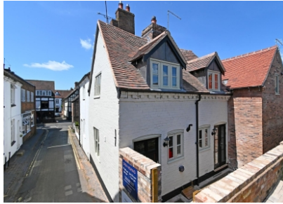
The Moat House, 14 Moat Street, Bridgnorth