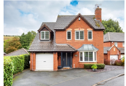
1 Brook Hollow, Bridgnorth