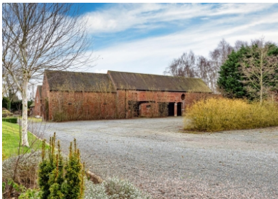
Barns for conversion, Newport, TF10 9BA