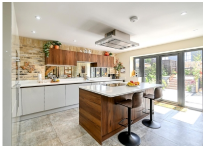
1 The Grain Store, Glazeley, Bridgnorth