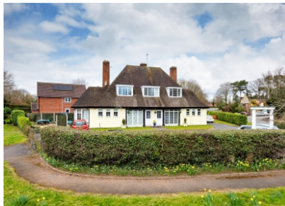
4 Seven Stars, Fox Road, Seisdon, Wolverhampton