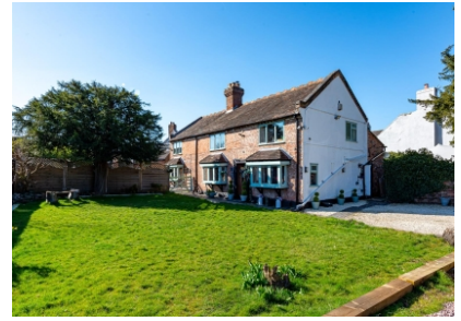
Elms Cottage, 4 Elms Lane, Shareshill, WV10 7JS