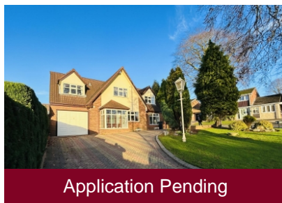
36 Gospel End Road, Gospel End, Sedgley