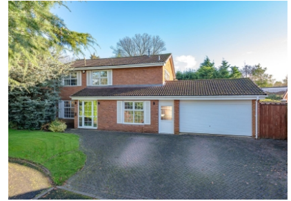
6 Redmoor Gardens, Wolverhampton