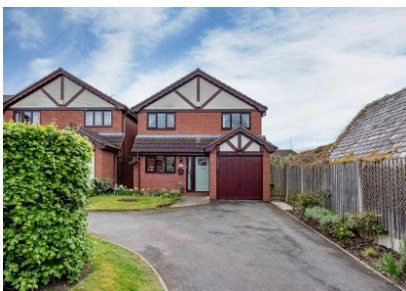
2 Sytch Lane, Wombourne, Wolverhampton