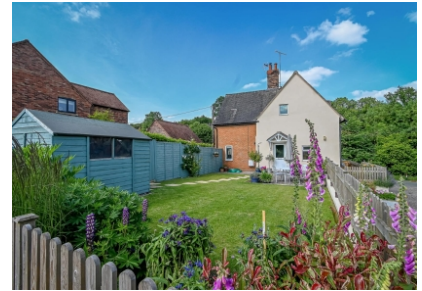
4 Brockton, Much Wenlock