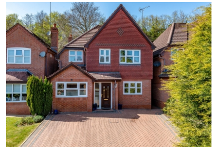
35 Hellier Drive, Wombourne, Wolverhampton