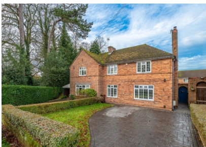
3 Woodhouse Road, Tettenhall Wood, Wolverhampton, WV3 8JL