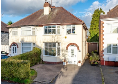
42 Regent Road, Wolverhampton