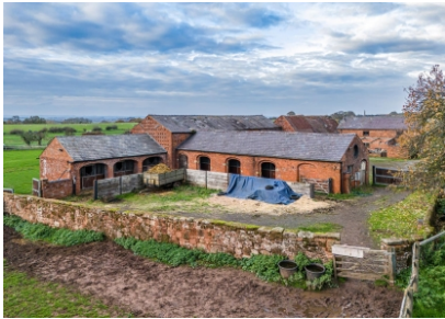
Shipley Grange Farm Barns, Bridgnorth Road, Shipley, Pattingham