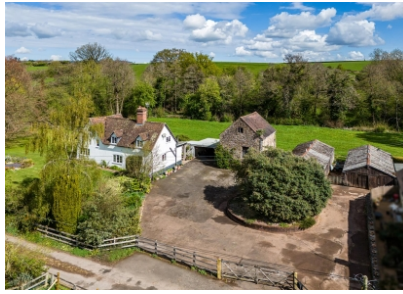
Lye Mill, Morville, Bridgnorth