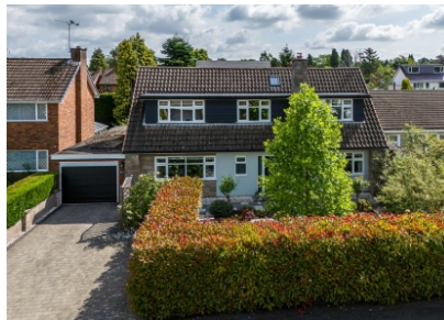
40 Cranmere Avenue, Tettenhall, Wolverhampton, WV6 8TS