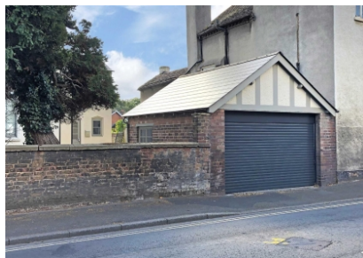
Garage for Rent, Salop Street, High Town, Bridgnorth