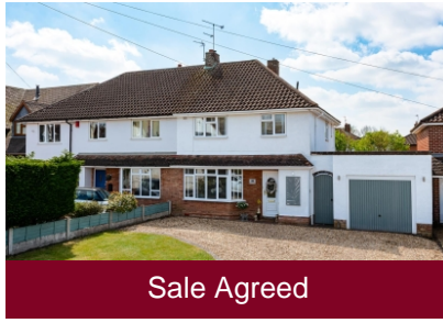
24 Queens Gardens, Codsall, Wolverhampton, WV8 2EP