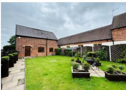
The Annexe, Hollies Lane, Pattingham