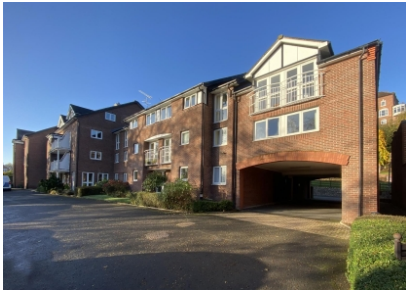
30 Lavington Court, Underhill Street, Bridgnorth