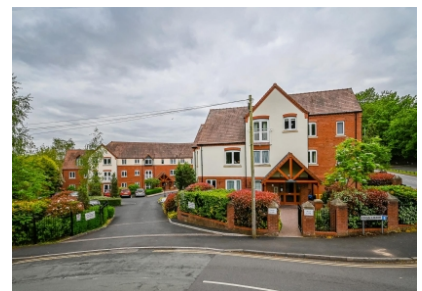
24 Farthings Court, Kings Loade, Bridgnorth