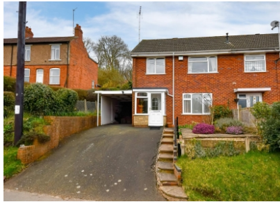
10 Battlefield Lane, Wombourne, Wolverhampton