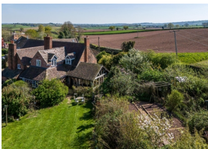
82 Haughton Cottages, Haughton, Bridgnorth