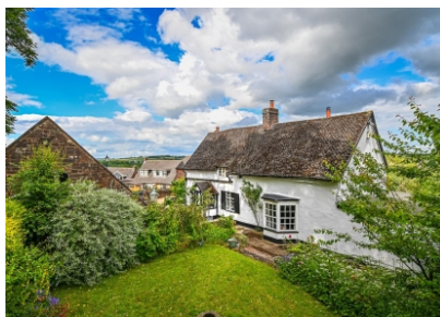
The Old Bell House, Alveley, Bridgnorth