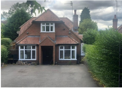
Old Birmingham Road, Marlbrook, Bromsgrove