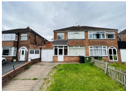
207 Aldersley Road, Claregate