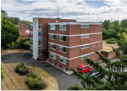
Flat 6, The Manor House, Upper Green, Tettenhall, Wolverhampton, WV6 8QJ