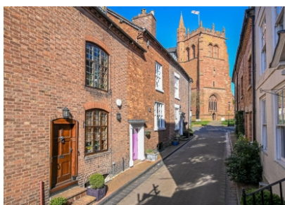
7 Church Street, Bridgnorth