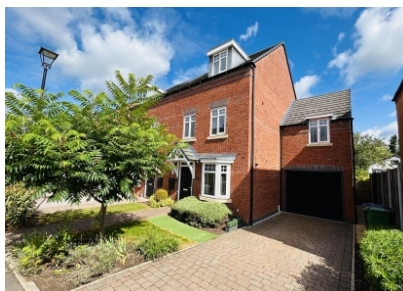
63 Henry Fowler Drive, Tettenhall