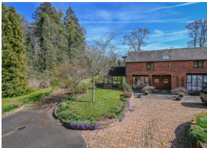
The Mill, Gatacre, Claverley