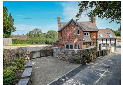
1 Shrewsbury Road, Cressage, Shrewsbury