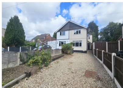
Pinfold Grove, Wolverhampton