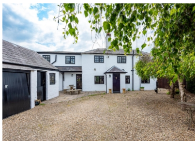
Whiston Cottage, Holyhead Road, Albrighton, Wolverhampton, WV7 3BT