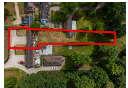
Wentworth Barn, 2 Patshull Gardens, Albrighton, Wolverhampton, WV7 3BG