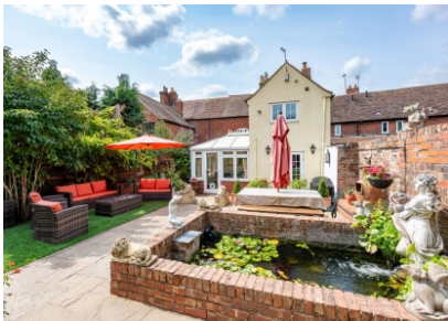
Cross Keys House, 62 Broadway, Shifnal, TF11 8AZ