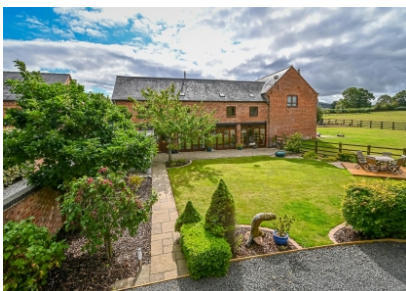
The Driftway, Ashfield Farm, Ditton Priors, Bridgnorth