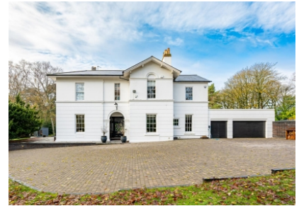
Duneden, Stourbridge Road, Wombourne