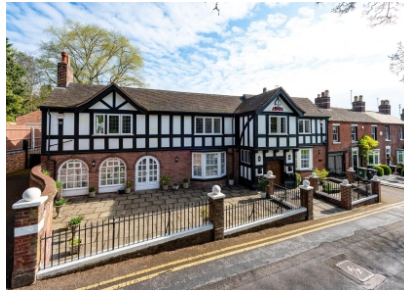
5E The Mitre, Lower Green, Wolverhampton