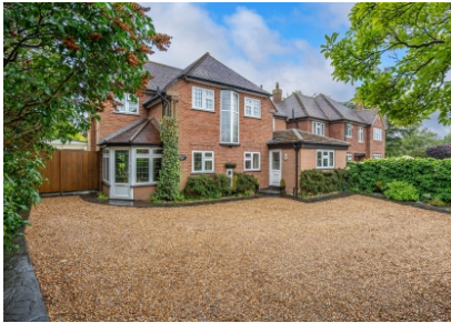
15 Wood Road, Tettenhall Wood, Wolverhampton, WV6 8NG

Page 14 of 71 21 September 2025 21:32:47