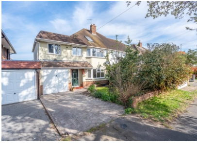
77 Station Road, Albrighton, Wolverhampton, WV7 3DP

Page 35 of 71 21 September 2025 21:32:48