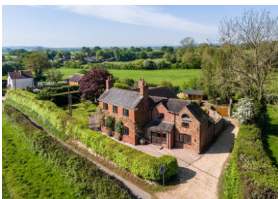
Midway House, Grooms Lane, Kemberton, Shifnal