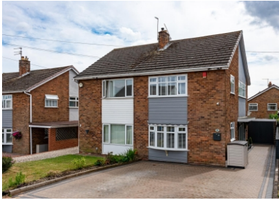
4 Oak Road, Brewood, Stafford, ST19 9HH