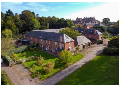
The Bothy (and Barns for conversion), Patshull Park, Patshull Hall, Burnhill Green, Wolverhampton