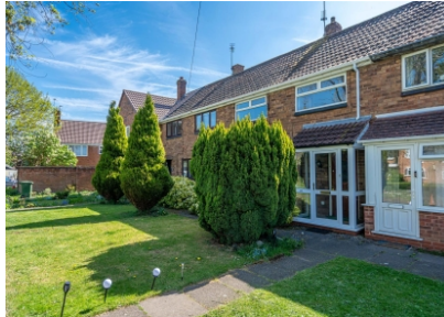
115 Cornwall Road, Tetterhall Wood, Wolverhampton, WV6 8UY