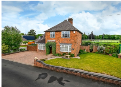
Corner Cottage, Love Lane, Bridgnorth