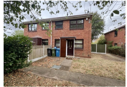
22 Melrose Drive, Perton