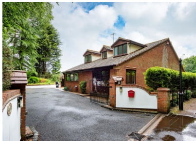
Earlswood Lodge, Stourbridge Road, Wolverhampton