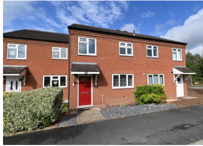
22 The Mall, Bridgnorth