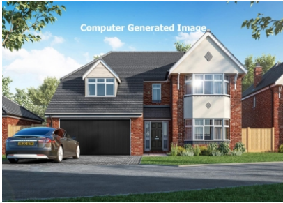
1A Rowan Grange, Broseley

Page 15 of 71 21 September 2025 21:32:47