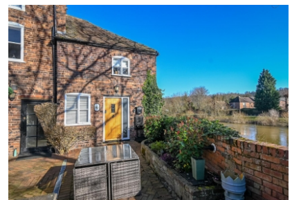
Sandward Cottage, 47a Cartway, Bridgnorth