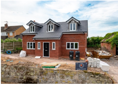
38 Moatbrook Lane, Codsall, Wolverhampton, WV8 1DS

Page 22 of 71 21 September 2025 21:32:48