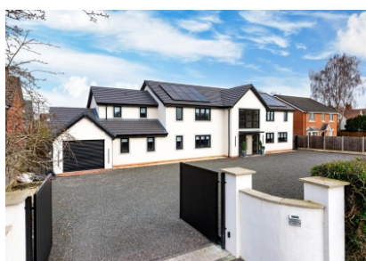
Church View, Sandy Lane, Codsall, Wolverhampton, WV8 1EW