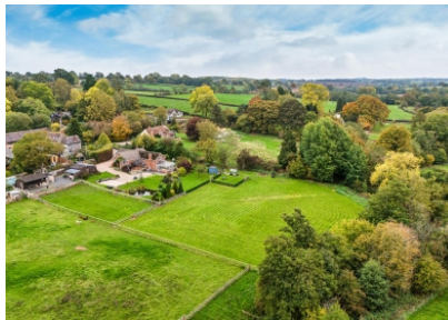
Reaside, Neenton, Bridgnorth