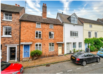
24 St. Marys Street, Bridgnorth