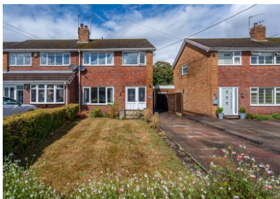
16 Queens Road, Calf Heath, Wolverhampton, WV1 7DT