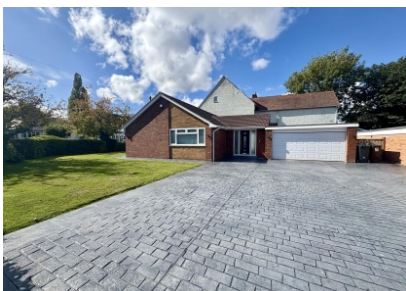
1 Glengarry Gardens, Finchfield