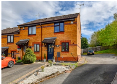
9 Bankside, Wombourne, Wolverhampton