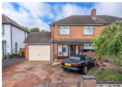
54 Derwent Road, Palmers Cross, Wolverhampton, WV6 9ES