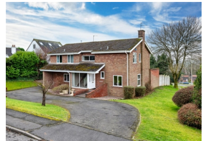
Coppins, Greenleights, Dudley