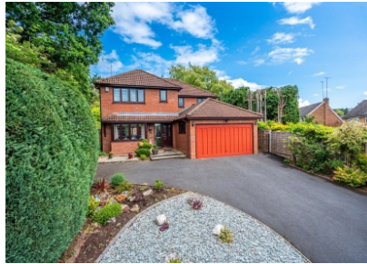
41 Quail Green, Wightwick, Wolverhampton, WV6 8DF