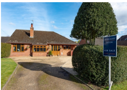
6 Bridgnorth Road, Himley, Dudley