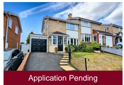
18 Sandy Lane, Codsall