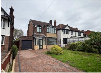
9 Fibbersley, Wolverhampton