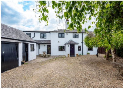
Whiston Cottage, Holyhead Road, Albrighton, Wolverhampton, WV7 3BT