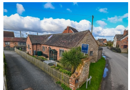
The Barn, Manor Farm, Stottesdon, Kidderminster