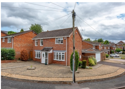
5 Churchward Grove, Wolverhampton