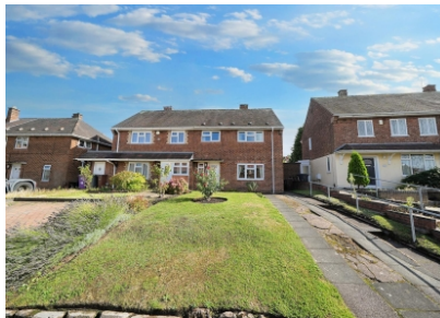
46 Burcot Avenue, Wolverhampton