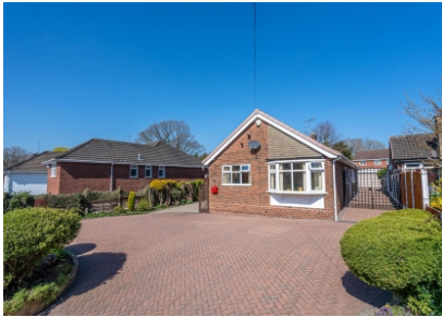
76 Mount Road, Tettenhall Wood, Wolverhampton

Page 27 of 71 21 September 2025 21:32:48