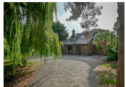
Ebenezer House, Eardington, Bridgnorth