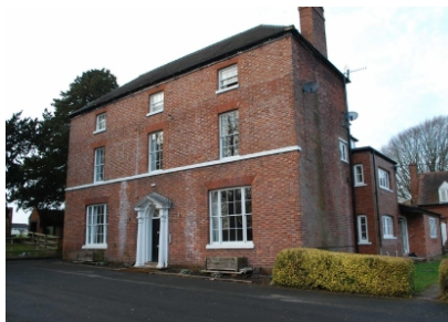
Swancote House, Swancote Bridgnorth, Shropshire