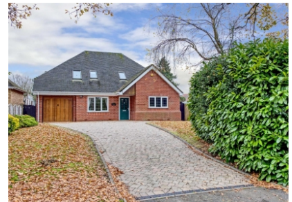
125 Wrotesley Road West, Tettenhall