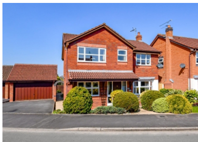
15 Penleigh Gardens, Wombourne