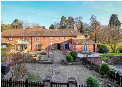
5 Stanmore Mews, Stourbridge Road, Stanmore, Bridgnorth