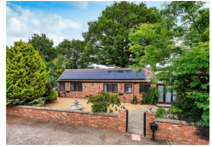
Meadow Cottage, Marsh Lane, Sheriffhales, Shifnal