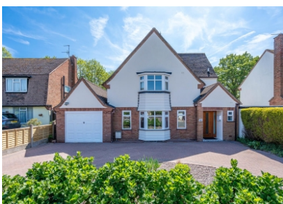
60 Oaken Park, Codsall, Wolverhampton, WV8 2BW