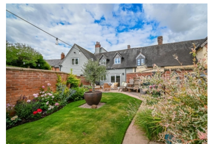
Iris Cottage, 5 Bull Ring, Claverley, Wolverhampton