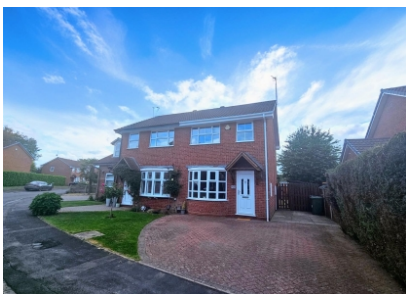
43 Stephenson Drive, Perton