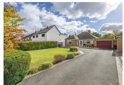
19 Tynninghame Avenue, Tettenhall, Wolverhampton, WV6 9PP