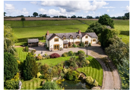
The Dairy Farm, Neenton, Bridgnorth