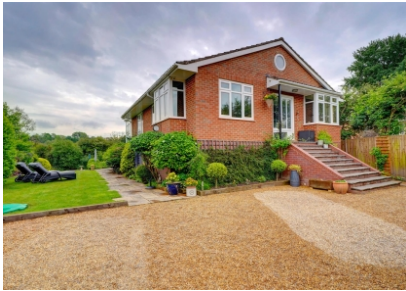
Severn Meadow, Astley Burf, Stourport-On-Severn

Page 18 of 71 21 September 2025 21:32:47