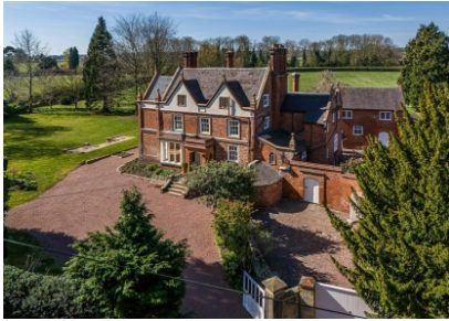
Old Manor House, Seisdon Road, Seisdon, Wolverhampton