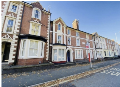
Apartment 1, 11 Tettenhall Road, Wolverhampton