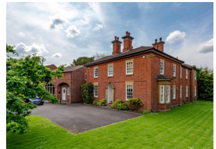
2D Woodthorne Road, Tettenhall, Wolverhampton