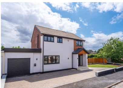
3 Newgate, Pattingham, Wolverhampton, WV6 7AG