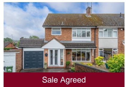
9 Sutherland Drive, Wombourne