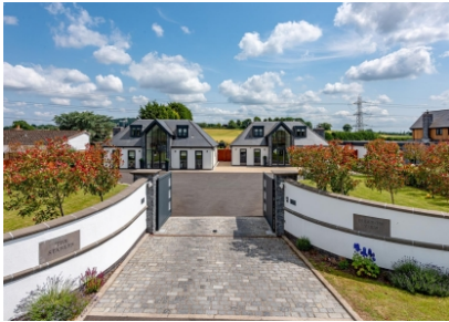
The Stables, Mile Flat, Greensforge, Kingswinford