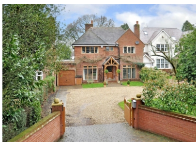
The Hatherings, Histons Hill, Codsall, Wolverhampton, WV8 2HA