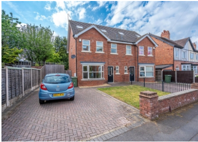
1 Marchant Road, Compton, Wolverhampton, WV3 9QG

Page 48 of 71 21 September 2025 21:32:48