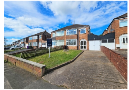
209 Aldersley Road, Claregate