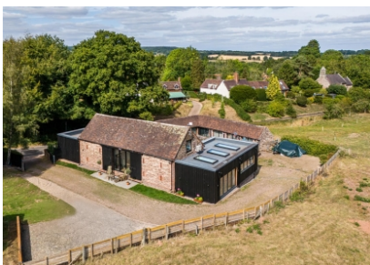
The Fold Yard, Aston Eyre, Bridgnorth