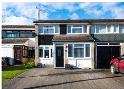
13 The Square, Pattingham, Wolverhampton, WV6 7BZ