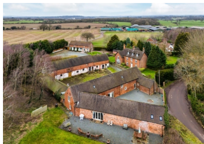
The Stockton House Estate, Newport, TF10 9BA