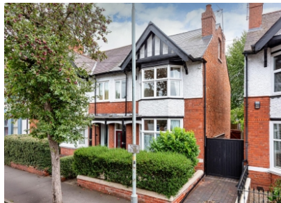
15 Paget Road, Wolverhampton, WV6 0DS