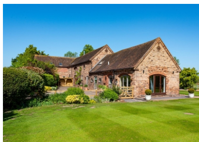
Dingle Cottage, Badger, Wolverhampton, WV6 7JU