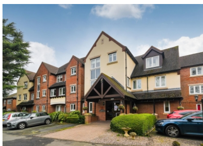
Flat 8, Pendene Court, Penn Road, Wolverhampton