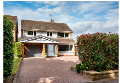
105 Suckling Green Lane, Codsall, Wolverhampton, WV8 2BZ