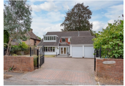
Stonegarth, Greenhill, Wombourne, Wolverhampton