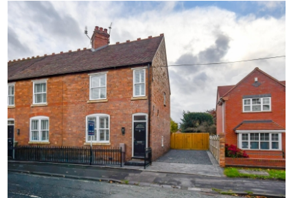
7 Planks Lane, Wombourne, WOLVERHAMPTON