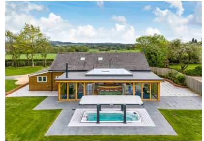
The Old Village Hall, Stanlow, Pattingham, Wolverhampton