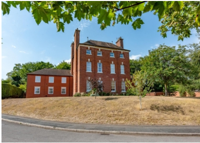
8 Mansion Court, Heath House Drive, Wombourne, Wolverhampton

Page 60 of 71 21 September 2025 21:32:49