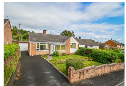
Fermain, 40 Ludlow Road, Bridgnorth