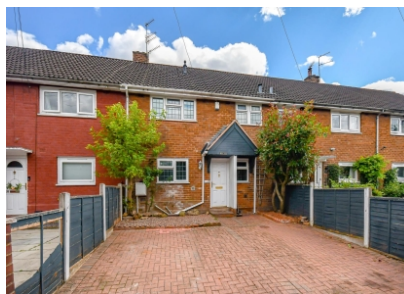
26 Brook Road, Wombourne