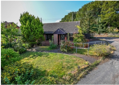
1 Church View, St. Giles Terrace, Chetton, Bridgnorth

Page 59 of 71 21 September 2025 21:32:49