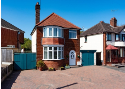
152 Fairview Road, Penn, Wolverhampton