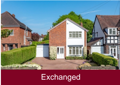
334A Penn Road, Wolverhampton