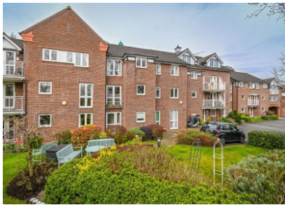
26 Lavington Court, Underhill Street, Bridgnorth

Page 63 of 71 21 September 2025 21:32:49