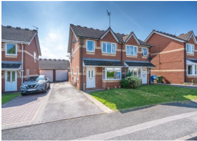
127 Wesley Road, Codsall, Wolverhampton, WV8 1JT

Page 53 of 71 21 September 2025 21:32:49