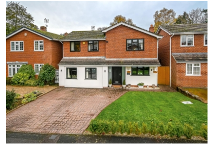
4 Willow Close, Hilton, Bridgnorth