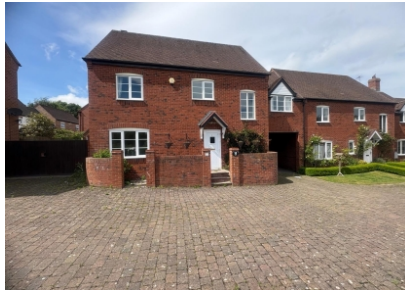
53 Hunters Gate, Much Wenlock