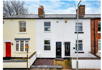
35 Limes Road, Tetterhall, Wolverhampton, WV6 8RD