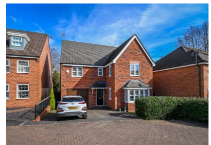
The Holtbrook, 2 Ludlow Gate, Bridgnorth