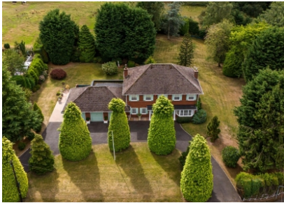
Windsor House, Off Oxey Road, Tong,, Tong Norton, Shifnal, TF11 8PZ