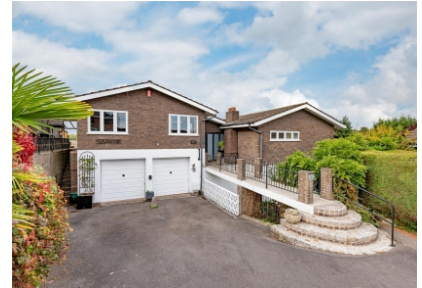
6 St. Johns Close, Swindon