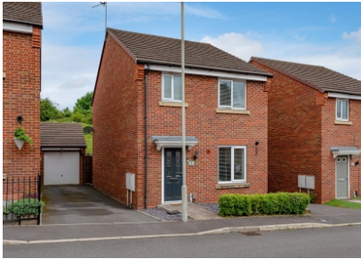
5 Taper Close, Kingswinford