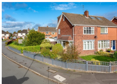
98 Van Diemens Road, Wombourne, Wolverhampton