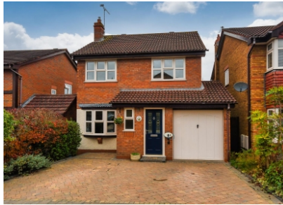
41 Penleigh Gardens, Wombourne, Wolverhampton