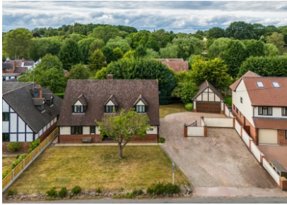
The Wendy House, Bell Road, Trysull, Wolverhampton