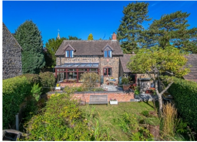
6 St. Johns Court, Ditton Priors, Bridgnorth