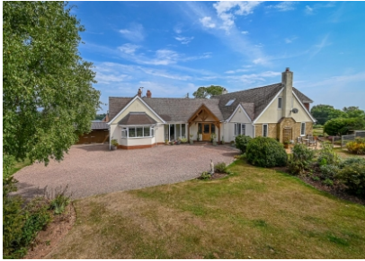
Ash Croft, Glazeley, Bridgnorth