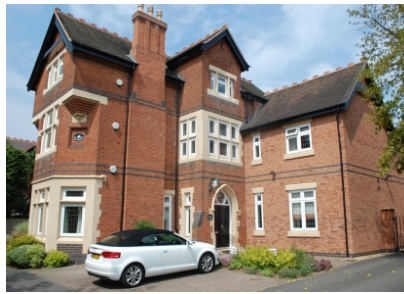
18C Southgate, Stockwell Road, Tettenhall