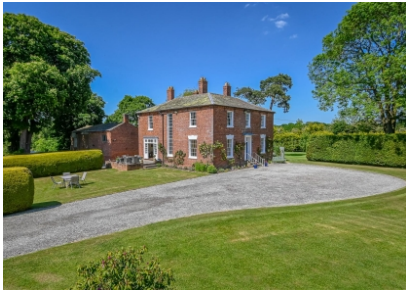
Manor House, Hughley, Shrewsbury