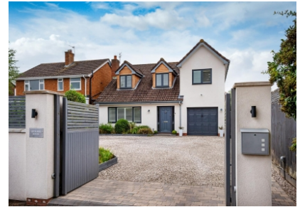
Hydeaway House, Station Road, Albrighton, Wolverhampton, WV7 3QG