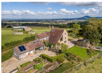
Wyres Barn, Kenley, Shrewsbury