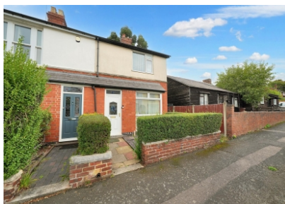
47 Belmont Road, Penn, Wolverhampton