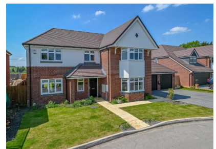
Beaumont, 1 Rowan Grange, Broseley