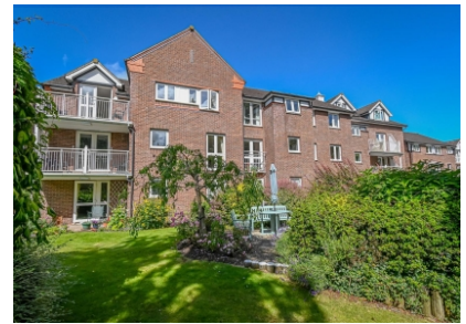
1 Lavington Court, Underhill Street, Bridgnorth