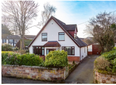
75 Birches Road, Codsall, Wolverhampton, WV8 2JJ