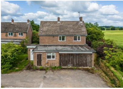
7 Shackerley Lane, Albrighton, Wolverhampton, WV7 3AB