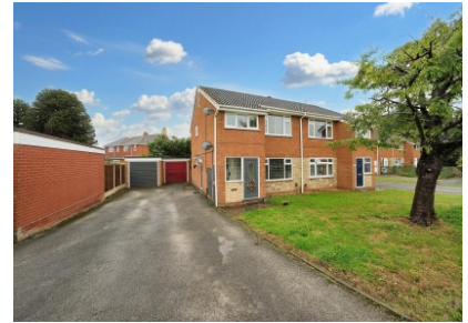
17 Swinford Leys, Wombourne, Wolverhampton