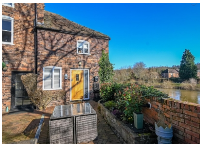
Sandward Cottage, 47a Cartway, Bridgnorth