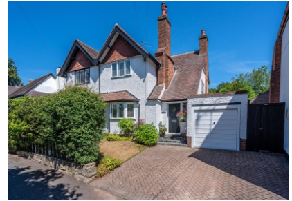
1 Woodlands Cottages, Penn Road, Wolverhampton