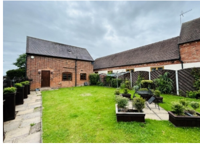
The Annexe, Hollies Lane, Pattingham