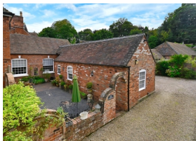
Corner House, 3 Stableford Hall, Stableford, Bridgnorth