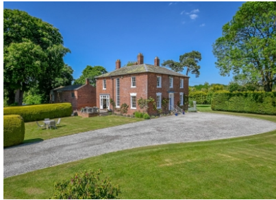
Manor House, Hughley, Shrewsbury