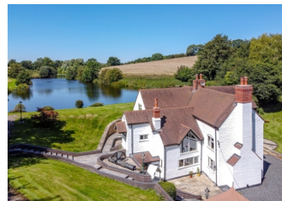
Hem Mill, The Hem, Shifnal