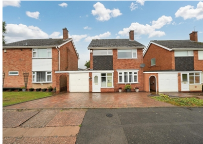
10 Dewsbury Drive, Wolverhampton