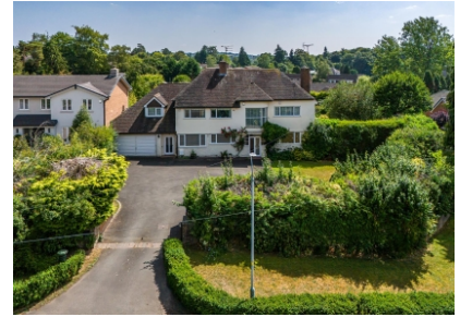
Perton Springs, 25 Perton Road, Wightwick, Wolverhampton, WV6 8DN