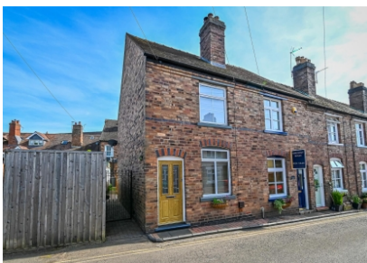
8 Cliff Road, Bridgnorth