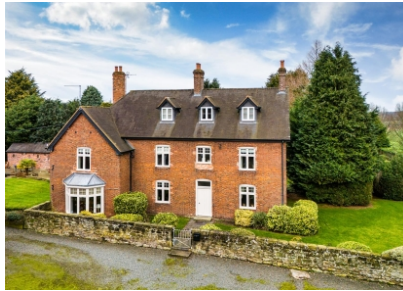
Stockton House, Newport, TF10 9BA