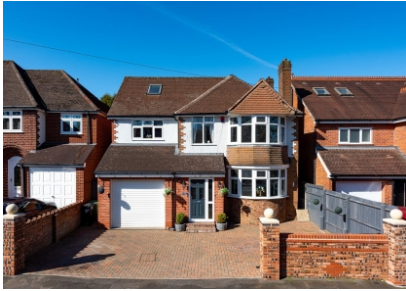
57 Queens Road, Sedgley, Dudley