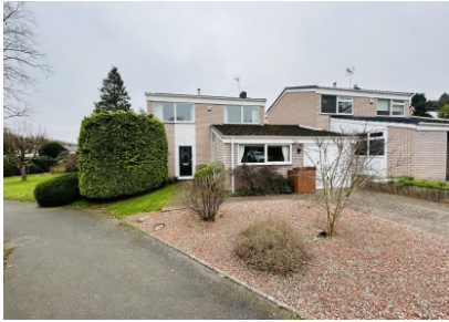
70 Woodfield Heights, Tettenhall, Wolverhampton