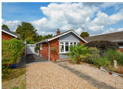
14 Holly Close, Kinver, Stourbridge