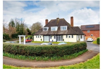
1 Seven Stars, Fox Road, Seisdon, Wolverhampton