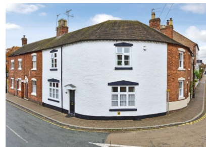
The Old Sweet Shop, 35 School Road, Brewood, Stafford, ST19 9DS