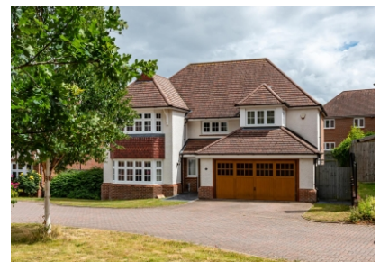
6 Pickwick Gardens, Compton, Wolverhampton, WV3 9EH