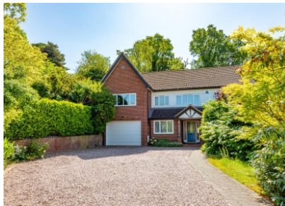
1 Castlecroft Lane, Wightwick, Wolverhampton, WV3 8JX