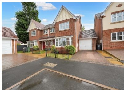
16 Hill Croft Gardens, Wolverhampton