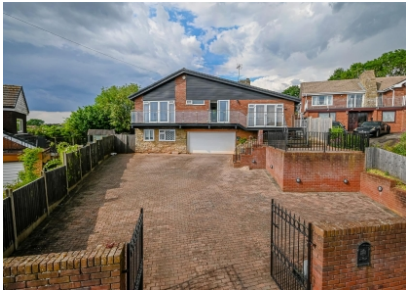
2 Carlton Rise, Highley, Bridgnorth

Page 34 of 71 21 September 2025 21:32:48