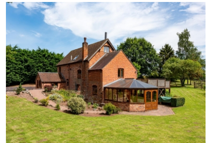
Lizard Mill, Lizard Lane, Tong, Shifnal, TF11 8QE