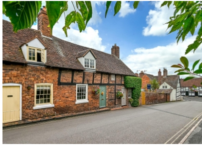
1 Cliff Road, Bridgnorth, Shropshire