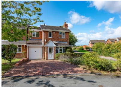
50 Cowley Drive, Dudley