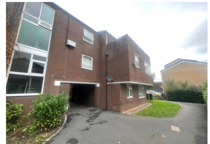
Boulton Grange, Telford