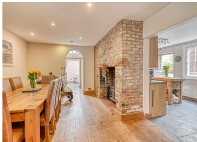
45 Hospital Street, Bridgnorth