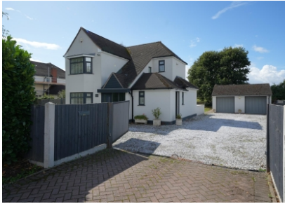
School House, Gospel Ash Road, Bobbington, Stourbridge