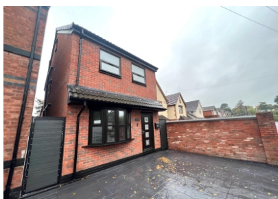
Sandy Lane, Tettenhall, Wolverhampton