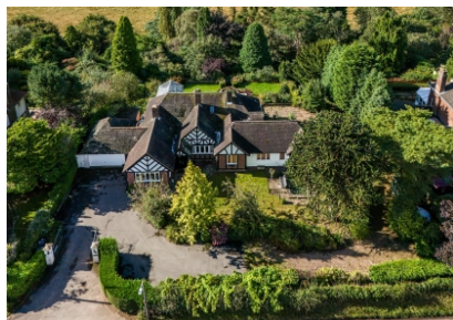
Tudor Lodge, Pattingham Road, Perton Ridge, Wolverhampton, WV6 7HD