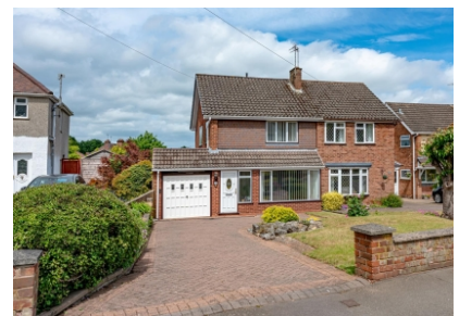
49 Common Road, Wombourne, Wolverhampton