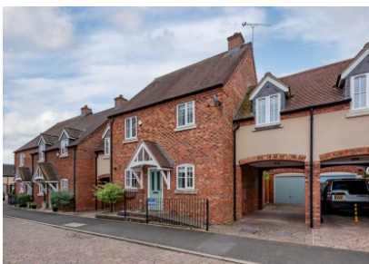
6 Stanham Close, Wombourne, Wolverhampton