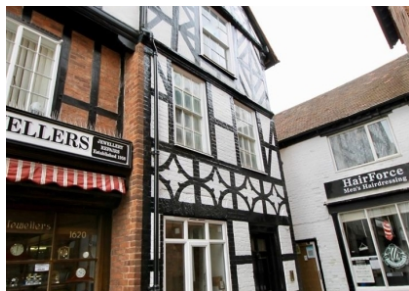
Flat 3, 3 High Street, Bridgnorth, WV16 4DB