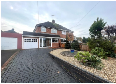
21 Bratch Lane, Wombourne, Wolverhampton