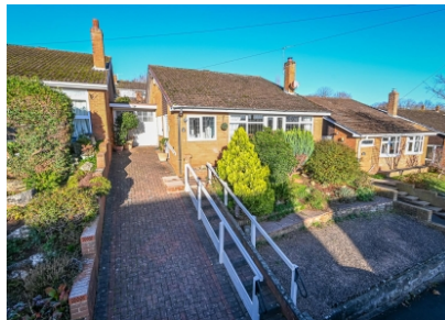
26 Ludlow Heights, Bridgnorth