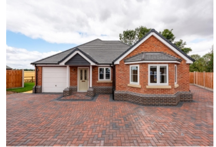
Bluebells, 6a School Close, Trysull, Wolverhampton