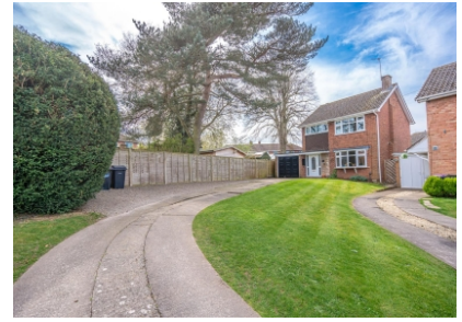
10 Grange Park, Albrighton, Wolverhampton, WV7 3EN