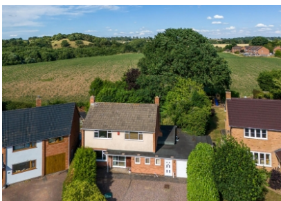
30 The Wold, Claverley, Wolverhampton