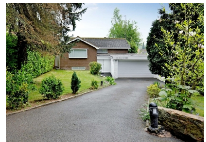
Blue Firs, Grove Lane, Wightwick