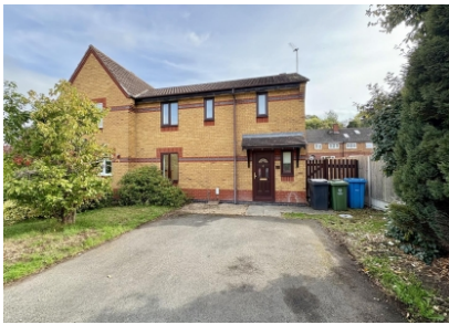
2 Bumblehole Meadows, Wombourne