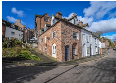
42 Riverside, Bridgnorth