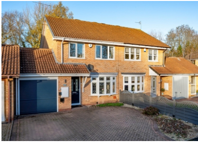
25 Blackbrook Way, Fordhouses, Wolverhampton, WV10 8TB