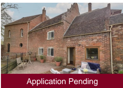
The Malthouse, Four Ashes Hall, Bridgnorth Road