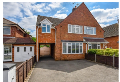
44 Sandringham Road, Wombourne, Wolverhampton