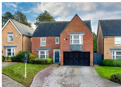
9 Henry Fowler Drive, Woodthorne Grange, Tettenhall, WV6 8TN