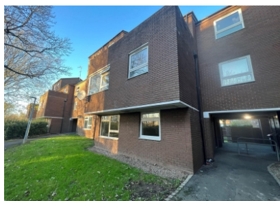
15 Boulton Grange, Telford