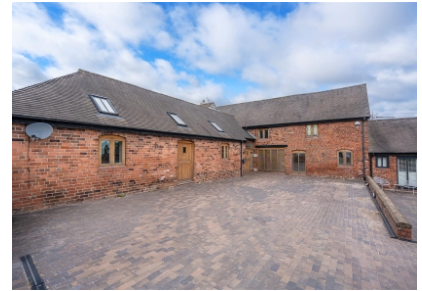
Barn 1, Knowle Bank Farm Knowles Bank, Shifnal, TF11 9PG