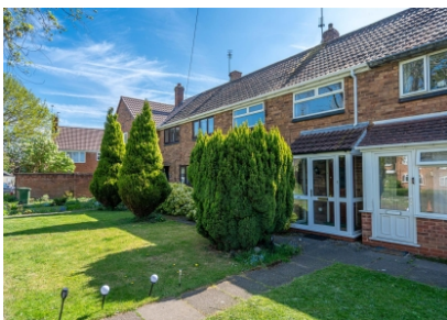
115 Cornwall Road, Tettenhall Wood, Wolverhampton, WV6 8UY