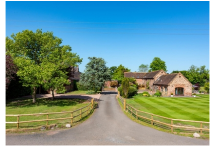
Dingle Cottage, Badger, Wolverhampton, WV6 7JU