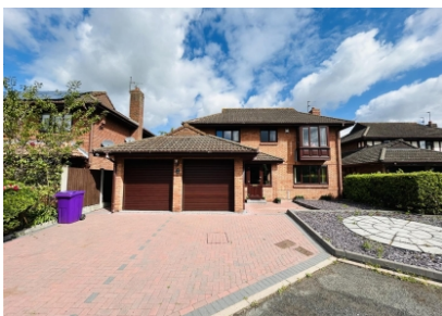
15 Midhurst Grove, Tettenhall