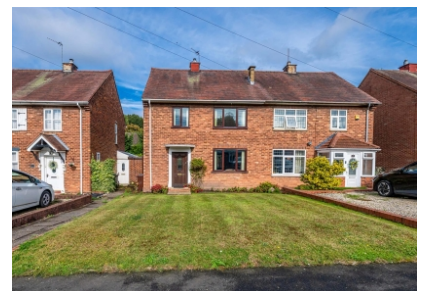
24 Bentley Road, Fordhouses, Wolverhampton, WV10 8DZ