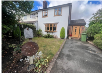
Coppercoin, Beckbury TF11 9DF