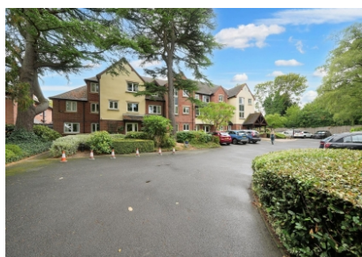
Flat 2 Penn Road, Wolverhampton