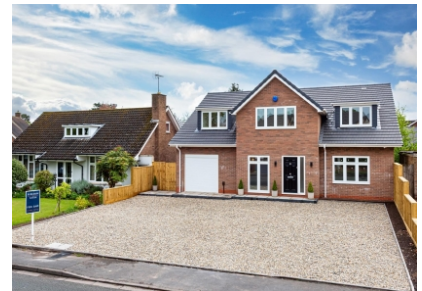
3 Yew Tree Lane, Tettenhall, Wolverhampton