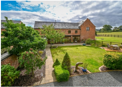
The Driftway, Ashfield Farm, Ditton Priors, Bridgnorth