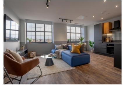
Sunbeam Apartments (2 beds), Paul Street Wolverhampton, WV2 4DH