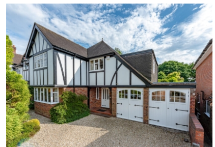
67 Sandringham Road, Penn, Wolverhampton