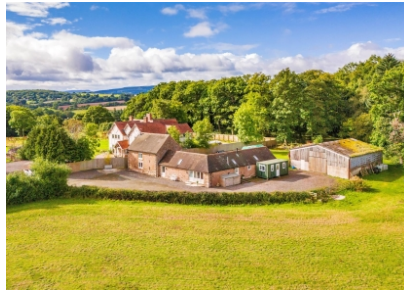
High Clear Barn, Beaconhill Lane, Monkthopton, Bridgnorth