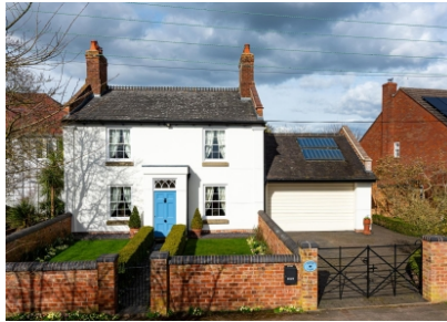
Park View, Park Lane, Lapley, Stafford, ST19 9JT