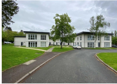
14 Danescourt Manor, Tettenhall