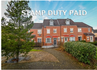
13 Hazledine Way, Bridgnorth