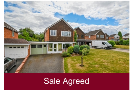
12 Rosemount Gardens, Ackleton, Wolverhampton