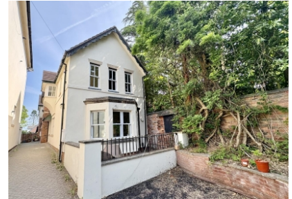
51a Compton Road West, Compton, Wolverhampton