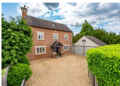
Orchard House, 6 Engleton Lane, Brewood, ST19 9DZ