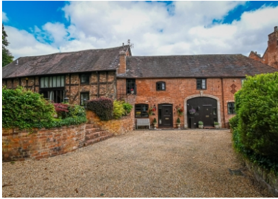
The Coach House, Stableford Mews, Bridgnorth