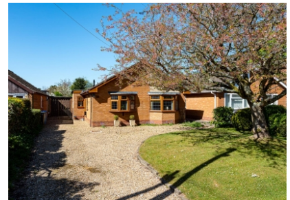
4 Shop Lane, Oaken, Wolverhampton, WV8 2AX