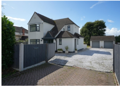
School House, Gospel Ash Road, Bobbington, Stourbridge