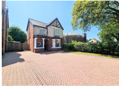
171 Coalway Road, Wolverhampton