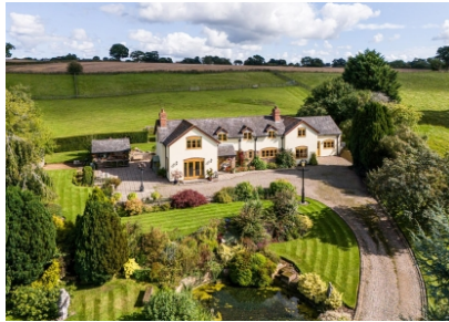
The Dairy Farm, Neenton, Bridgnorth