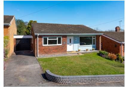
8 Fox Close, Seisdon, Wolverhampton, WV5 7HE