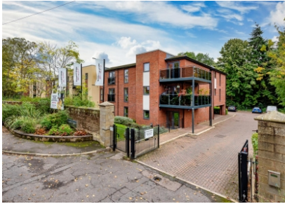
18 Thorneycroft, Wood Road, Tettenhall