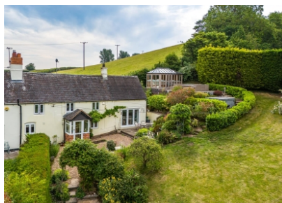
Sunny Bank Cottage, 8 Hill End, Claverley, Wolverhampton