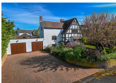
The Old Malthouse, Hilton, Bridgnorth