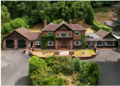
Warren Garth, Orton Lane, Wolverhampton