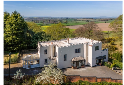
Tinkers Castle, Tinkers Castle Road, Seisdon, Wolverhampton