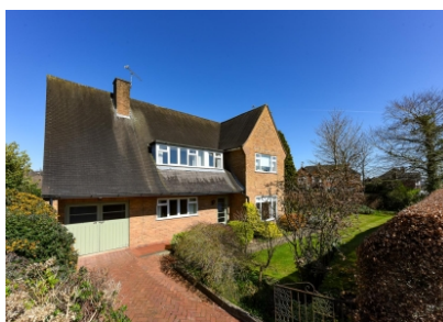
28 Springhill Park, Wolverhampton