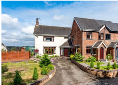
Woodbank Cottage, Hilton Lane, Shareshill, Wolverhampton, , WV10 7HU