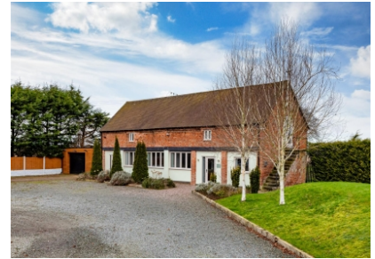
Offices, Newport, TF10 9BA