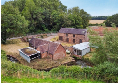
The Mill, Badger, Shropshire, WV6 7JU