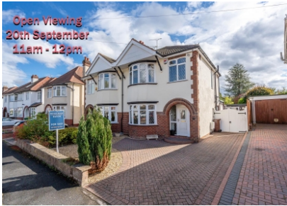
77 Woodland Road, Finchfield, Wolverhampton, WV3 8AP

Page 42 of 71 21 September 2025 21:32:48