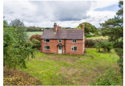
Nunfield Farm, Worcester Road, Pittingham, Wolverhampton, WV6 7EG