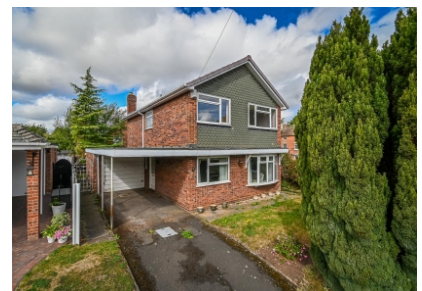
Chinook, 2 Folley Road, Ackleton, Wolverhampton