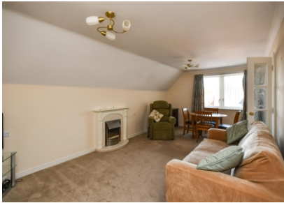
42 Wombrook Court, Wombourne, Wolverhampton

Page 61 of 71 21 September 2025 21:32:49