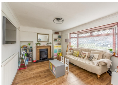
63 Meadow Lane, Wombourne, Wolverhampton