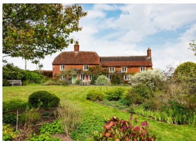
Upper Lea, Wall Hill, Claverley, Bridgnorth, WV15 5PW