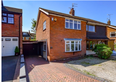
12 Calvin Close, Wombourne, Wolverhampton, South Staffordshire