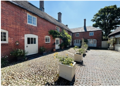
The Ostlers, 3 Patshull Hall Mews, Burnhill Green

Page 67 of 71 21 September 2025 21:32:49