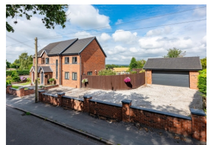
St Elvey, Hilton Lane, Shreshill, Wolverhampton, WV10 7HU