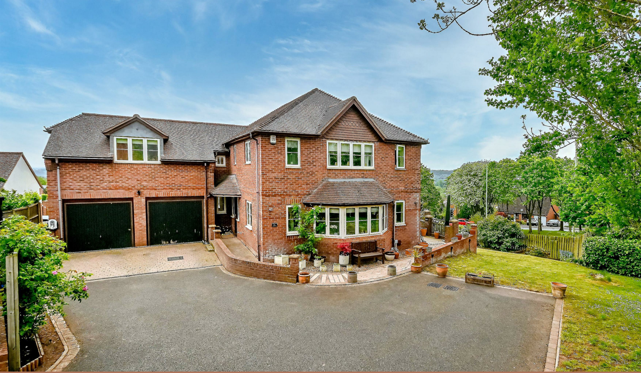
Alveley House, 2a Harley Way, Bridgnorth, Shropshire, WV16 5PA