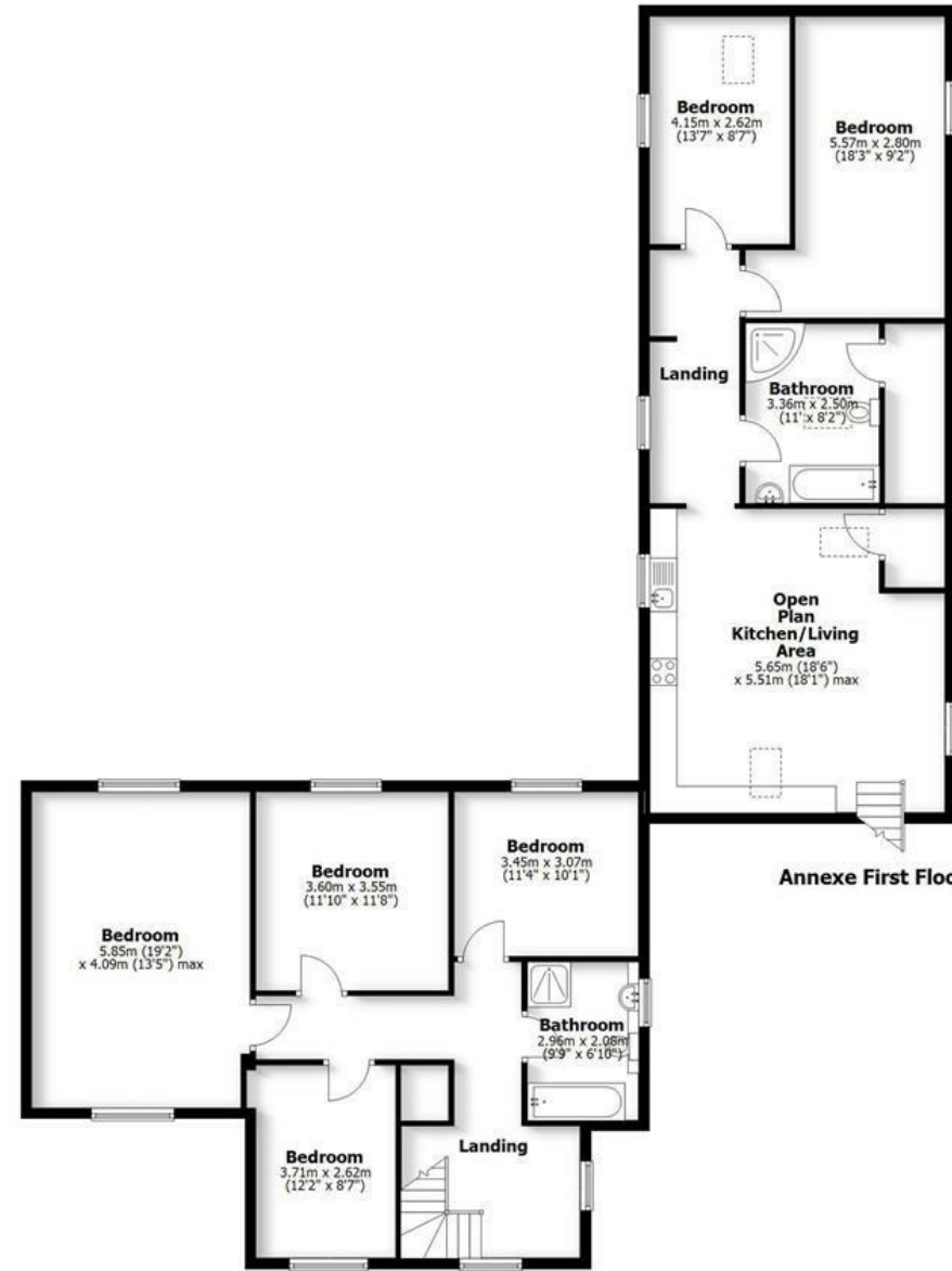
Annexe First Floor