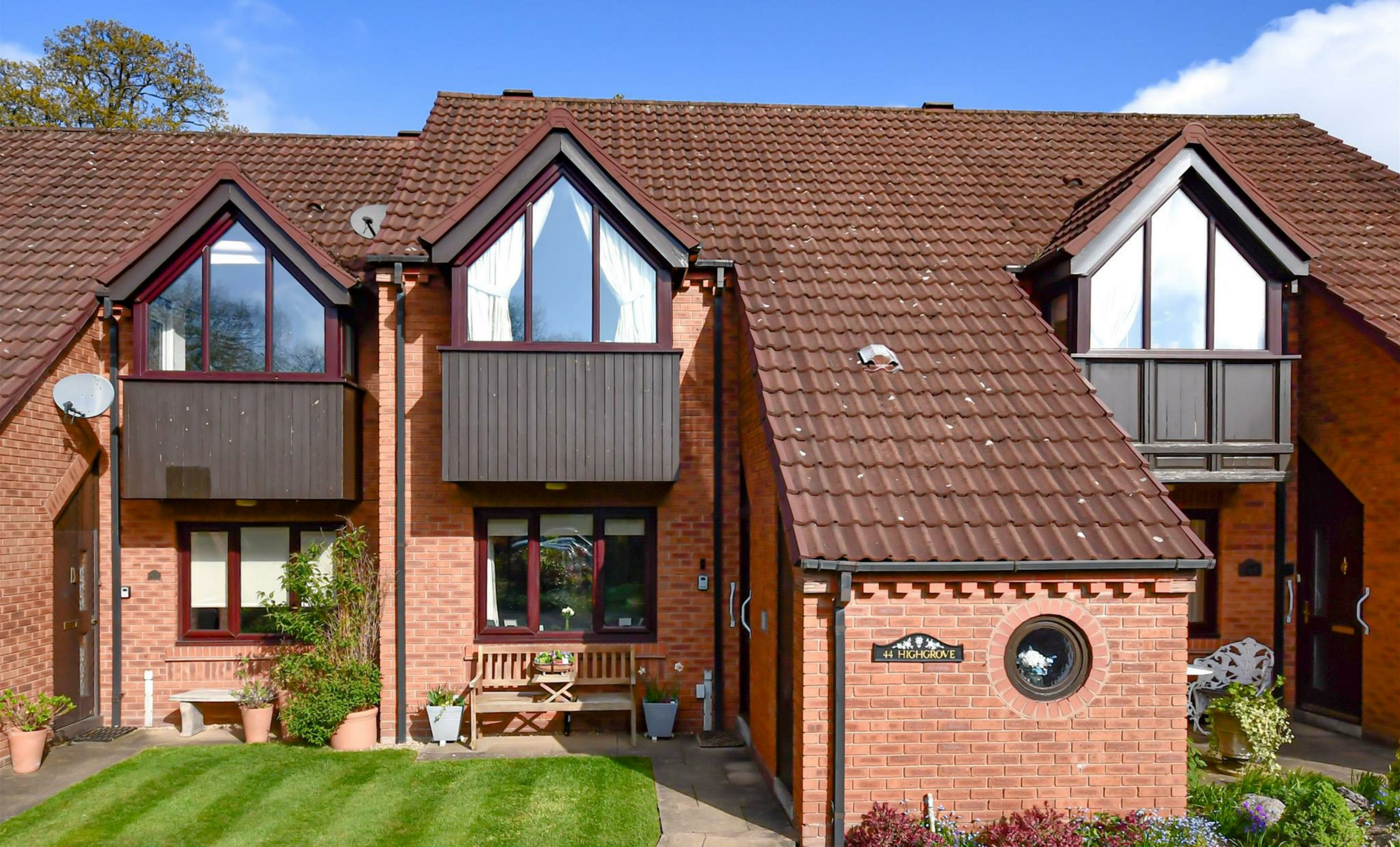
44 Highgrove, Tettenhall, Wolverhampton, WV6 8LQ