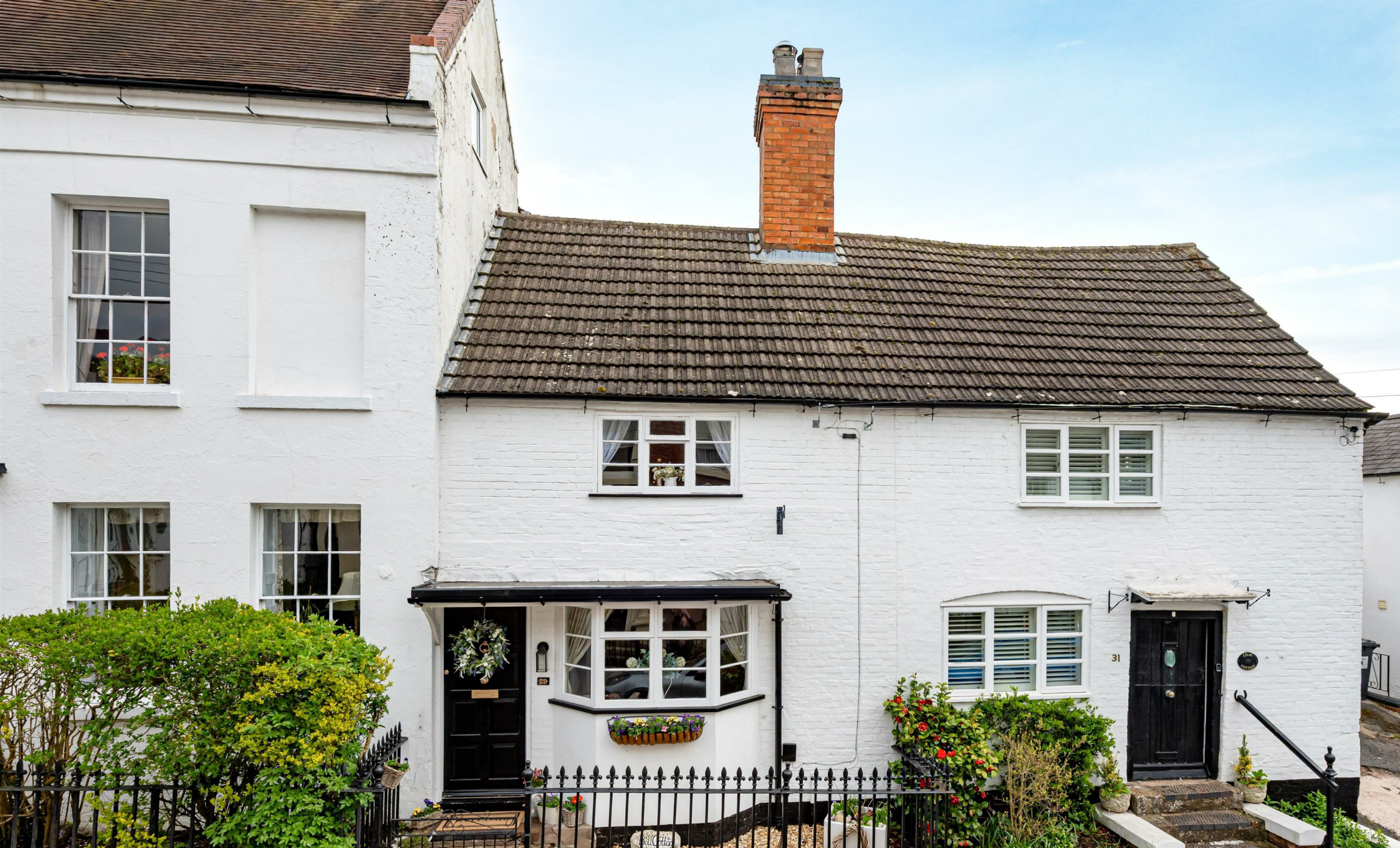
Bell Cottage, 29 Dean Street, Brewood, Stafford, ST19 9BU