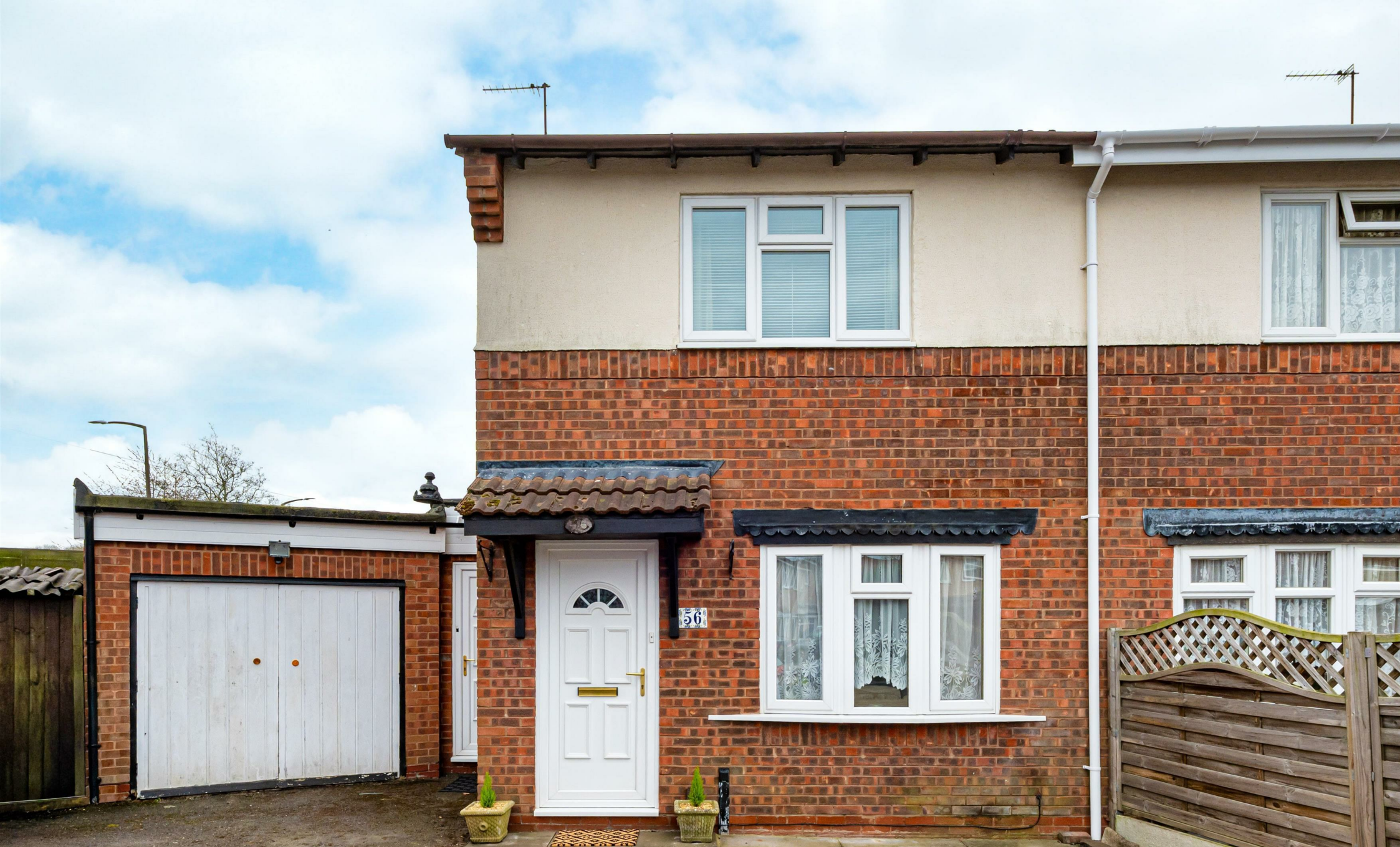
56 Tying Close, Pendeford, Wolverhampton, WV9 5QH