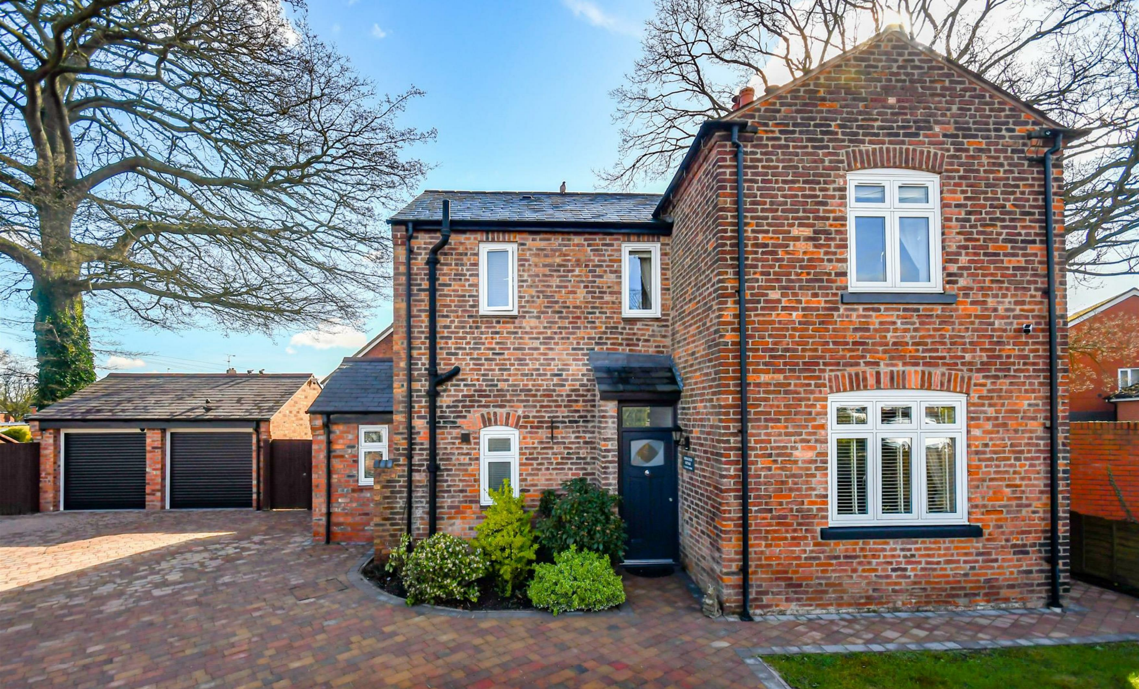
Springfield Cottage, 111 Taunton Avenue, Fordhouses, Wolverhampton, WV10 6PN