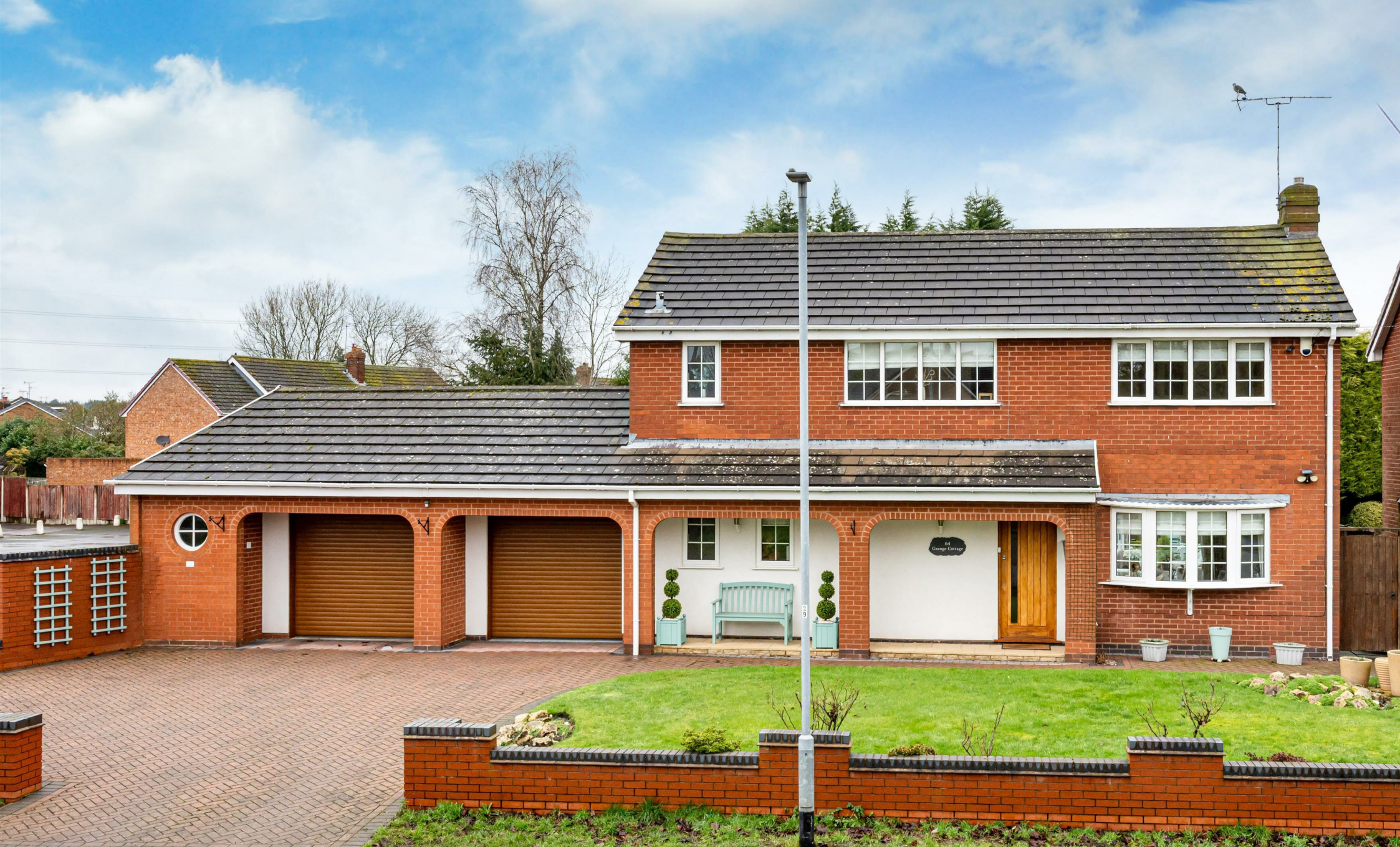
Grange Cottage, 64 Brewood Road, Coven, Wolverhampton, WV9 5DL