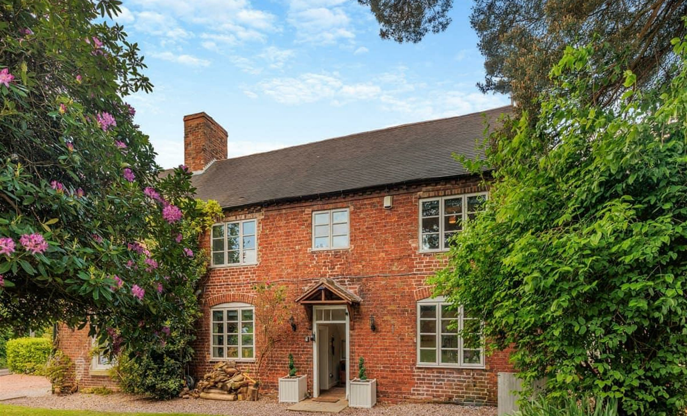
Blythbury Farmhouse Shifnal, TF11 9PQ