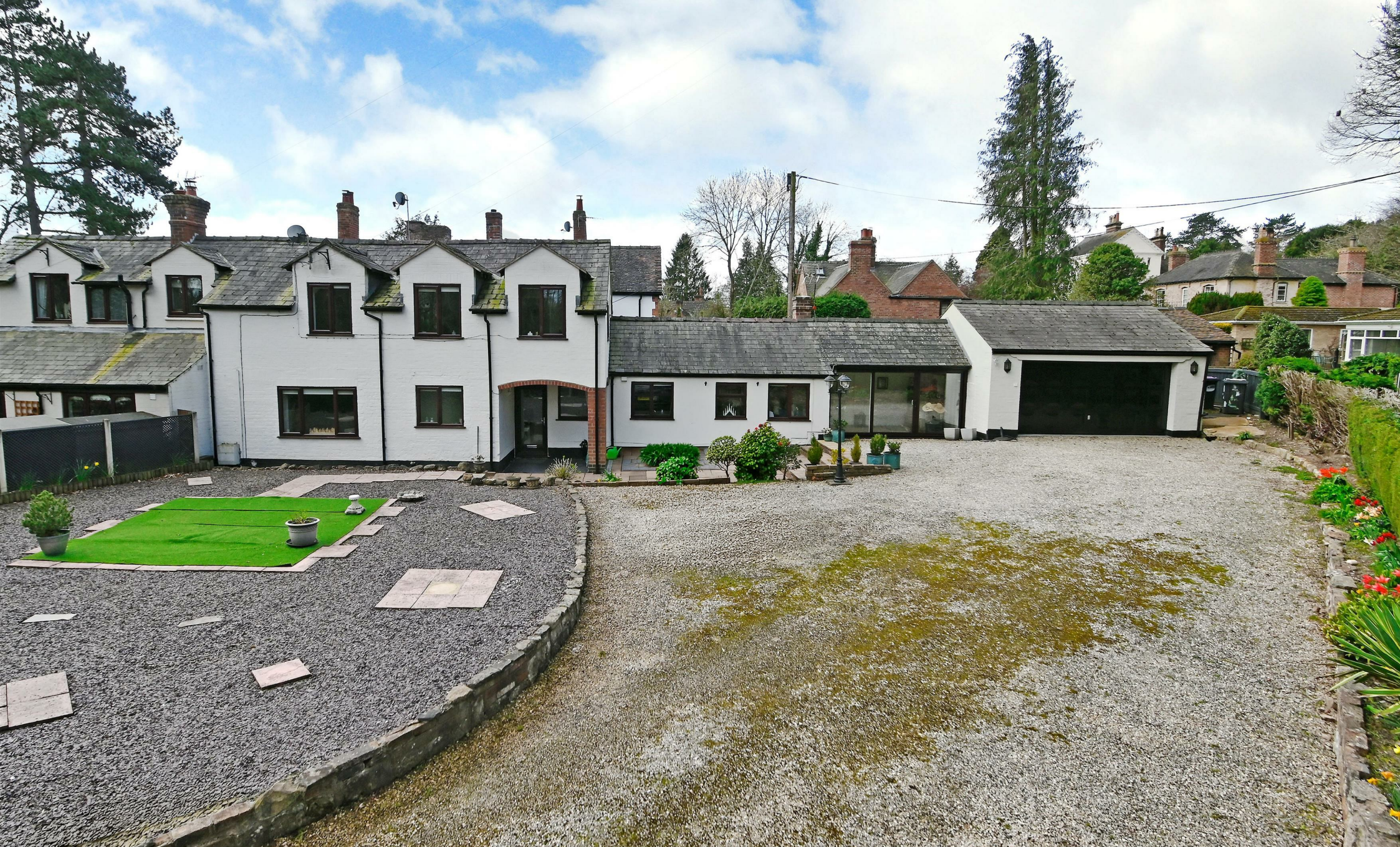
The Woodlands, Oldbury, Bridgnorth, Shropshire, WV16 5EE