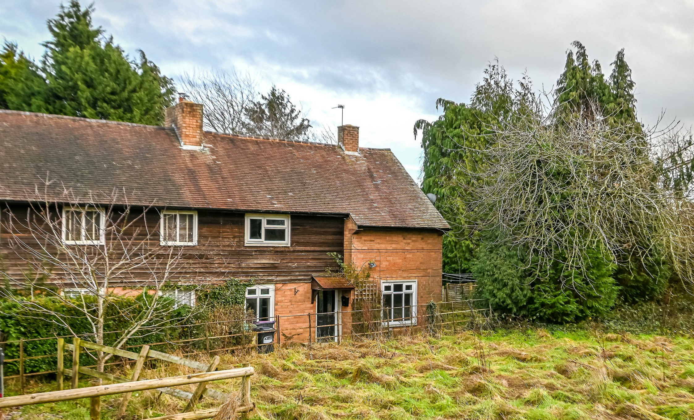
2 New Cottages Six Ashes, Bridgnorth, WV15 6EJ