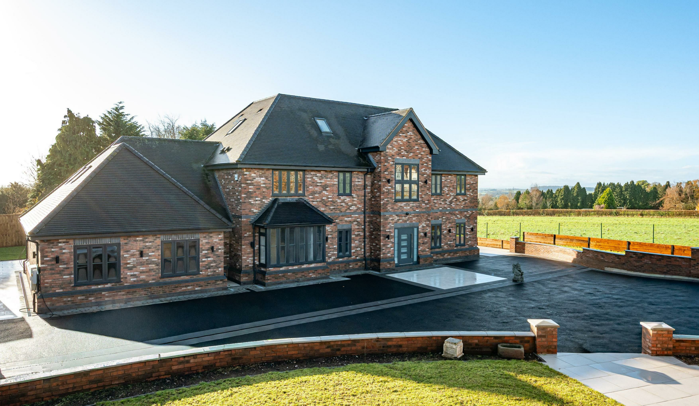
The Latter House, Pattingham Road, Perton Ridge, Wolverhampton, WV6 7HD